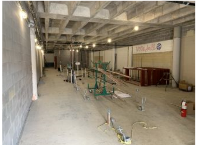
2022.07.13 – Athletic locker rooms