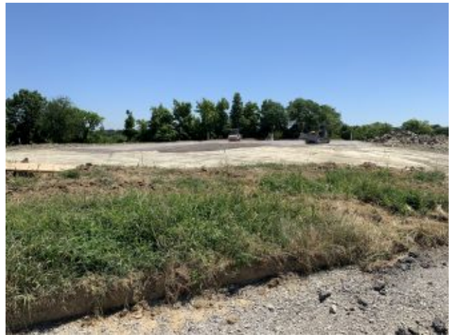
2022.06.30 – New tennis courts