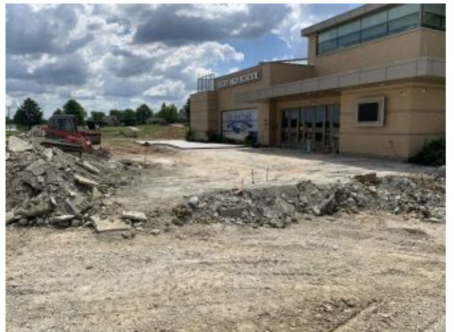
2022.07.13 – Scott entrance.