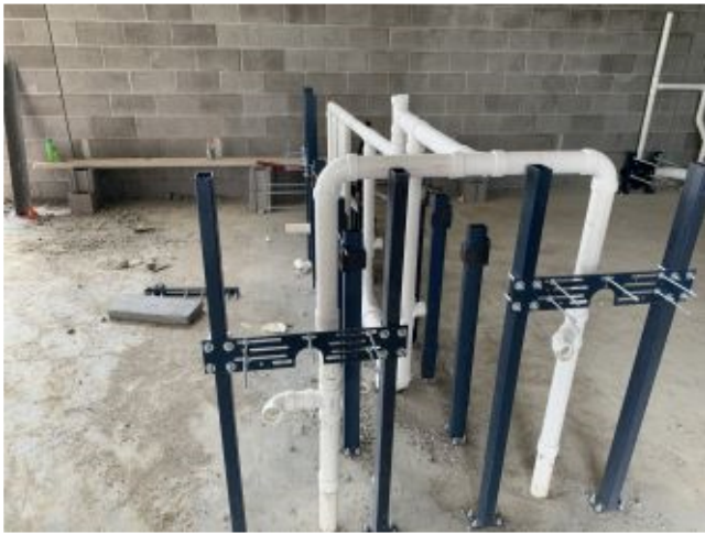
2022.07.13 – Public restroom near pool