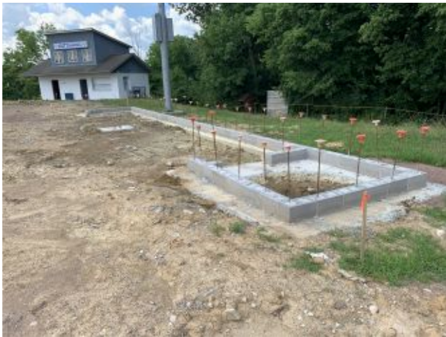
2022.07.13 – Home dugout