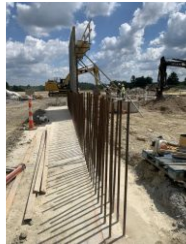
2022.07.13 – North wall of pool