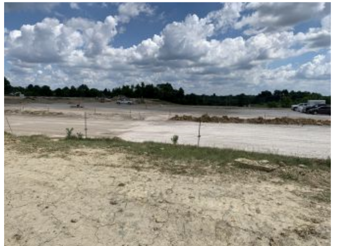
2022.07.13 – Parking lot