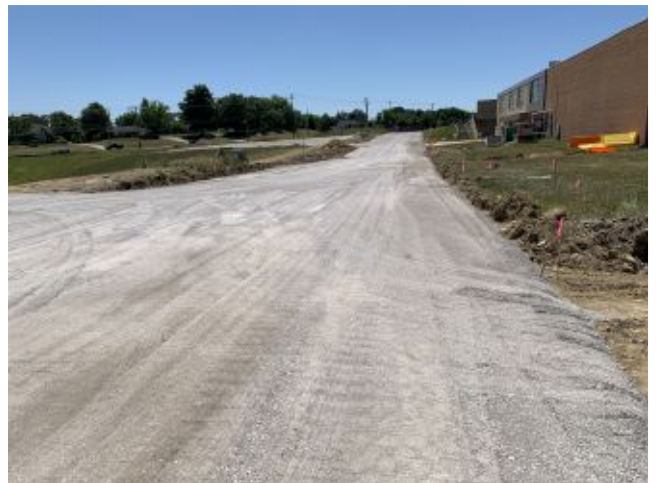
2022.06.30 – Lonneman Drive