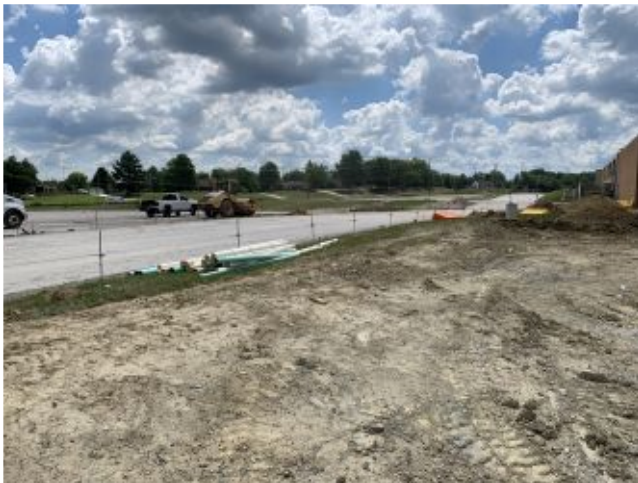
2022.07.13 – Lonneman Drive