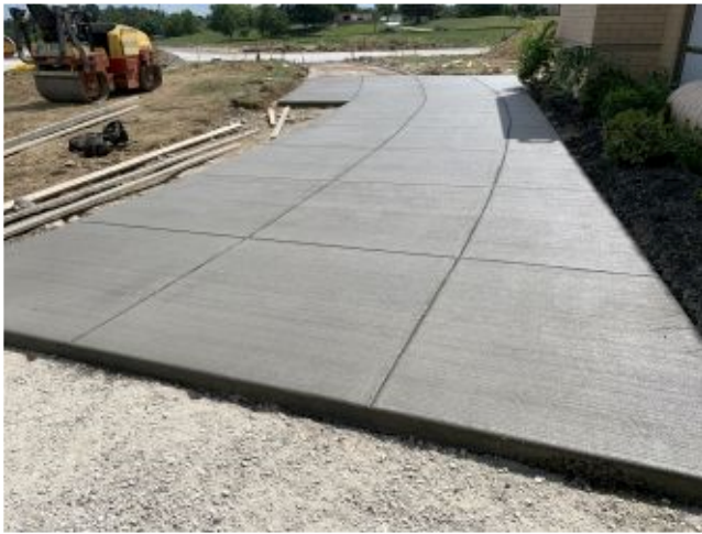
2022.07.13 – Scott entrance