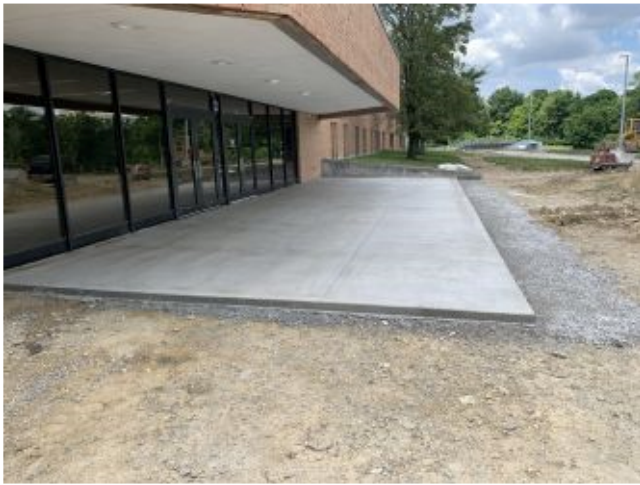
2022.07.13 – Woodland gym entrance