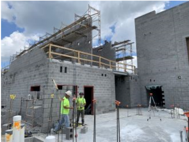
2022.07.13 – Second floor above practice gym locker rooms