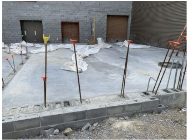
2022.07.13 – Monumental stair lobby