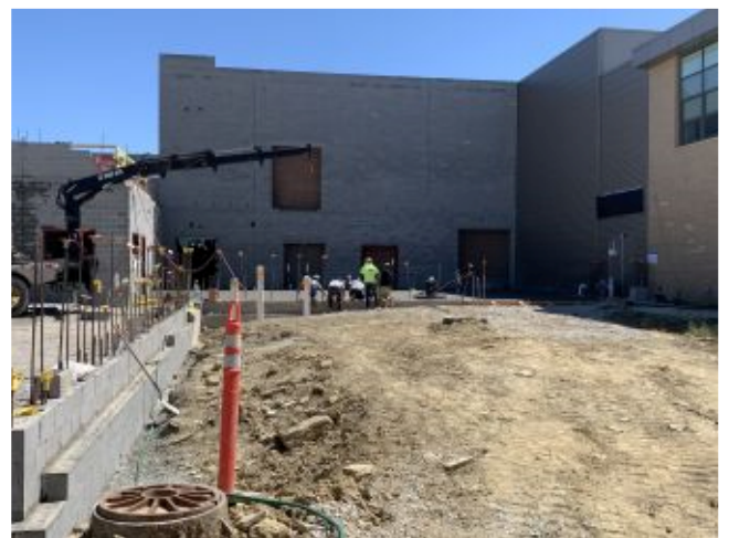
2022.06.30 – Scott monumental stair lobby