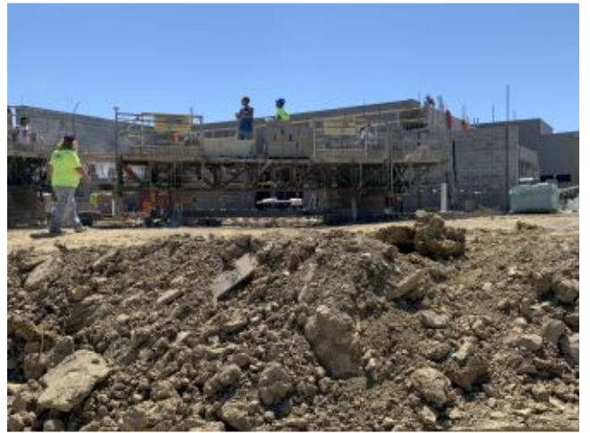
2022.06.30 – Pool / practice gym entry