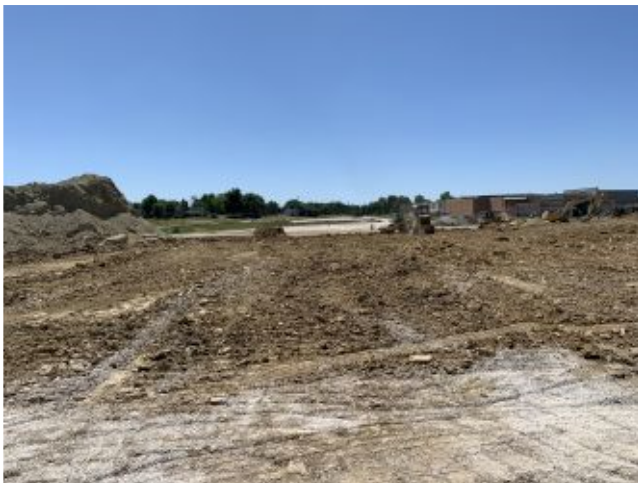
2022.06.30 – Former tennis courts