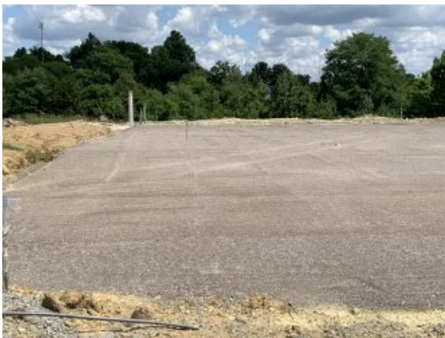
2022.07.13 – Tennis courts