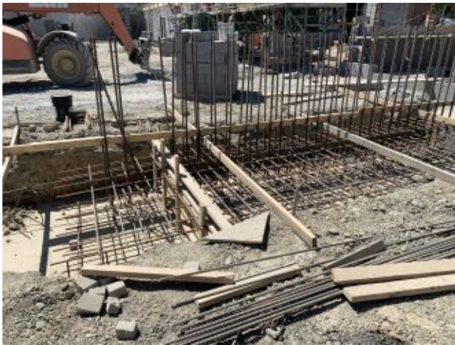
2022.06.30 – North wall of pool