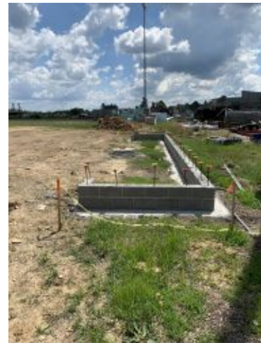
2022.07.13 – Visitor dugout