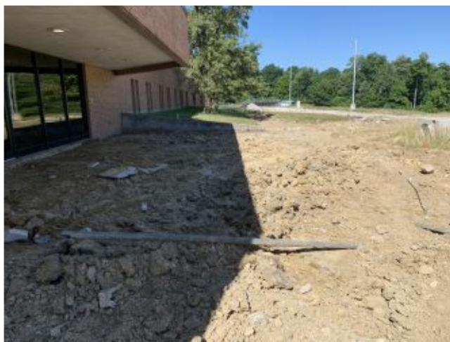
2022.06.30 – Woodland gym entrance