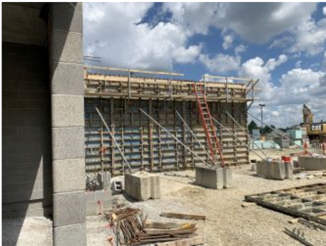
2022.07.13 – North wall of pool – West end