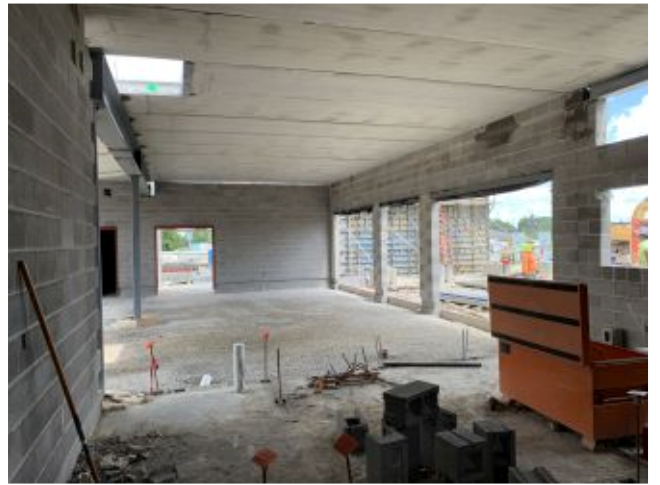
2022.07.13 – Pool lobby