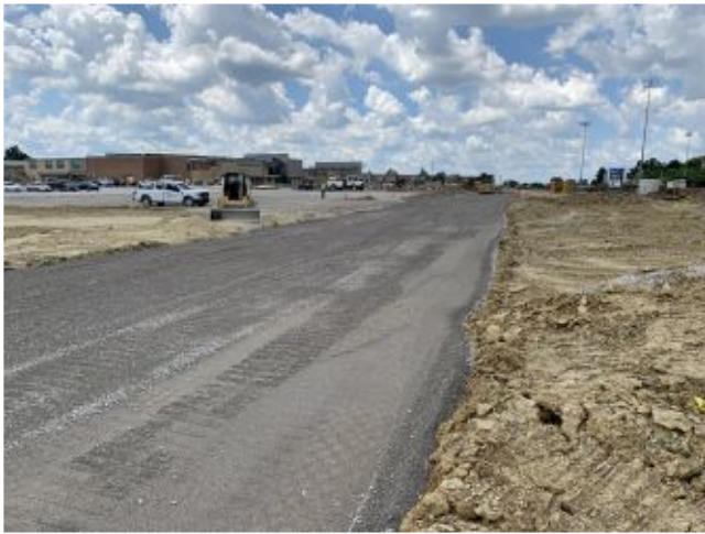
2022.07.13 – Eagle Drive towards Lonneman