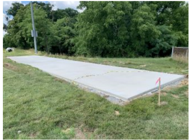
2022.07.13 – Batting cage