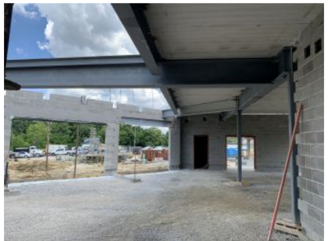
2022.07.13 – Pool / practice gym lobby