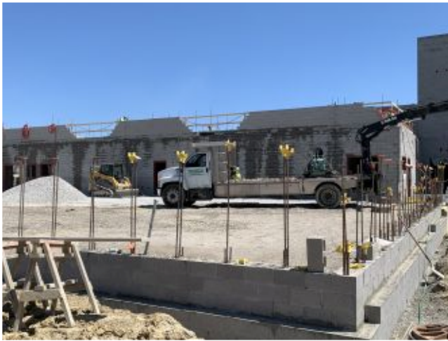
2022.06.30 – Practice gym