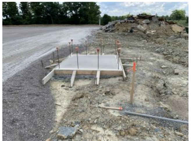
2022.07.13 – Tennis court shed