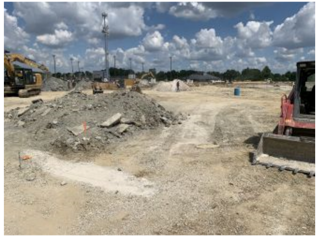
2022.07.13 – Looking towards Eagles Nest from entrance