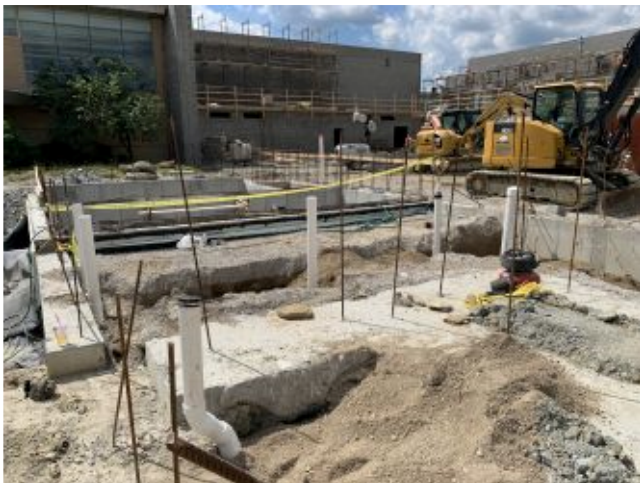
2022.07.13 – Pool equipment room