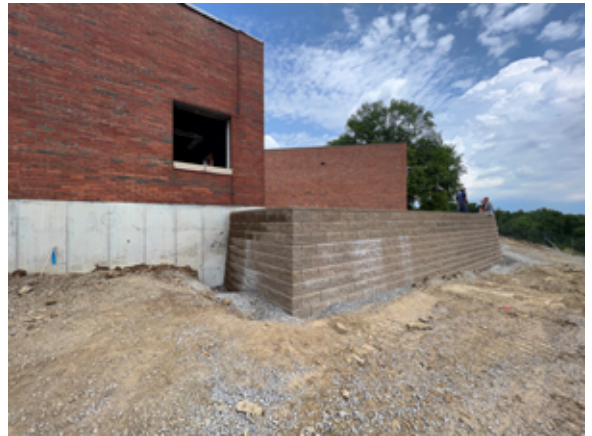
The new Allen Block retaining wall has been installed.