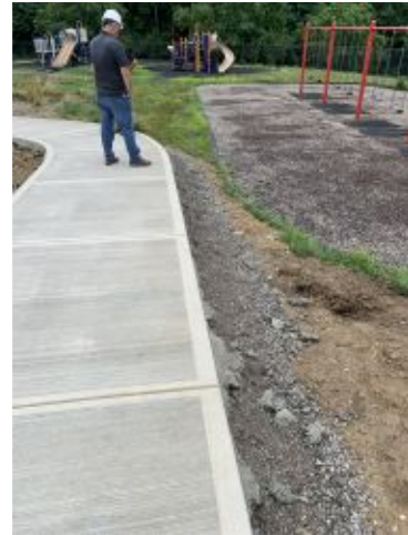
2022.07.07 – Playground sidewalk