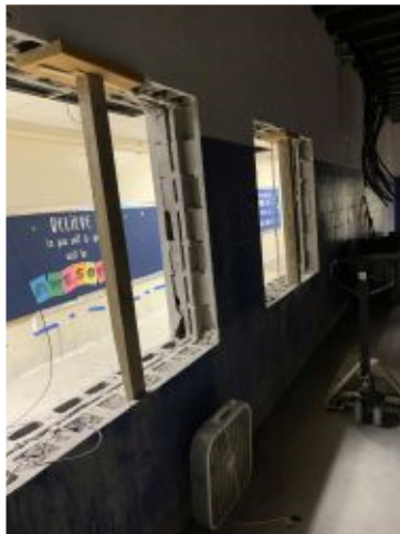
2022.06.23 – Window opening at former gymnasium