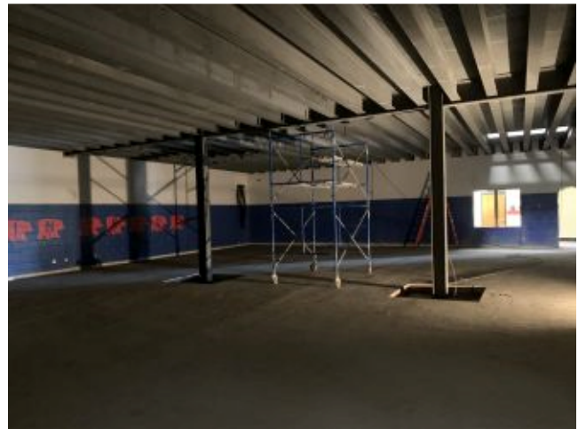
2022.06.23 – Floor infill framing at former gymnasium