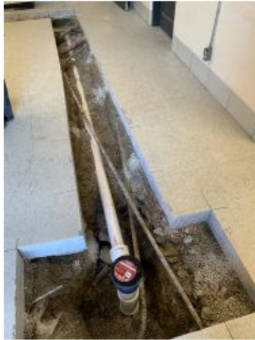
2022.06.23 – Below slab plumbing at Kitchen receiving