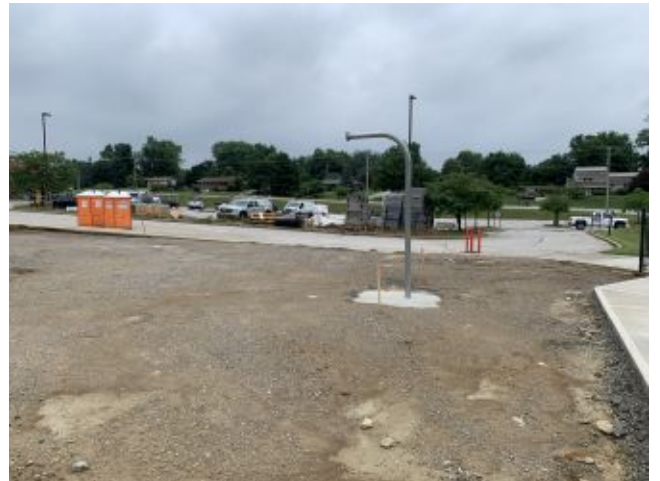
2022.07.07 – Basketball goal support post