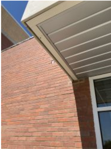
2022.06.23 – Installed soffit panels