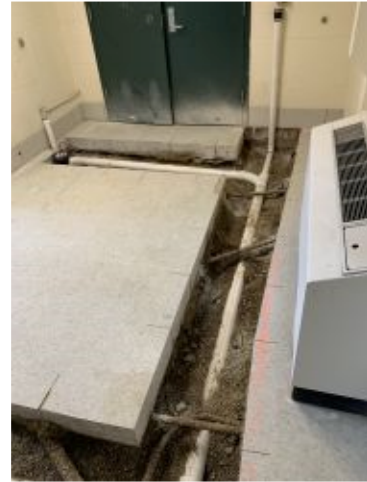
2022.06.23 - Below slab plumbing at Kitchen receiving