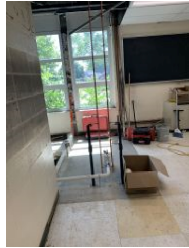
2022.06.23 – Plumbing at preschool restroom