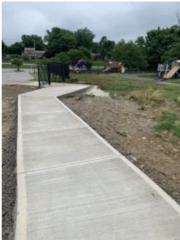
2022.07.07 – Playground sidewalk