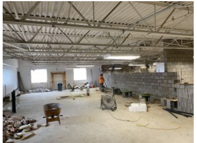
2022.07.07 – 2 nd floor classrooms