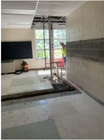
2022.06.23 – Plumbing at preschool restroom