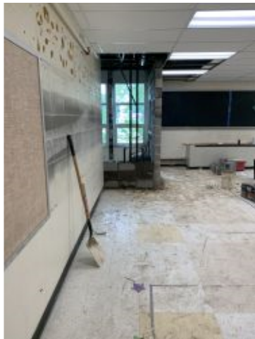
2022.07.07 – Preschool restroom