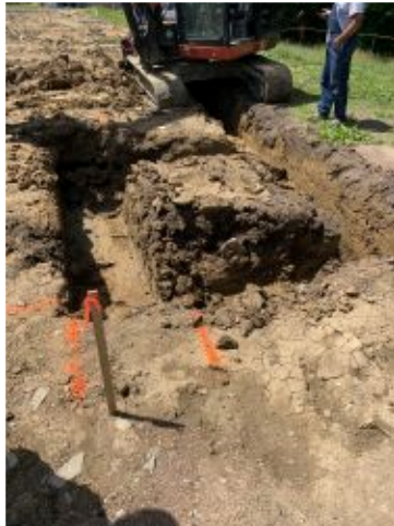
2022.06.15 – Home dugout excavation