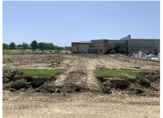
2022.06.15 – Former parking lot