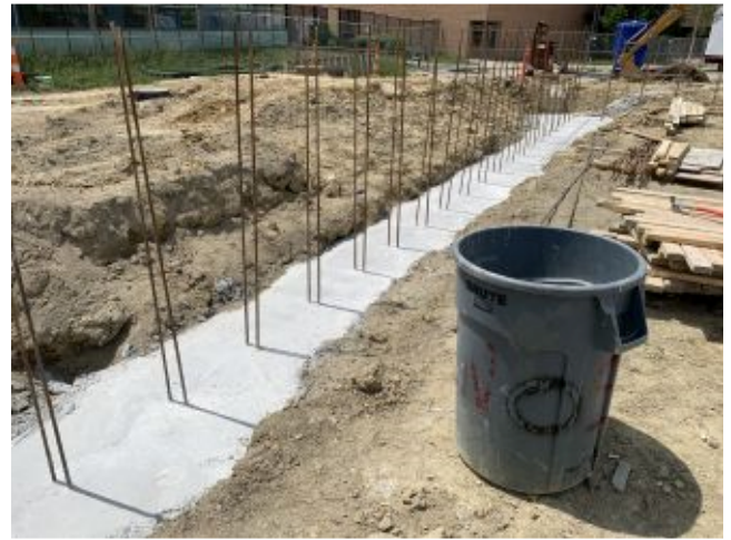
2022.06.01 – Grade beam at south wall of practice gym