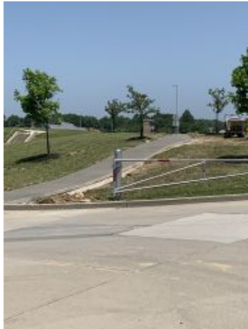
2022.06.15 – Sidewalk in front of monument sign