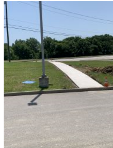
2022.06.15 – South sidewalk to Pride Parkway