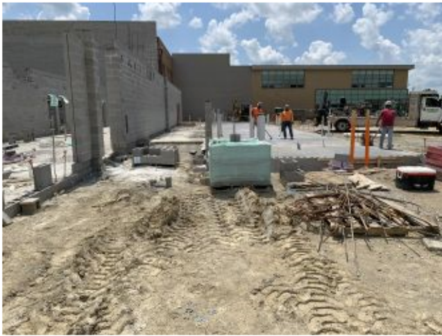
2022.06.01 – Saw cutting at practice gym locker rooms