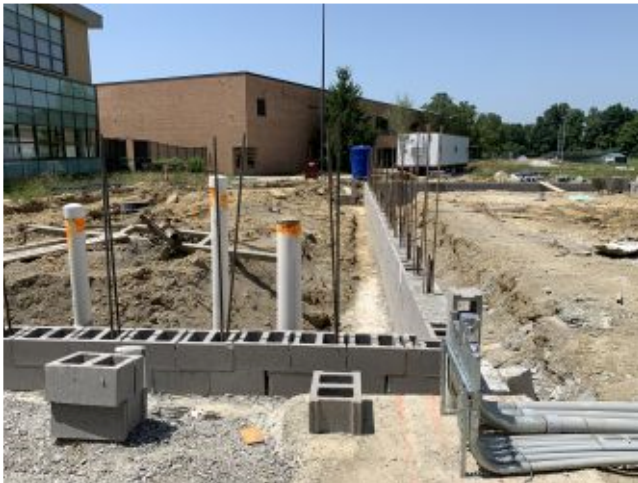
2022.06.15 – South wall of practice gym