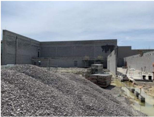
2022.06.08 – Looking south towards pool changing rooms