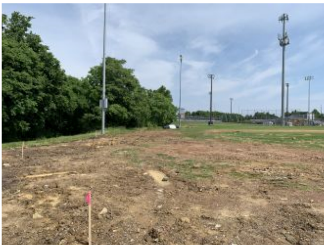
2022.06.08 – Former home dugout location