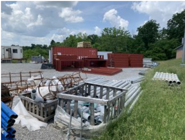
2022.06.01 – Door frames staged for installation

32.02: 2022.06.15 – Sidewalks from monument sign to Pride Parkway had recently been poured.