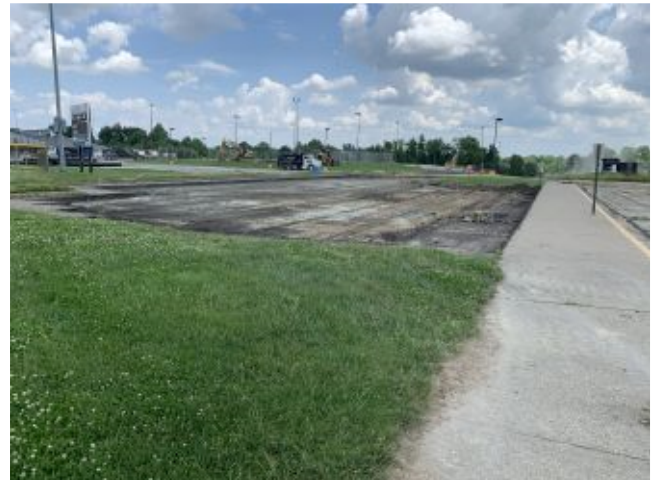
2022.06.01 – Milled asphalt at student parking