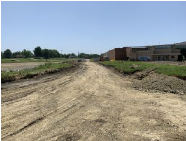
2022.06.15 – Lonneman Drive