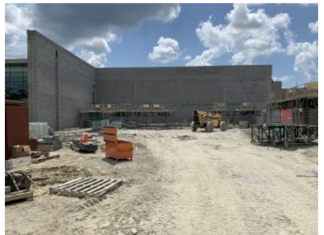
2022.06.01 Looking towards pool changing rooms