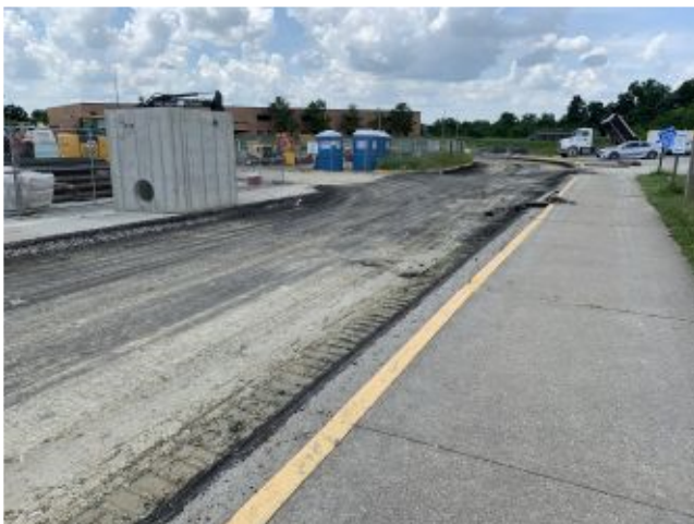
2022.06.01 – Milled drive back to Woodland