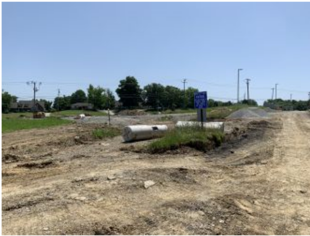
2022.06.15 – Band practice lot