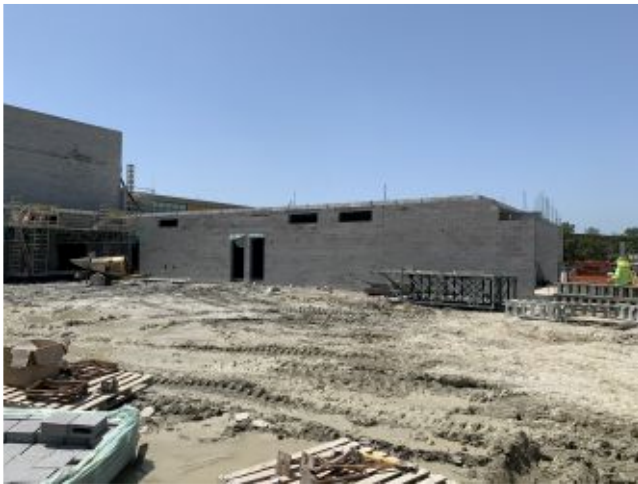
2022.06.15 – Looking towards pool locker rooms