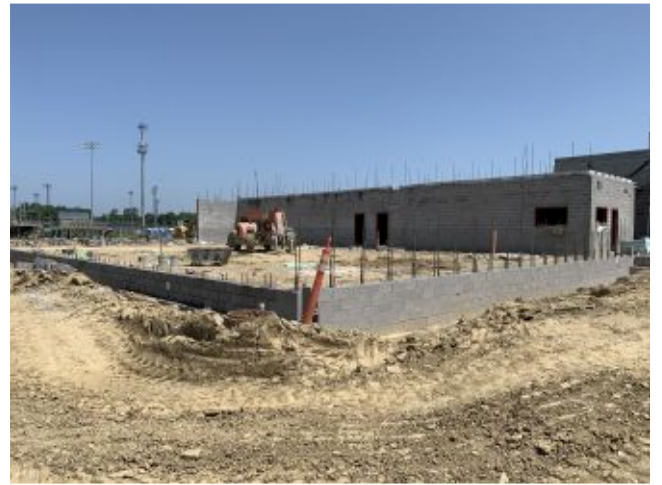
2022.06.15 – Looking northeast from outside of practice gym