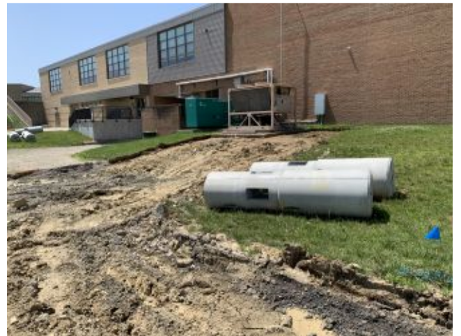
2022.06.15 – Precast light pole bases