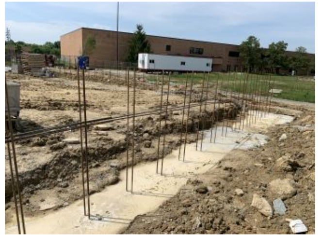
2022.06.08 – North wall of practice gym