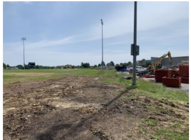
2022.06.08 – Former visitor dugout location