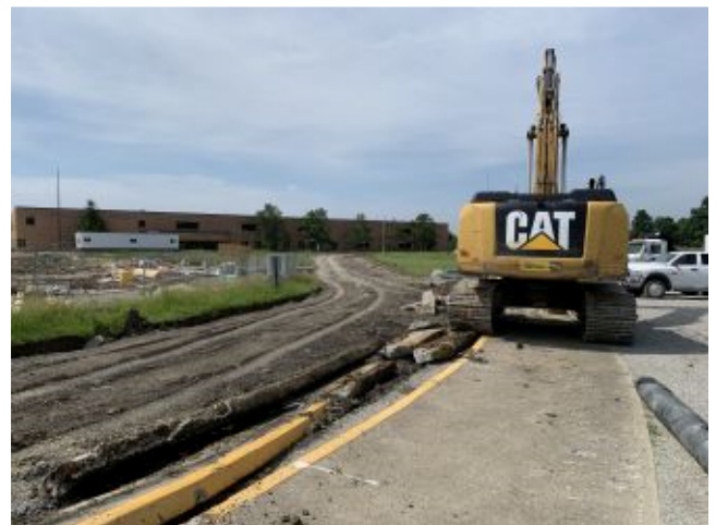
2022.06.08 – Curb and walk removal