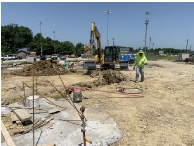
2022.06.15 – Excavation south of pool entry