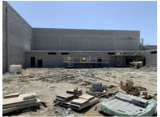
2022.06.15 – Looking towards pool changing rooms