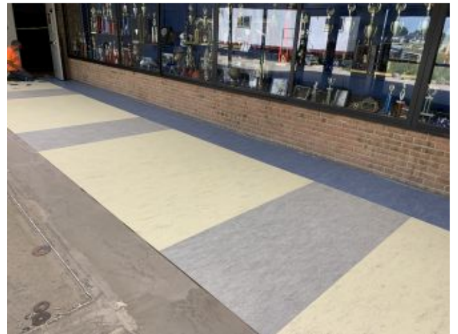
2022.06.15 – Woodland gym lobby