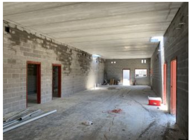
2022.06.15 – Looking south in practice locker rooms