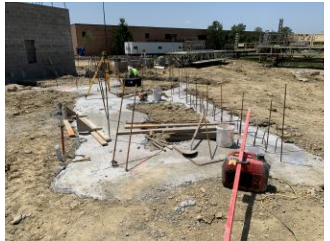
2022.06.15 – Pool entry