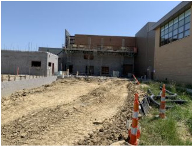
2022.06.15 – Looking east towards Grid 6.4