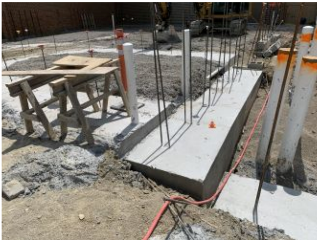
2022.06.01 – Grade beams at monumental stair