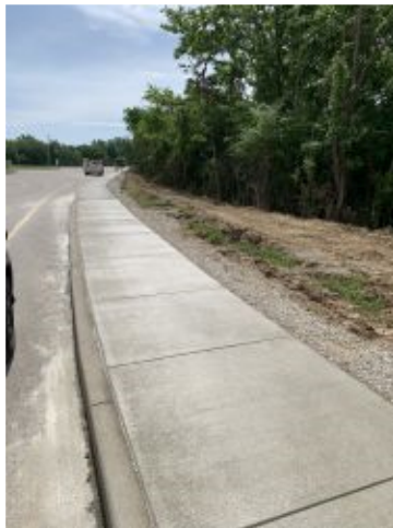
2022.06.08 – Sidewalk at south end of campus