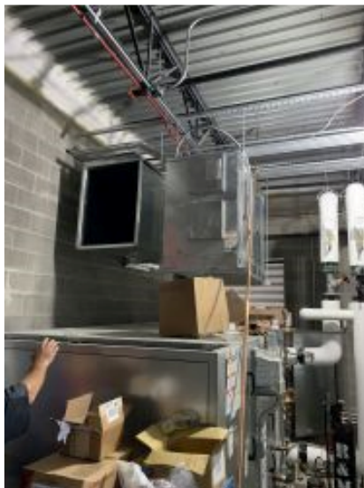
2022.05.26 – ERV at mechanical mezzanine