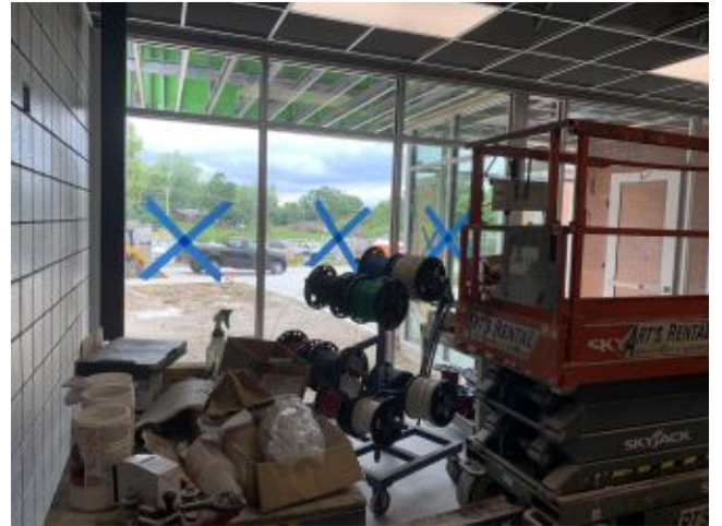
2022.06.09 – Glass at gym entry