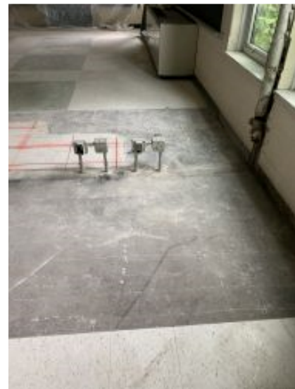
2022.06.09 – Demo at preschool restroom