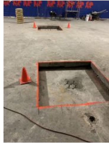
2022.06.09 – Column pads in media center.