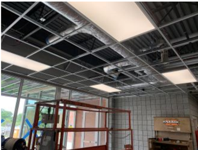
2022.06.09 – Grid and lights at gym lobby