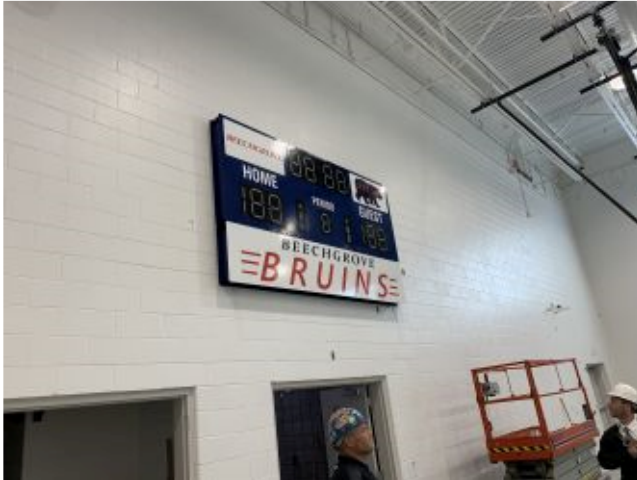
2022.05.26 – Gymnasium scoreboard

20-28.02: 2022.06.09 – Lighting was operational in the gym lobby and PE office. Plumbing fixtures were on-site for installation.