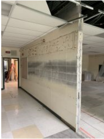
2022.06.09 – Demo at preschool restroom