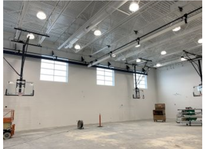
2022.05.26 – Backboards, divider, and archery net installed