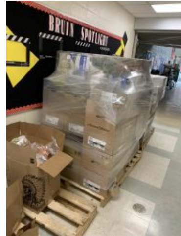
2022.06.09 – Plumbing fixtures