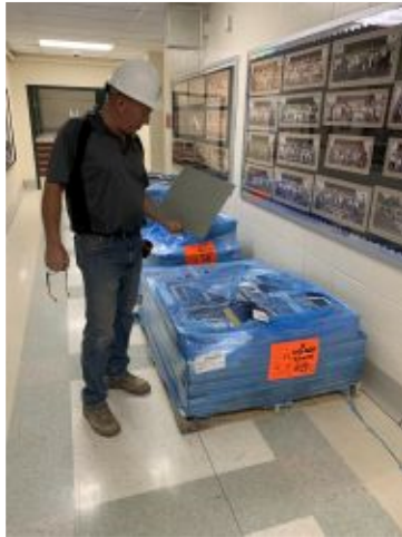
2022.06.09 – Linoleum flooring