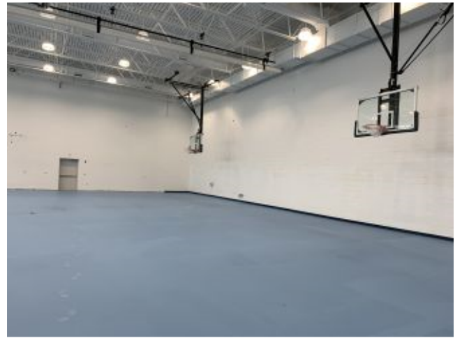
2022.06.09 – Gym floor