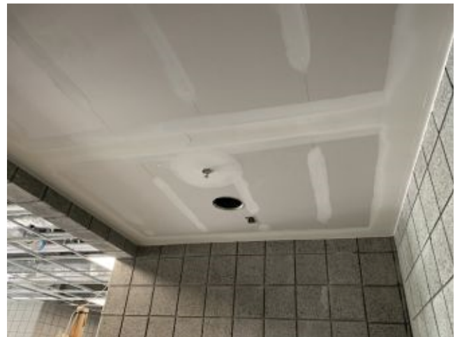
2022.06.09 – Drywall ceiling at restrooms