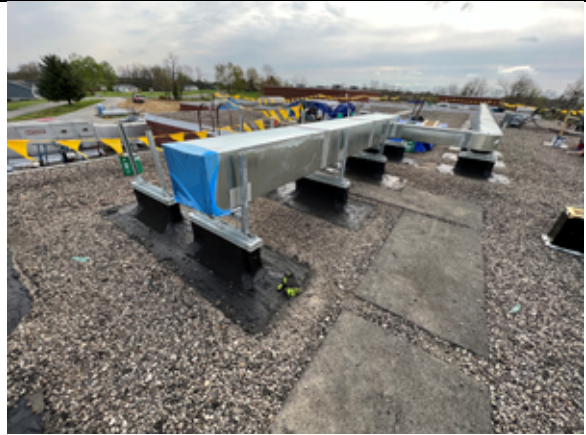
2022.04.26 Installation of the roof top equipment supports is in progress.