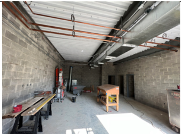
2022.05.10 Installation of the MEP items in the new addition is in progress.