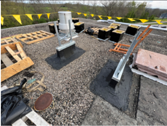
2022.04.26 Installation of the roof top equipment supports is in progress.