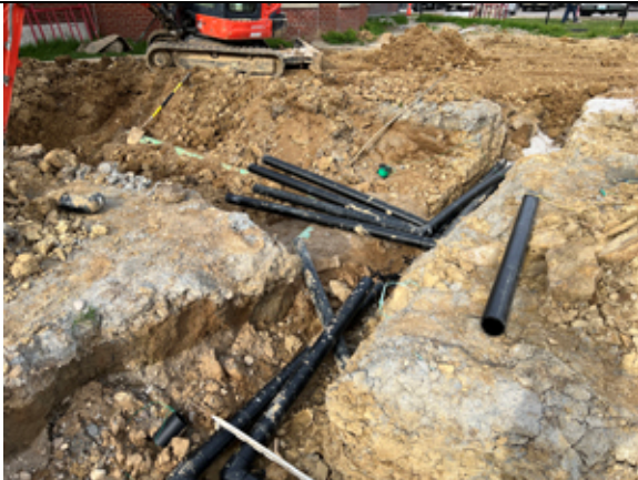
2022.04.26 The piping for the geothermal field is being brought into the building.