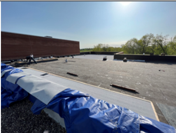
2022.05.10 Installation of the roofing on the new addition continues.