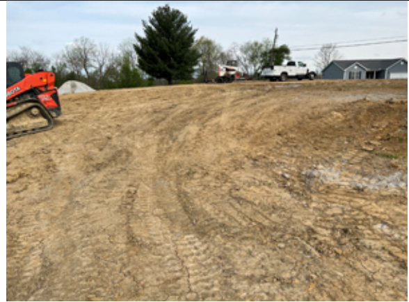
2022.04.26 The trenches for the geothermal field have been backfilled and graded.