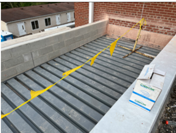
2022.04.26 Installation of the metal deck has been completed. Installation of the roofing and equipment supports has started.