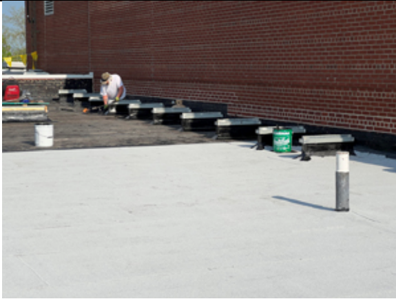
2022.05.10 Installation of the roofing on the new addition continues.