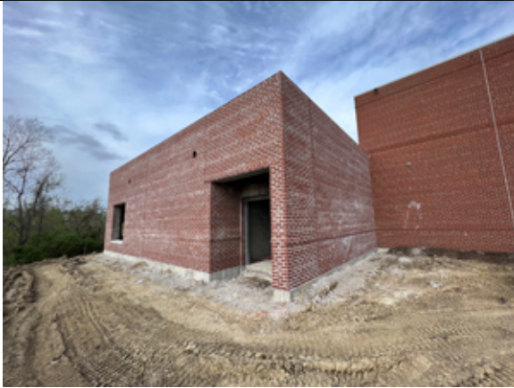
2022.04.26 Installation of the brick is nearing completion.