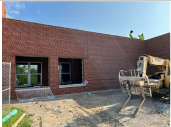
2022.05.10 The new brick work is complete and has been cleaned.