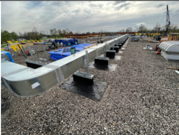
2022.04.26 Installation of the roof top equipment supports is in progress.