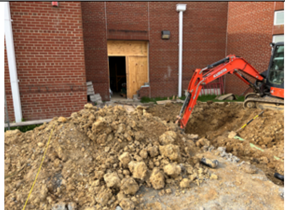
2022.04.26 The piping for the geothermal field is being brought into the building.