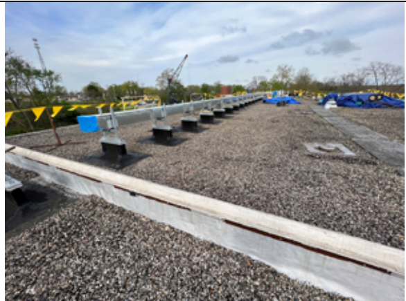
2022.04.26 Installation of the roof top equipment supports is in progress..