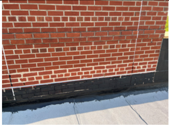
2022.05.10 The new counterflashing has been installed on the existing gym wall.