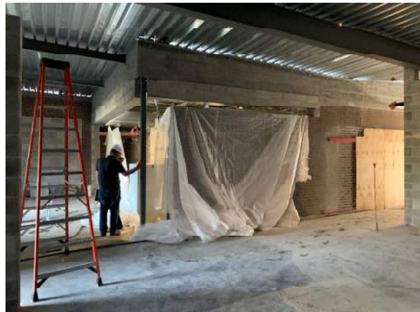
Kitchen – view towards future office & ex. mech rm