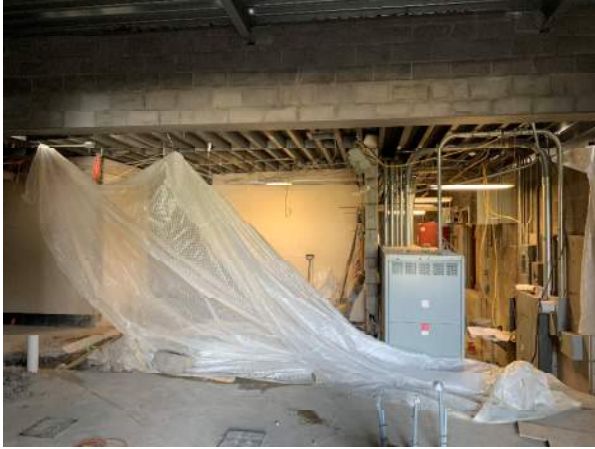
Kitchen – view towards future office & ex. mech rm