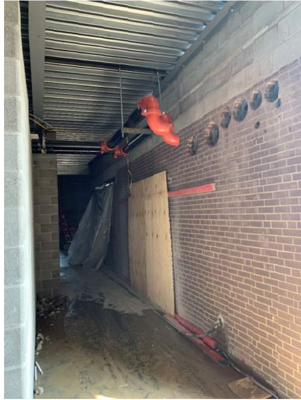
Corridor to kitchen