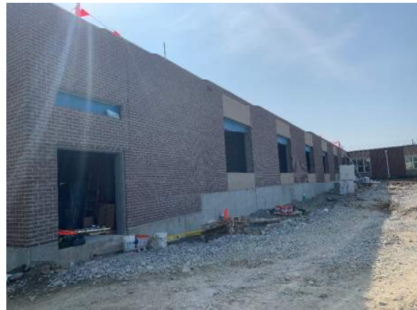
West elevation – classrooms