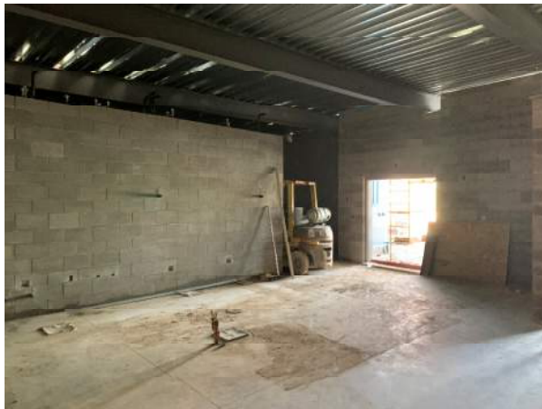
Kitchen – view towards receiving area