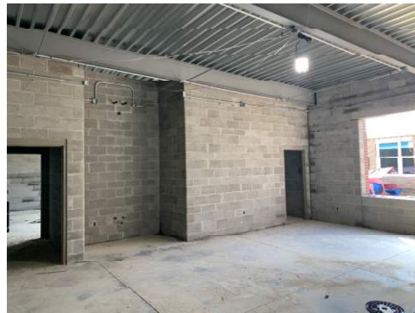
Preschool classroom – interior