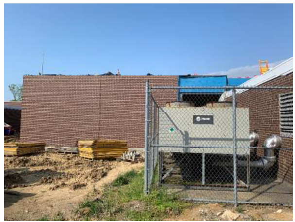
Preschool classroom wing – east elevation