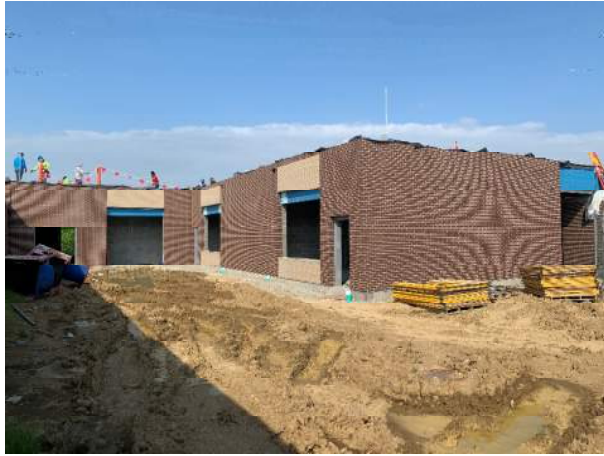
Preschool courtyard and classrooms