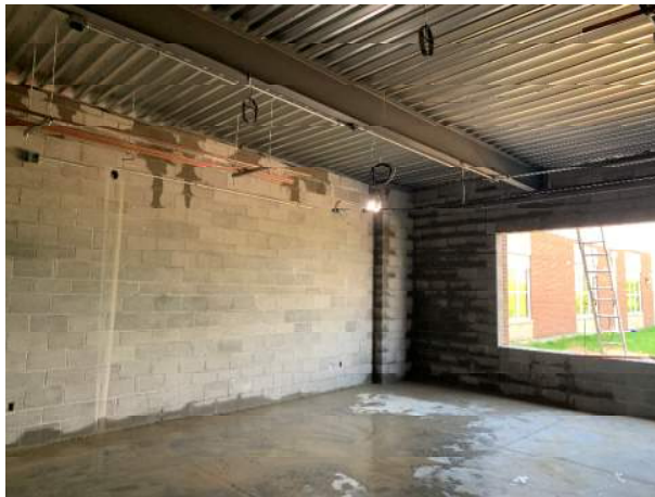
Typical classroom – interior