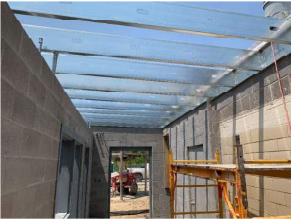
Kitchen addition roof framing