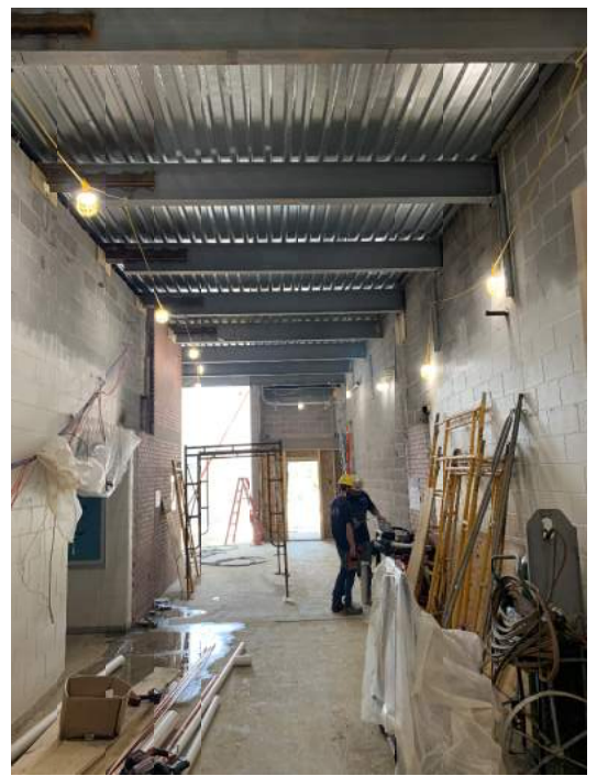
Classroom addition – first floor corridor