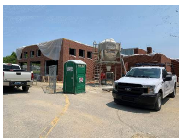
Cafeteria and kitchen additions