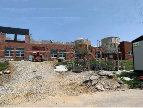
Classroom addition – east end cmu beginning