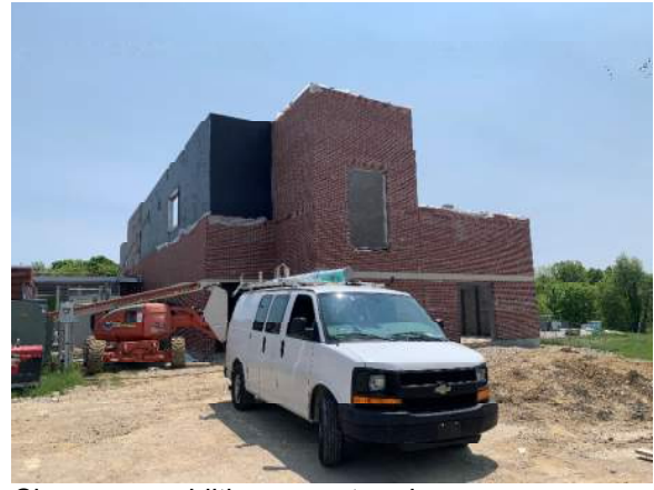
Classroom addition – west end