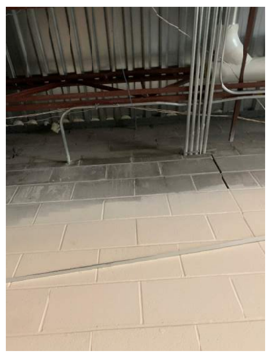
First floor interior classroom demising wall extension

\hfill \square Please acknowledge receipt of transmitted items.