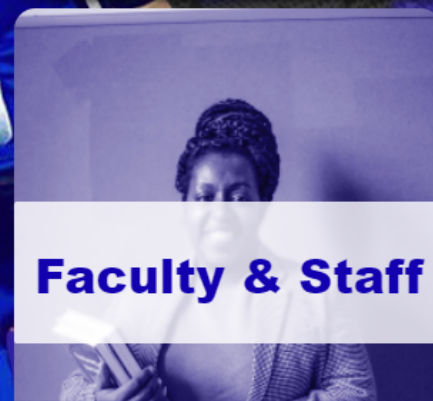
Faculty & Staff