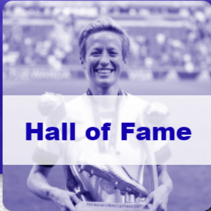
Hall of Fame