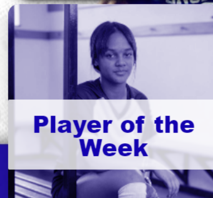
Player of the Week