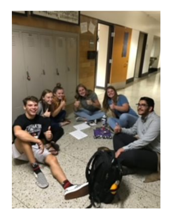
Dixie's Scholar Club