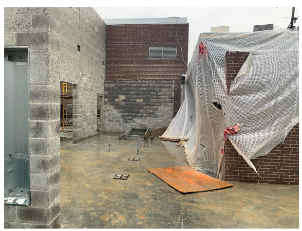
Kitchen looking toward cafeteria