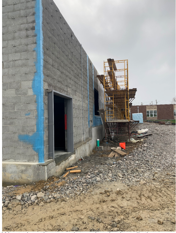
West elevation - moisture barrier installation