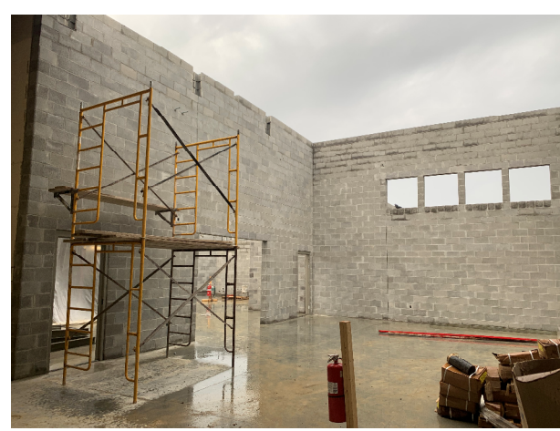
Cafeteria addition - interior looking towards kitchen