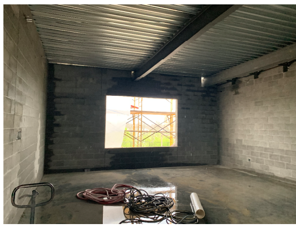
Typical west classroom