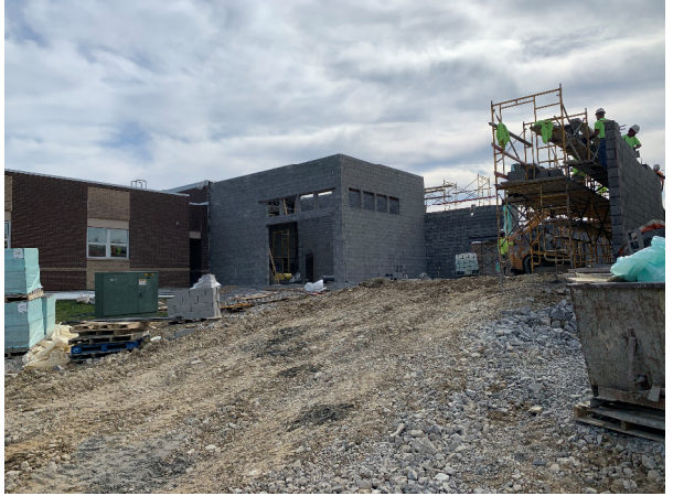
Cafeteria addition - exterior view