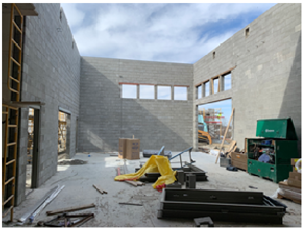
Cafeteria addition - interior view