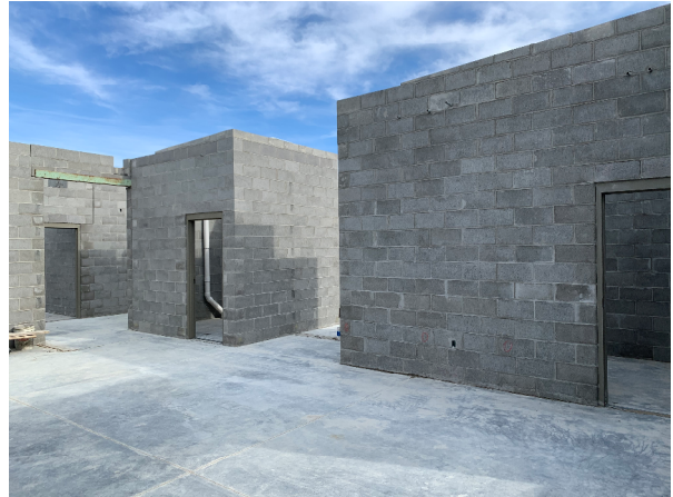
Preschool bathroom and storage room