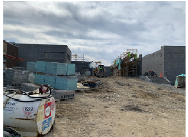
Full addition - north elevation