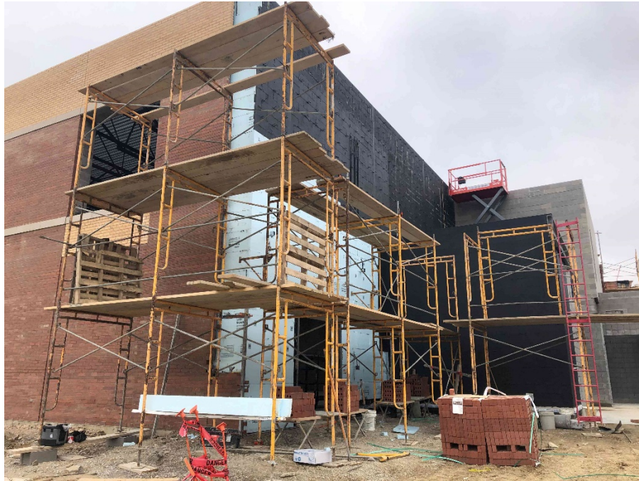
Masonry veneer and cast stone installation is on going.