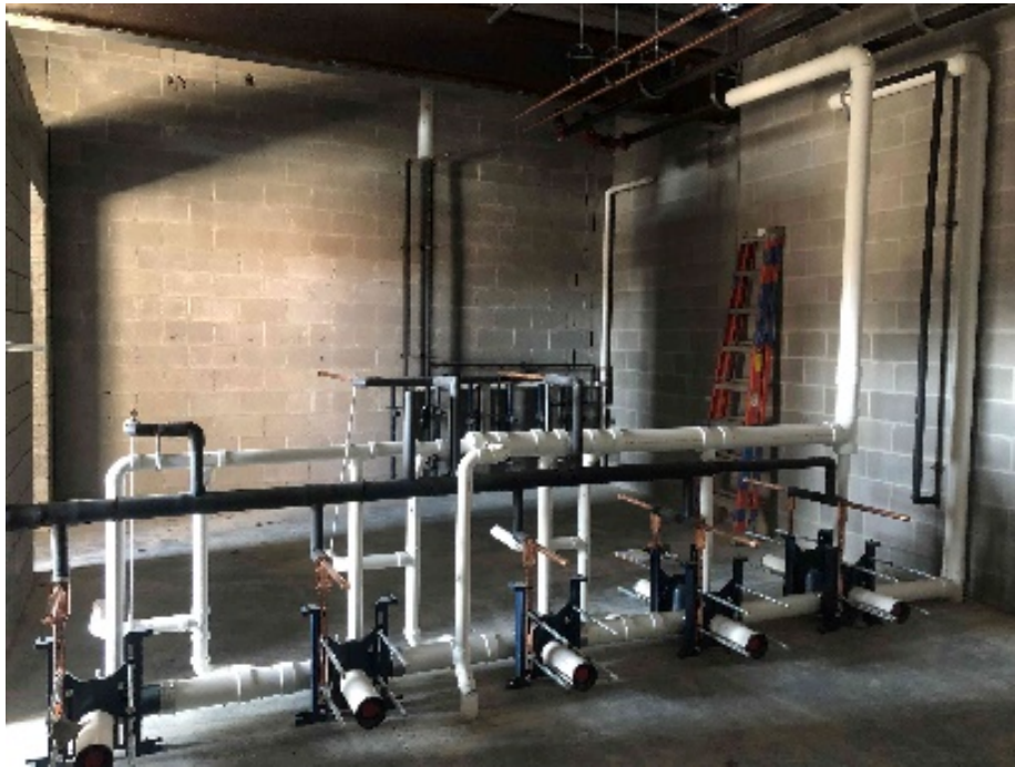
Plumbing rough-ins in new Restrooms 1508 and 1509 are complete.