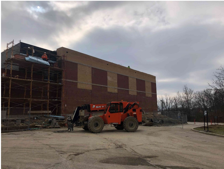
Masonry veneer and cast stone installation is on going.