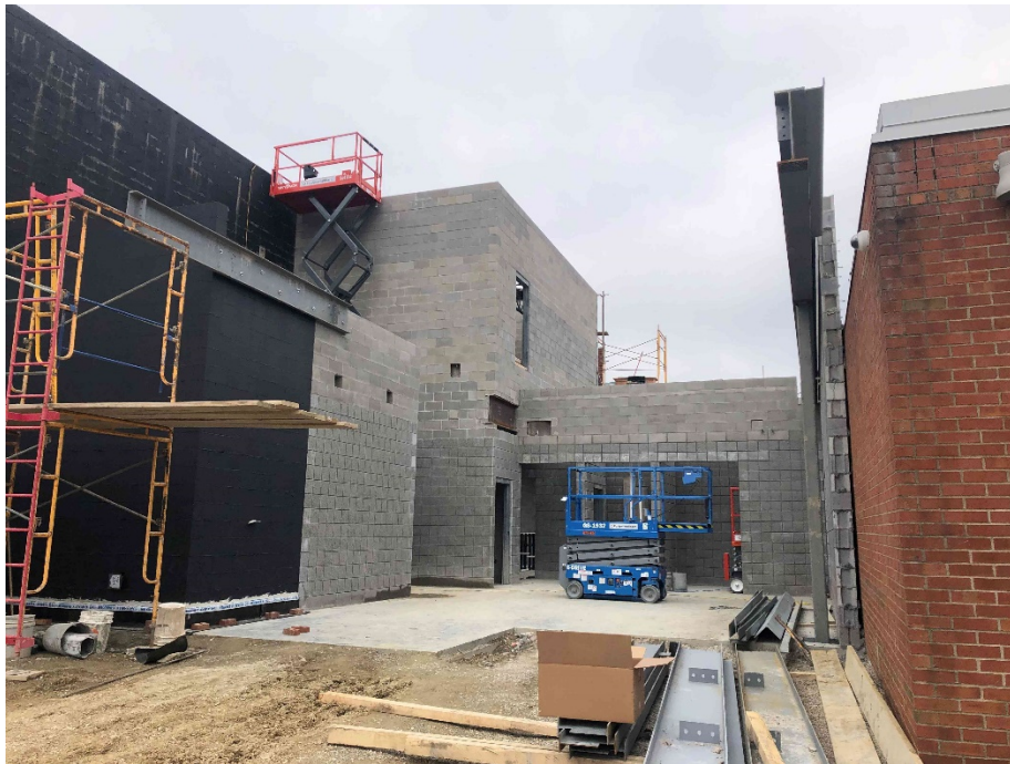
Steel installation is in progress in the Connector.