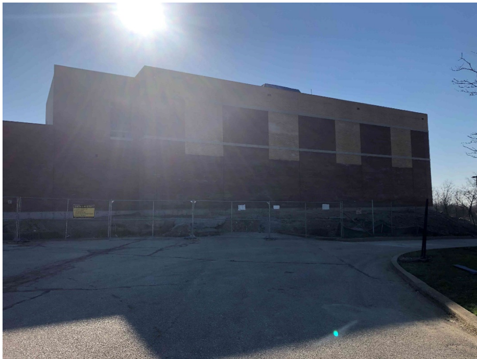
Installation of brick veneer and cast stone continues.