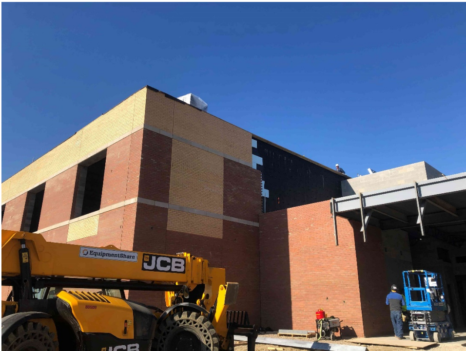
Installation of brick veneer and cast stone continues. Steel framing and roof decking at the Connector is in progress