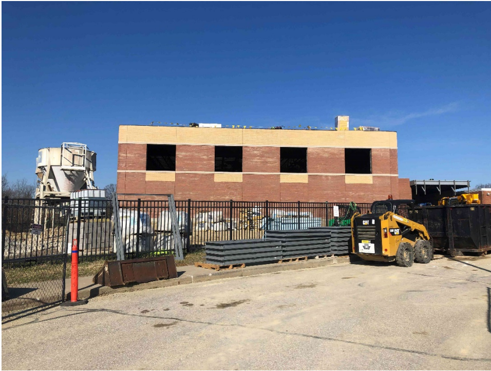
Installation of brick veneer and cast stone continues.