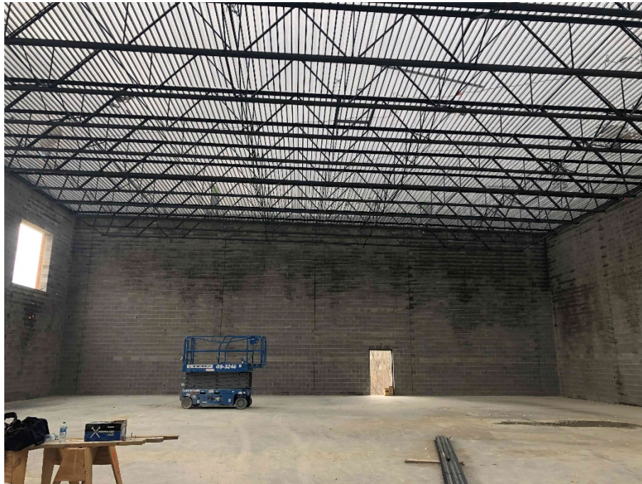
Gymnasium roof joists are installed, roof deck detailing is in progress