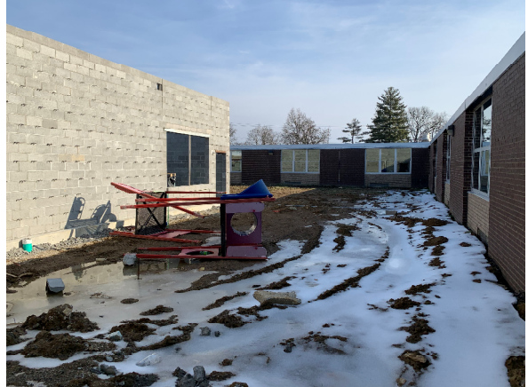
Preschool courtyard looking east