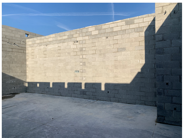
Typical classroom demising wall

Return transmitted items to PCA ARCHITECTURE PSC.