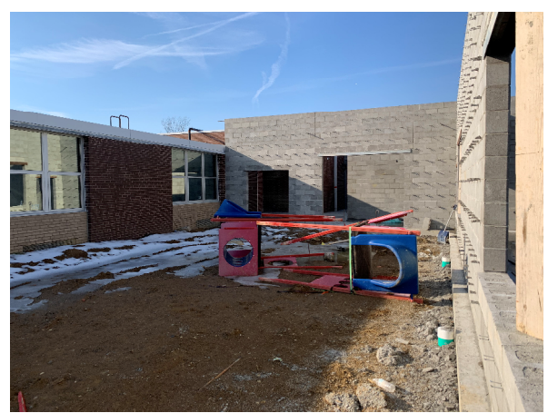
Preschool courtyard looking west