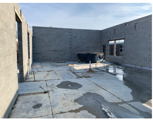
View inside preschool classrooms