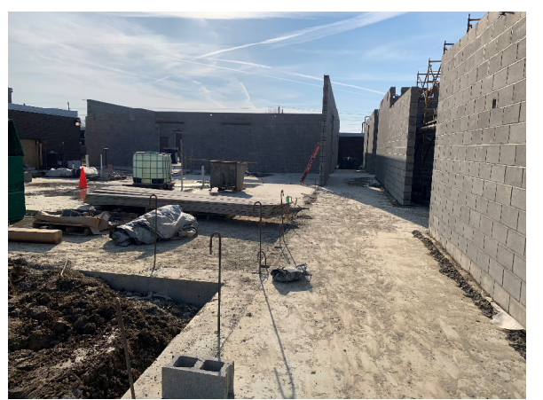
View looking south down north-south corridor