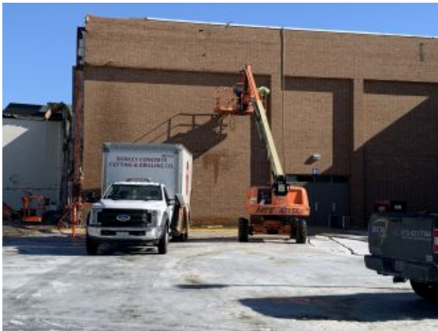
2022.02.09 – Saw cutting.