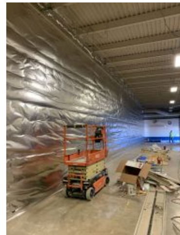
2022.02.09 – Temporary partition at gym mezz.