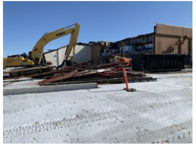
2022.02.09 – Demolition at pool.