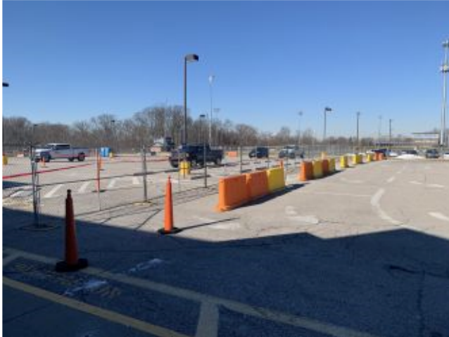
2022.01.26 – Temporary pedestrian path.

31.01: 2022.09.29 – A small crew was working towards setting the first storm structure in the area of the new detention pond. Some storm structures were observed on site.