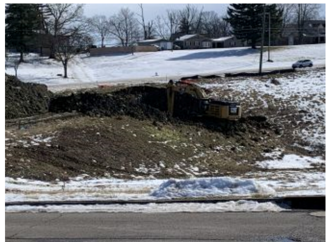
2022-02.09 – Working in detention basin.