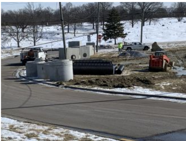
2022.02.09 – Storm structures staged for installation.