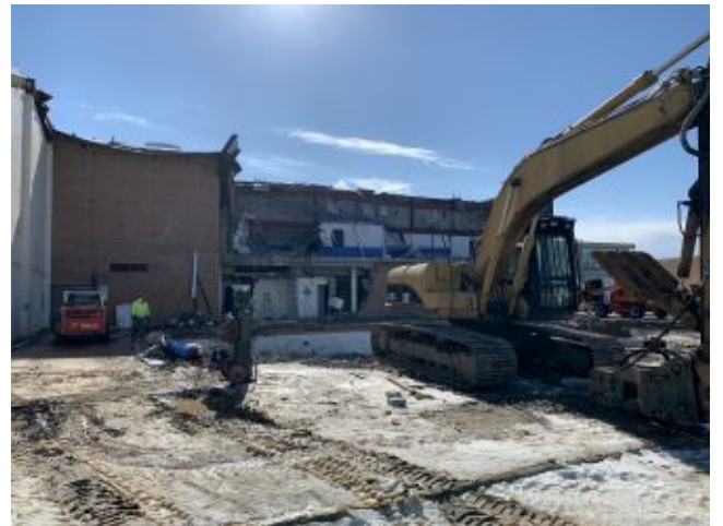
2022.02.09 – Demolition at pool.