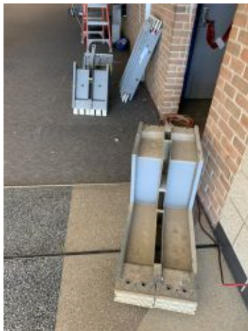
2022.02.09 – Electric buss duct removal.