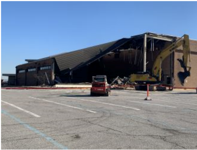
2022.01.26 – Demolition at pool.