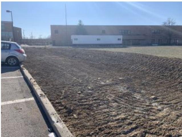
2022.01.26 – Job trailer.