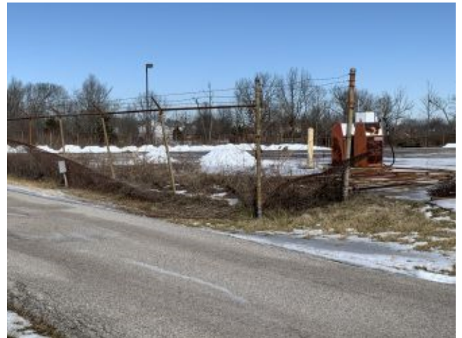
2022.02.09 – Bus compound demolition.