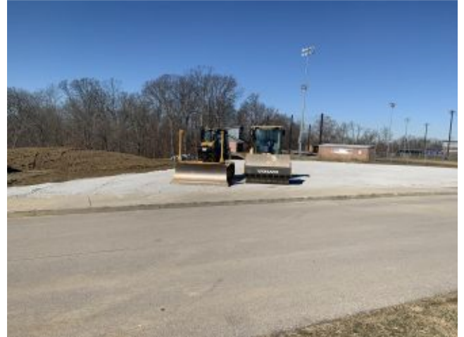
2022.01.26 – Lay-down area.