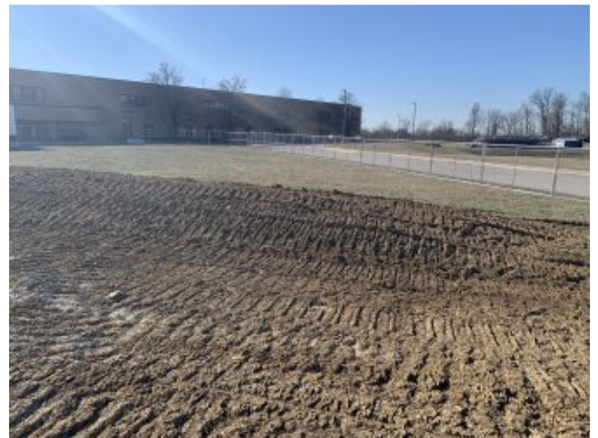
2022.01.26 – Temporary perimeter fence.