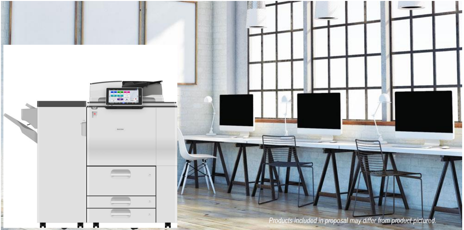
Products included in proposal may differ from product pictured.