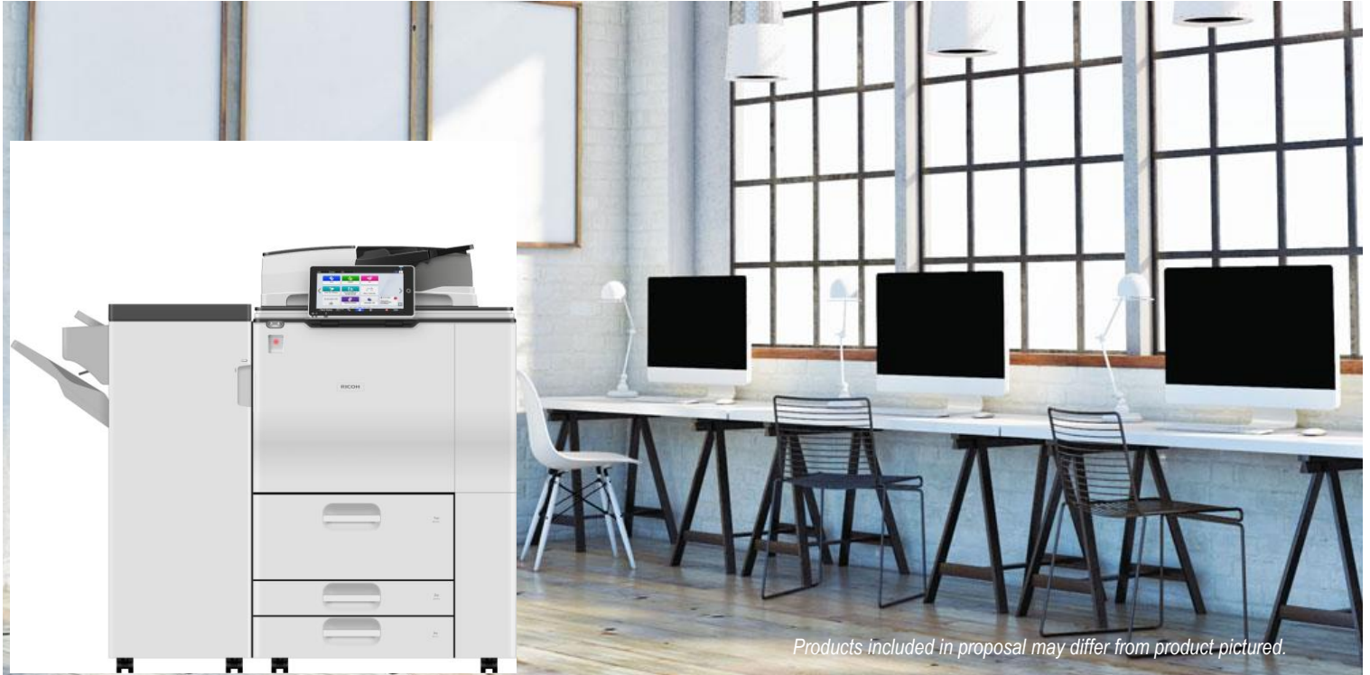
Products included in proposal may differ from product pictured.