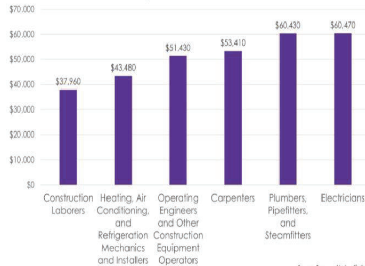
Median Annual Wage for Select Construction Occupations – Louisville MSA