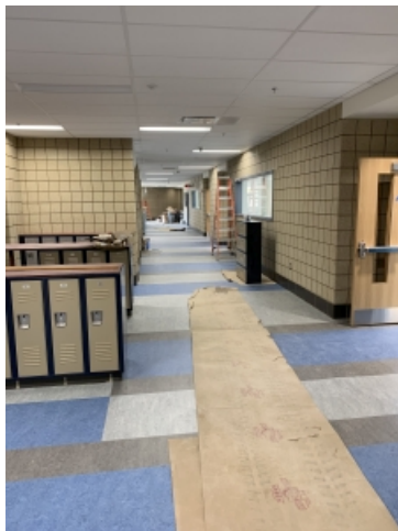
2019.06.05 – Corridor 2200.