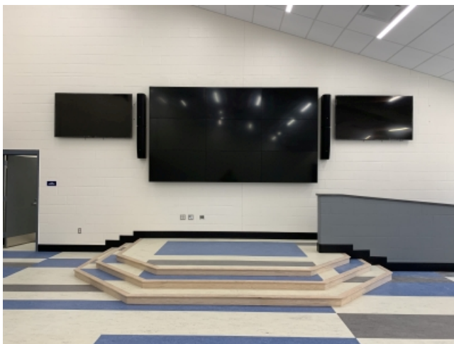
2019.06.14 – Multi-purpose room