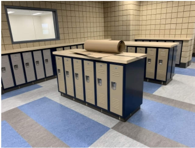
2019.06.14 – Concrete tops Corridor 2200