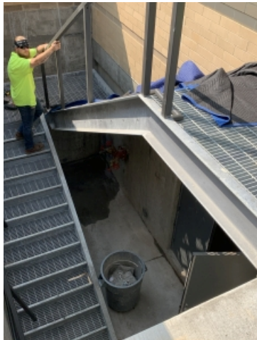
2019.06.05 – Guard rail installation