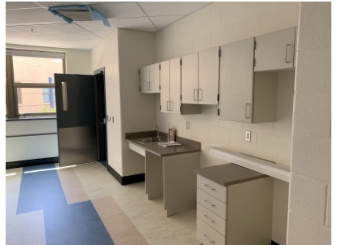
2019.06.14 – Special needs #1290