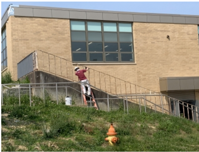
2019.06.05 – Prepping guard rail for paint