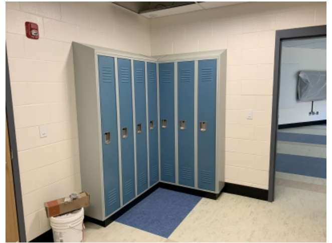
2019.06.14 – Special needs lockers