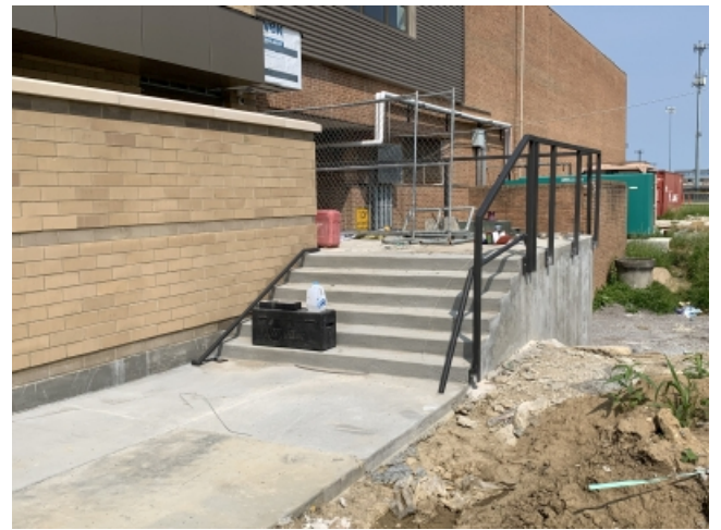
2019.06.05 – Guard rail installation