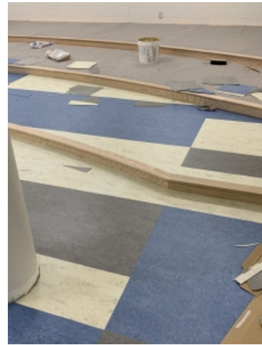
2019.06.05 – Choral room