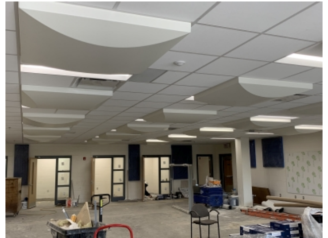
2019.06.05 – Band room