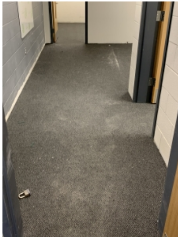
2019.06.05 – Special needs counseling