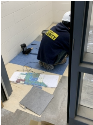
2019.06.05 – Flooring in practice room