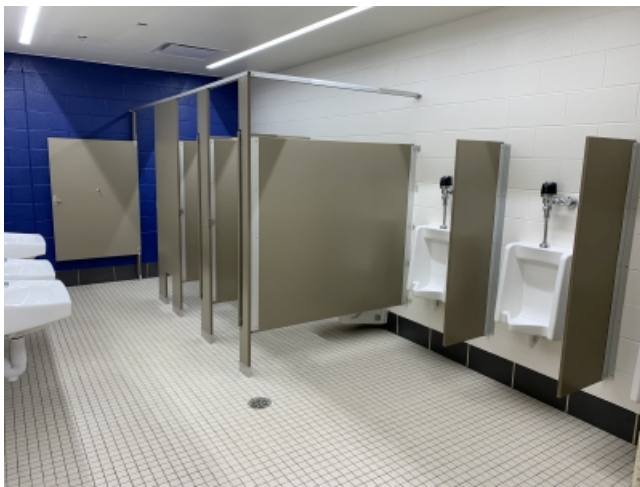
2019.06.14 – Restroom 2201