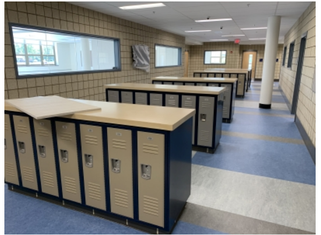
2019.06.14 – Concrete tops Corridor 2200B