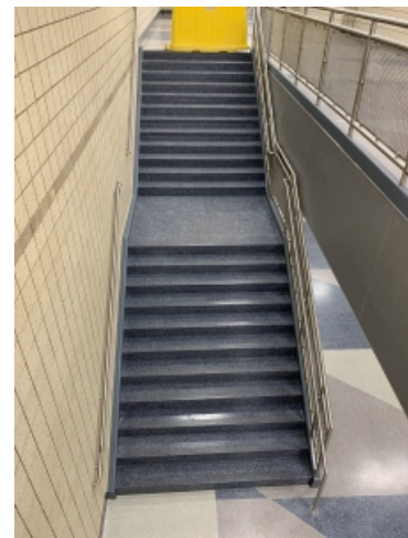
2019.06.14 – Monumental stair