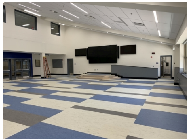
2019.06.14 – Multi-purpose room