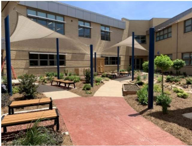
2019.06.14 – Sun shades in courtyard