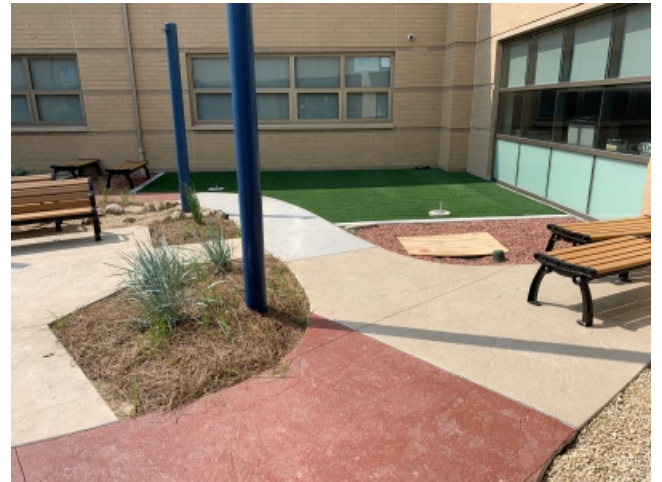
2019.06.05 - Courtyard