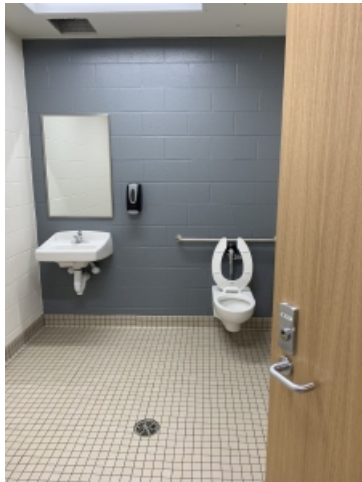
2019.06.14 – Special needs restroom