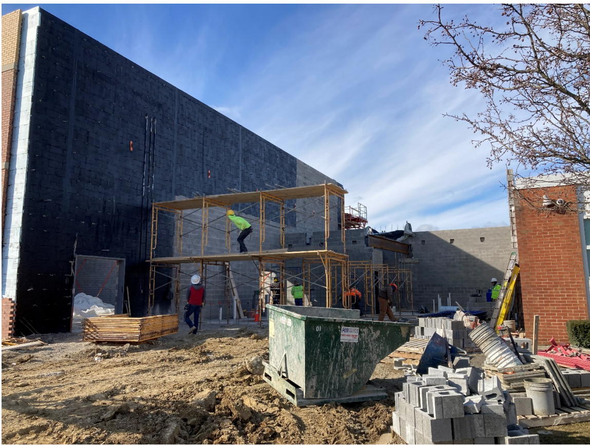
North face of gym wall with weather barrier over areas to have exterior brick