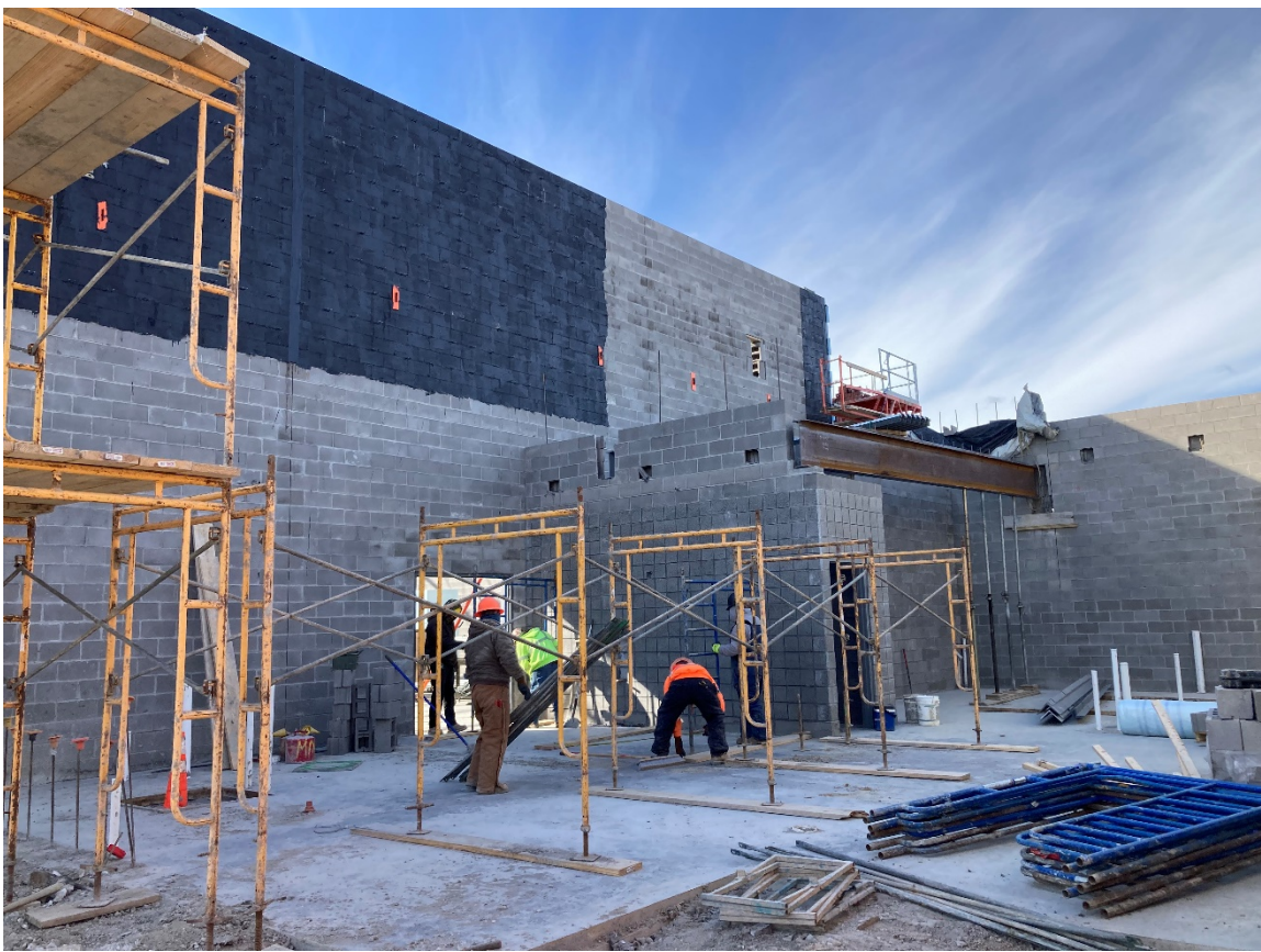
Masons laying out new CMU partitions for connector area on new concrete slab