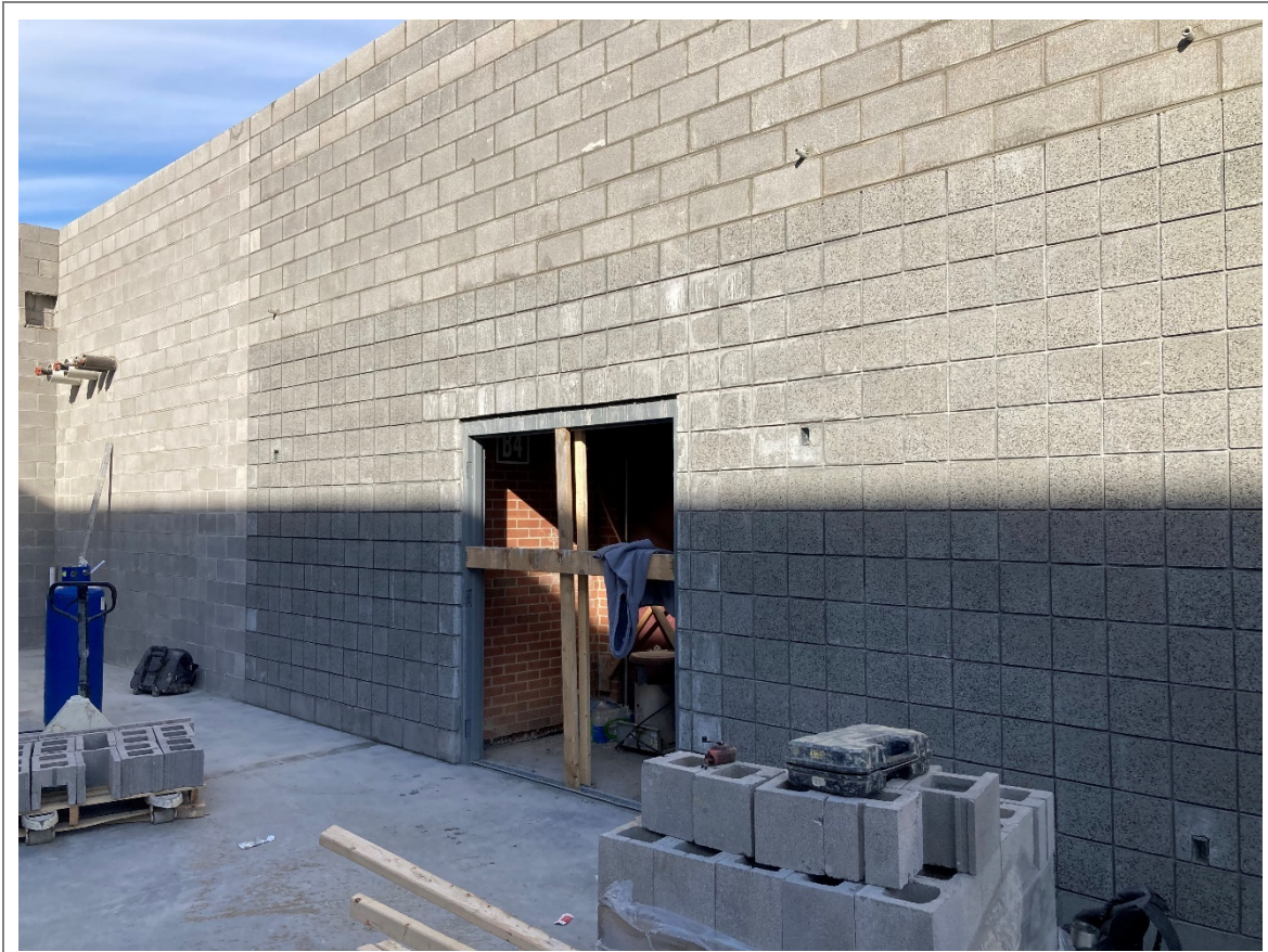
Burnished block wall for new lobby with double door frame to existing hallway