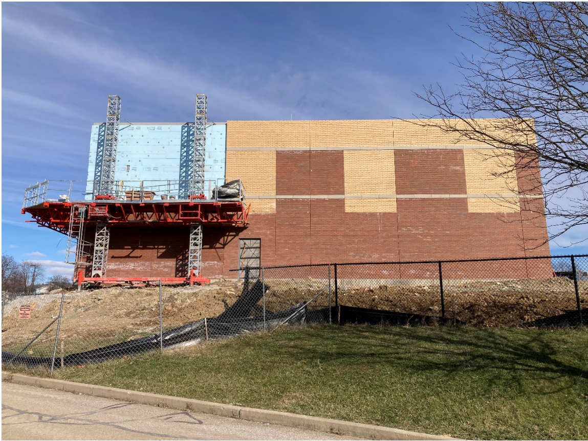
Finishing up masonry on south facade