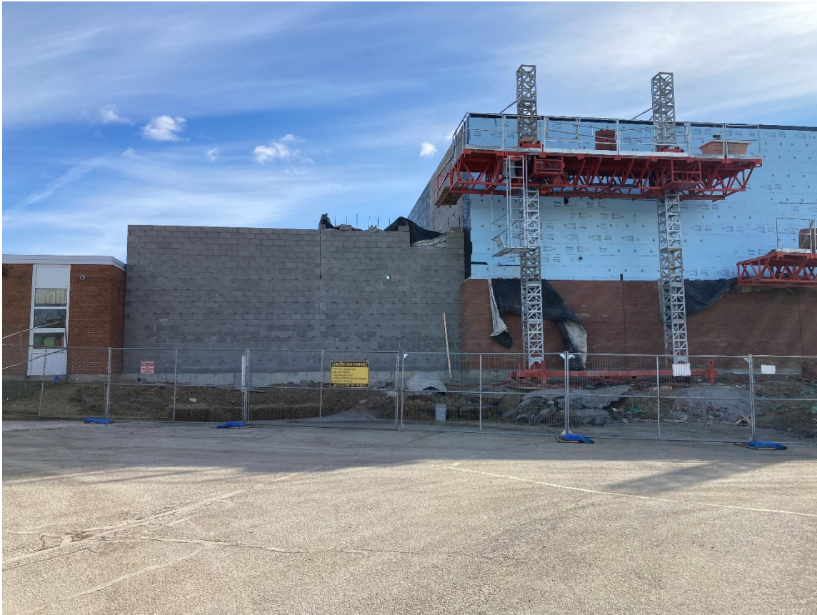
CMU back up block for west wall of connector erected