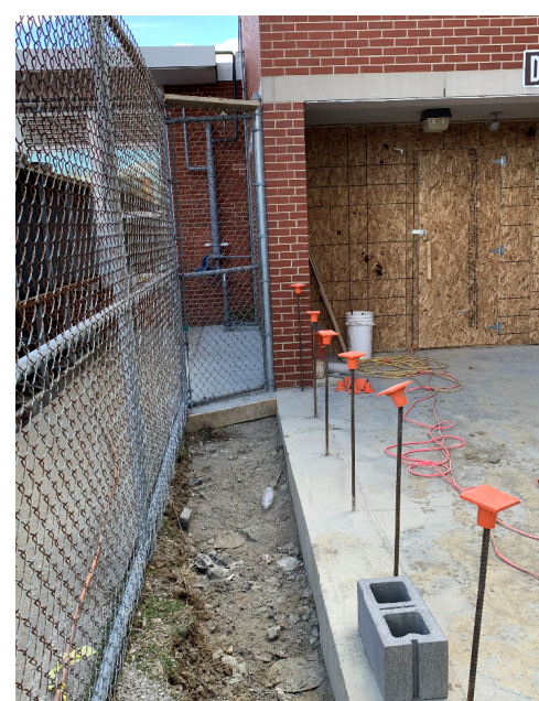
New gas piping at building