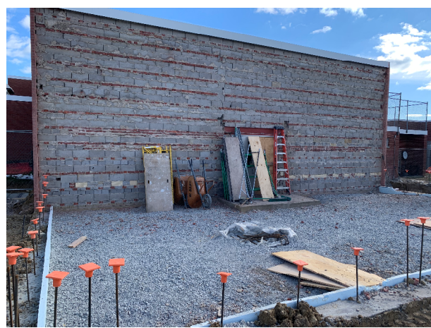
Cafeteria addition – completed foundations & slab Stair/elevator addition exterior cmu walls prep. Wall demolition started