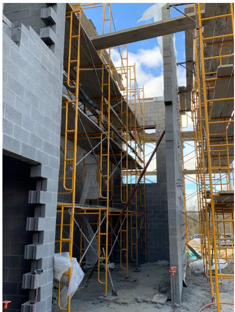
Interior view of new stairwell