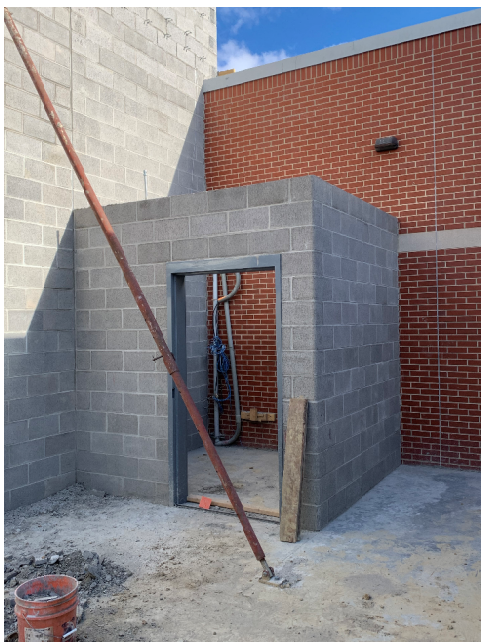
Elevator equipment room