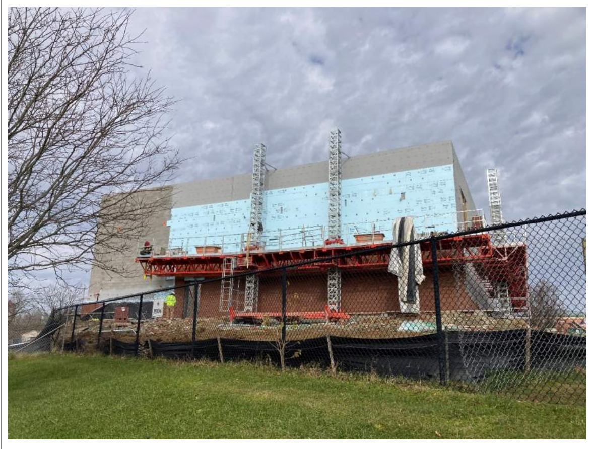
Southern face of gymnasium (spray-applied air barrier, insualtion, and brick all visible)