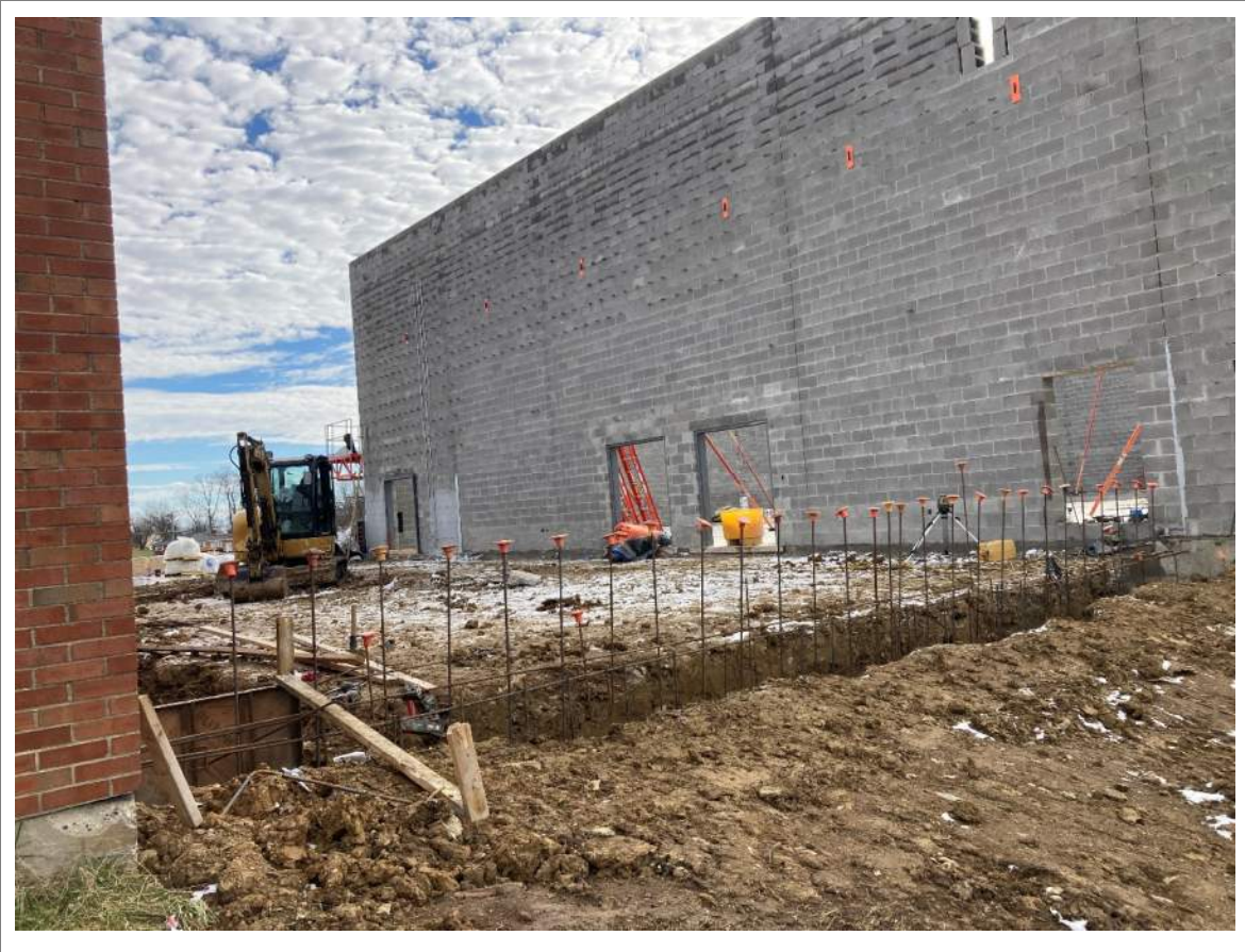
Footings cut and prepared for concrete pour