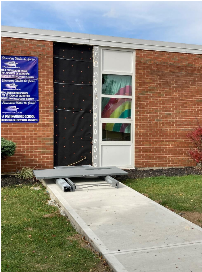
Temporary egress door awaiting installation