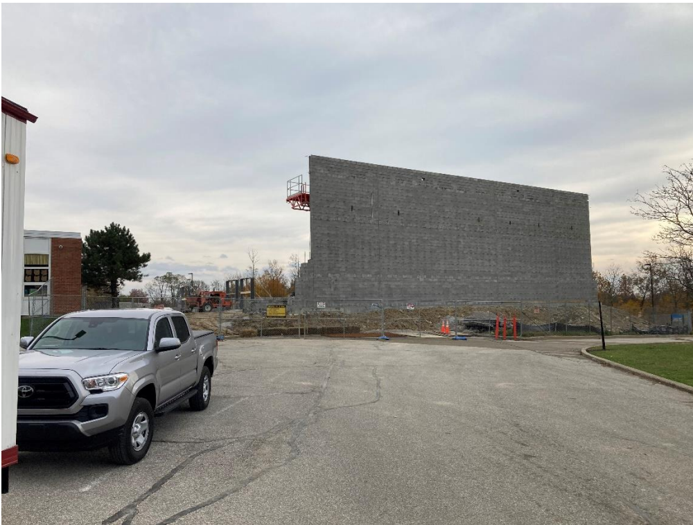
View of gymnasium west wall