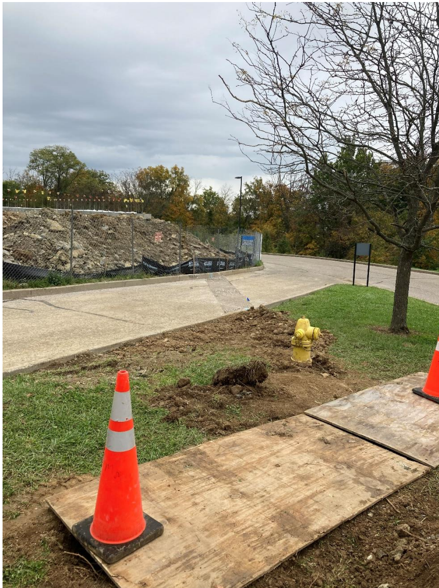
Fire hydrant relocated behind gym addition