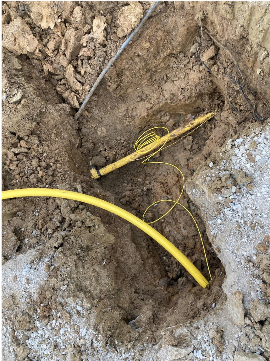
Gas line around new addition awaiting connection to existing service