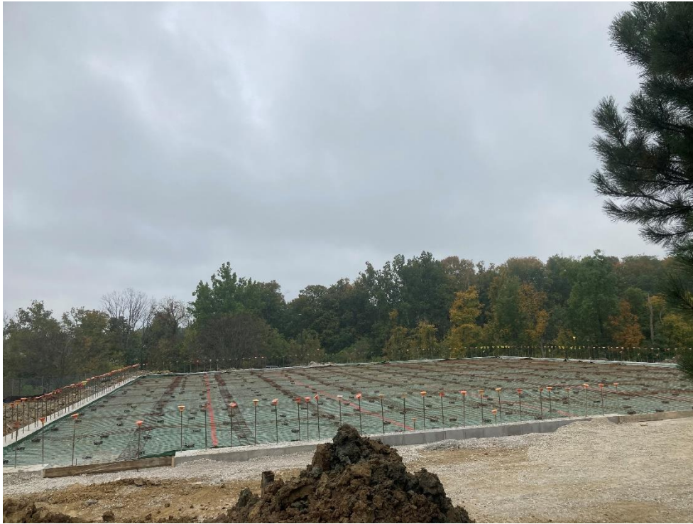
Gym area with vapor barrier, reinforcing, and reinforcing chairs, awaiting concrete pour