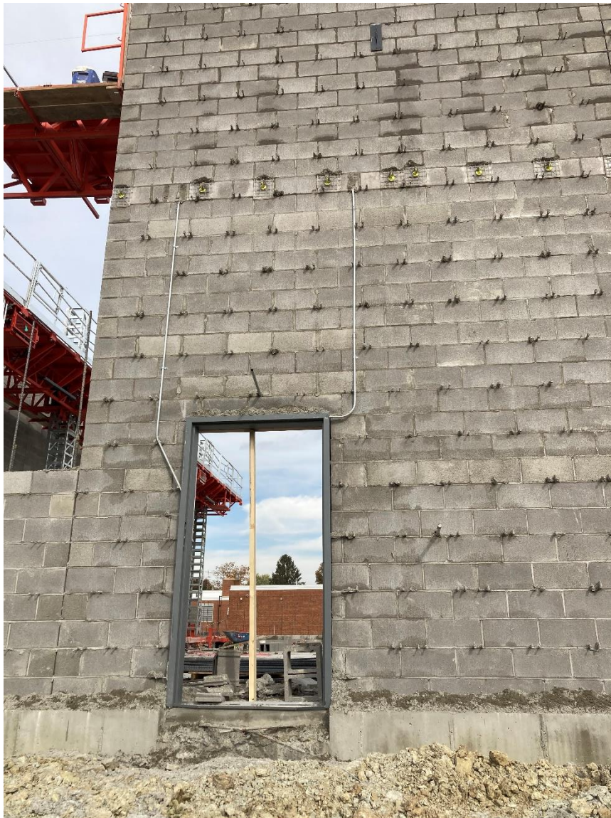
Gymnasium south door and electrical rough-ins