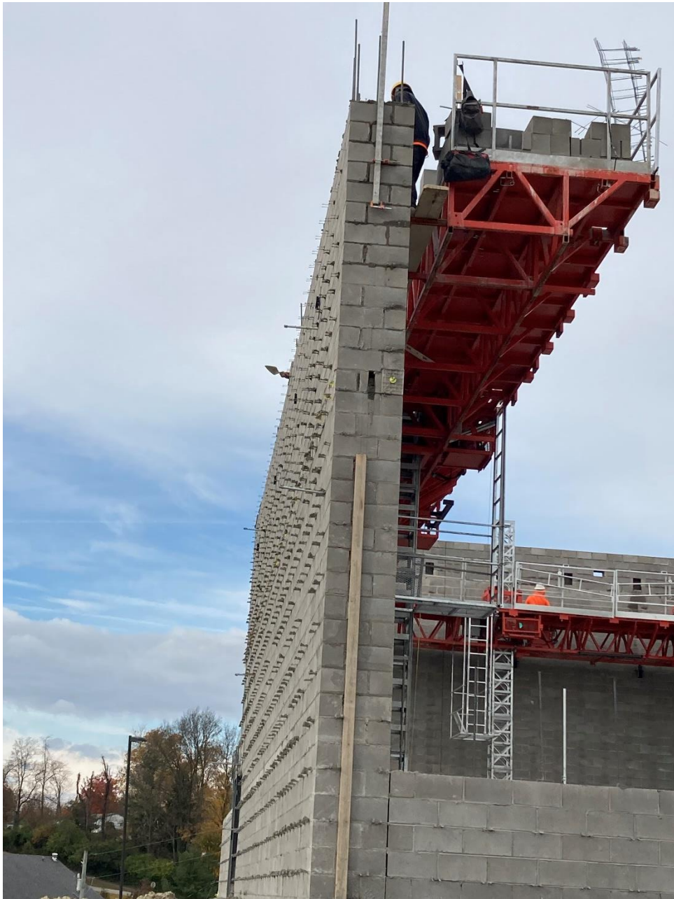
Gymnasium south wall