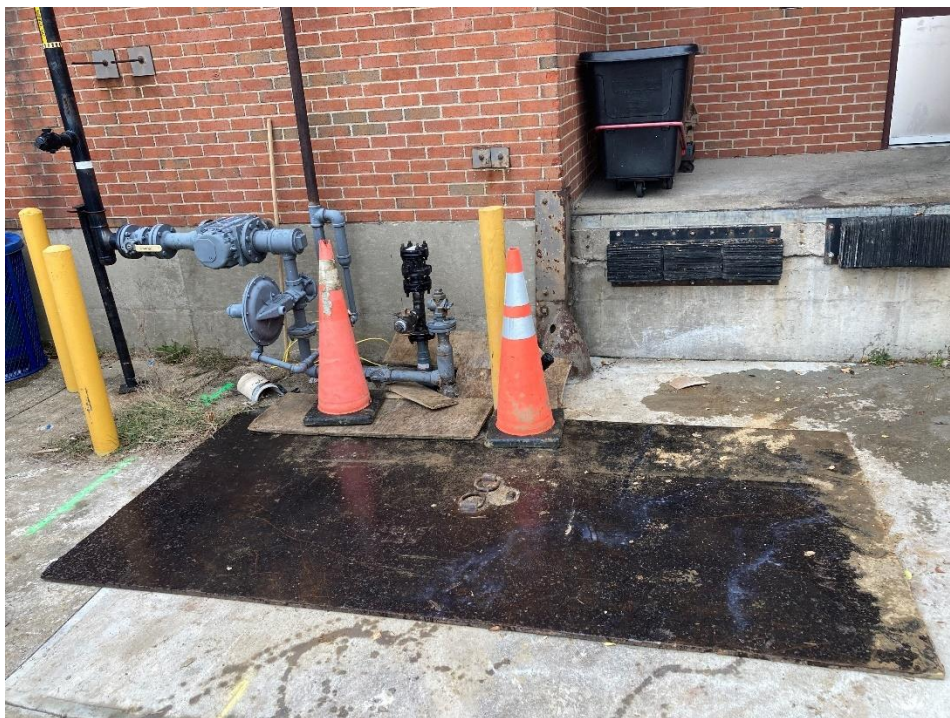
Existing meter location awaiting new meter and new line tie-in