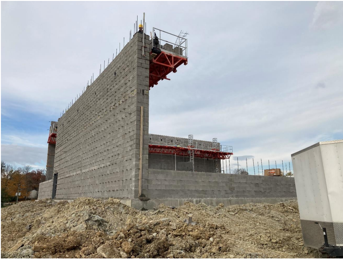
View of Gym from Southeast