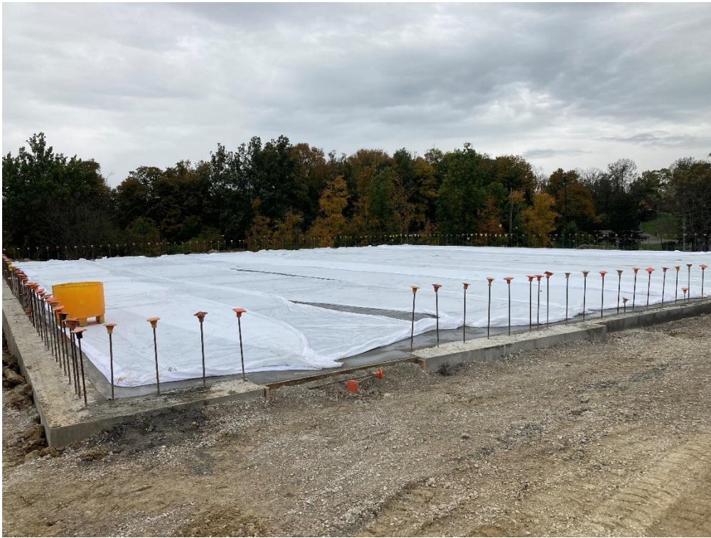
Concrete gym slab poured