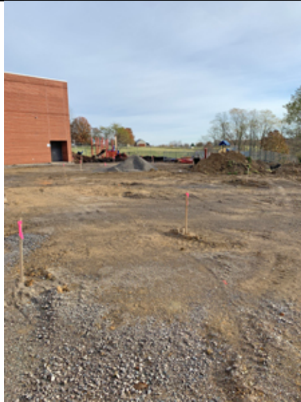
2021.11.16 The locations for the driller piers have been marked.