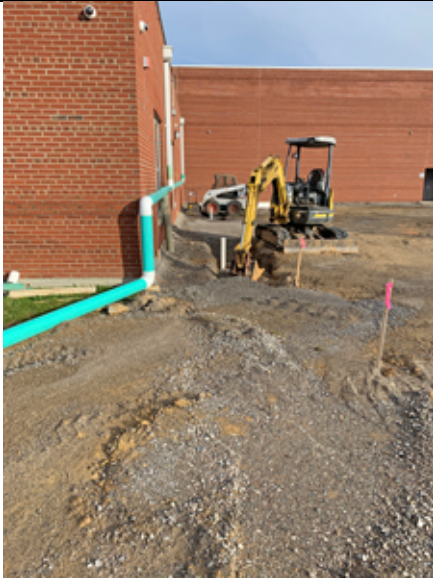
2021.11.16 Installation of the underground plumbing has started.