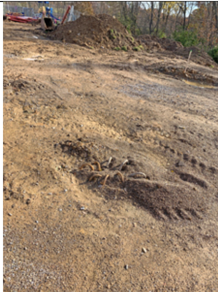
2021.11.16 Installation of the drilled piers has started.