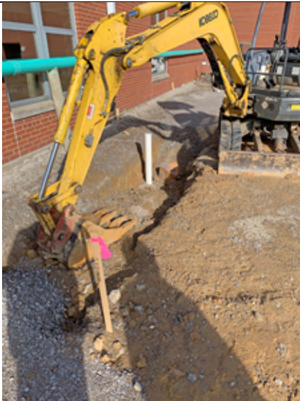
2021.11.16 Installation of the underground plumbing has started.