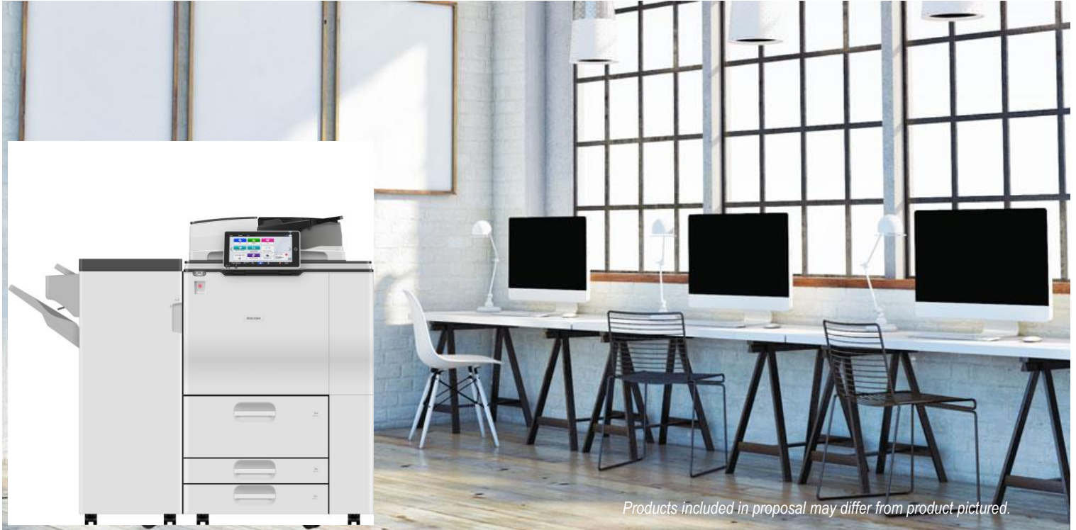
Products included in proposal may differ from product pictured.