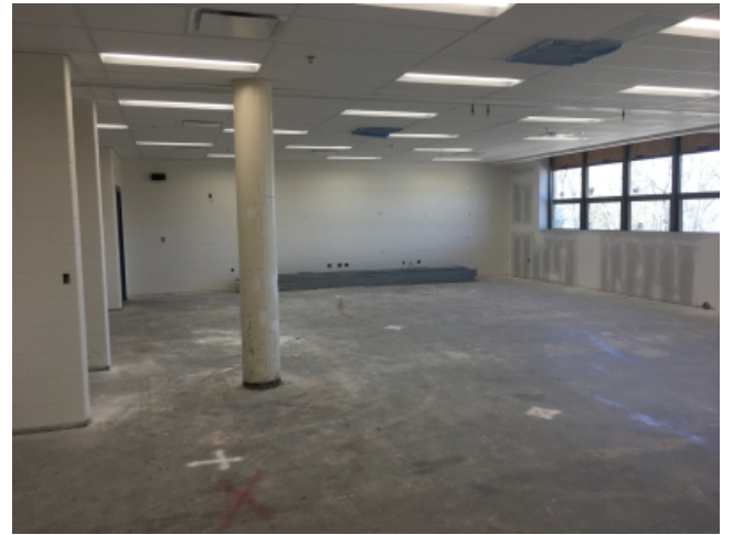
2019.04.09 – Classrooms 2240A/B