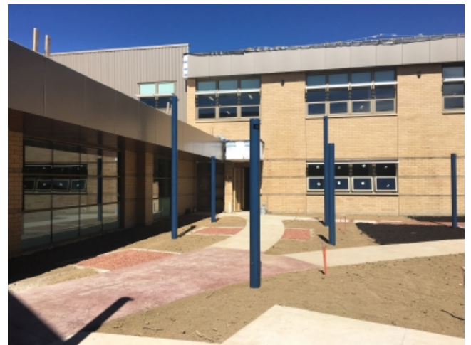
2019.04.09 - Courtyard