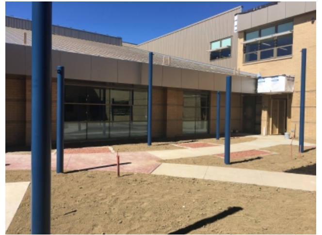
2019.04.09 - Courtyard