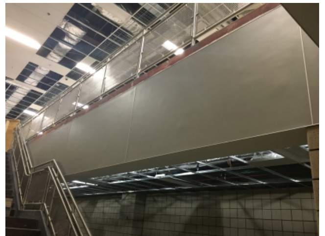
2019.04.09 – Monumental stair