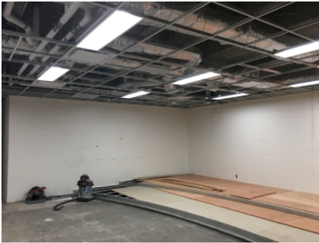
2019.04.23 – Choral 1232