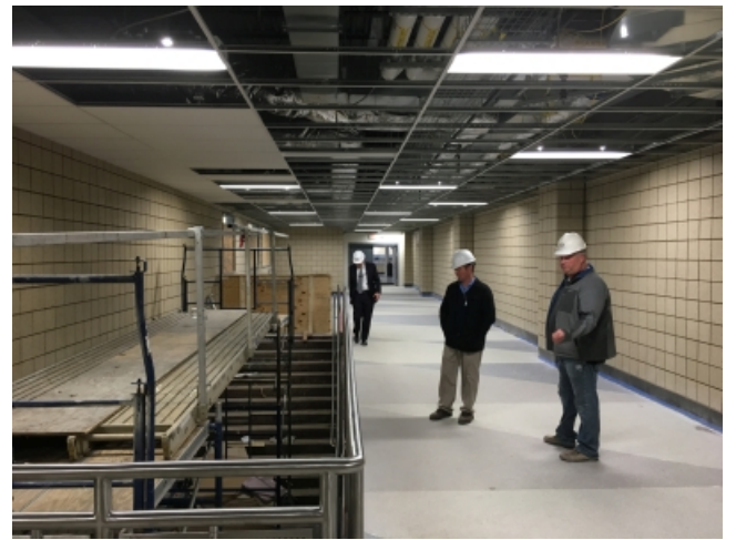
2019.03.26 – Corridor 2100A