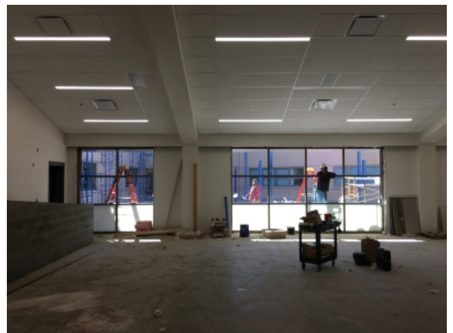
2019.03.26 – Installing storefront glazing