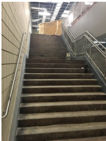
2019.04.09 – Monumental stair