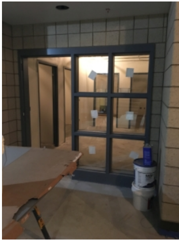
2019.04.09 – Career Center