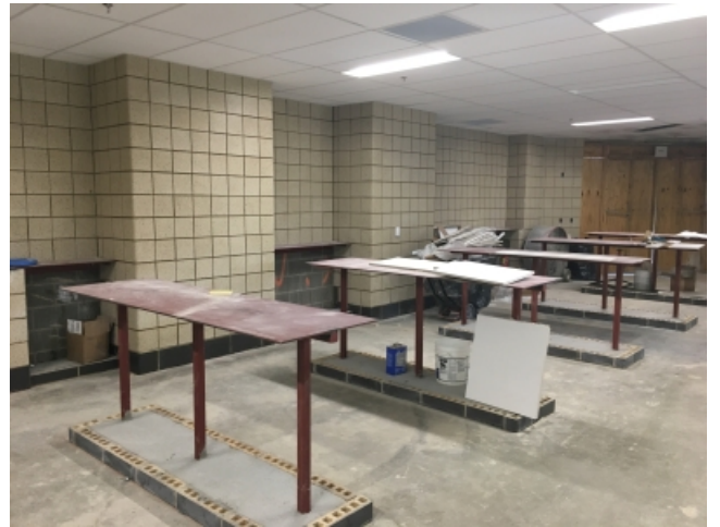
2019.04.09 – Corridor 2200