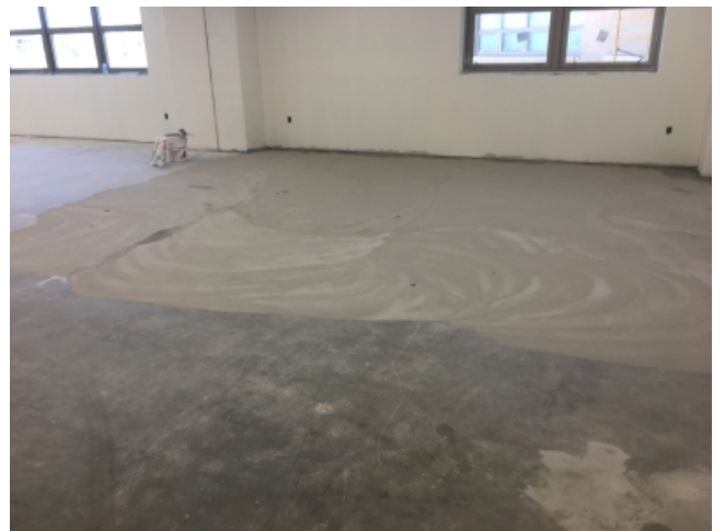
2019.04.09 – Floor prep in 2256