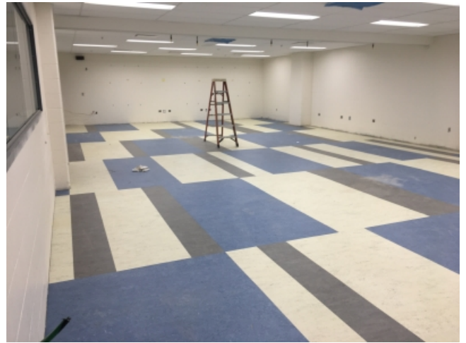
2019.04.23 – Classrooms 2210A/B