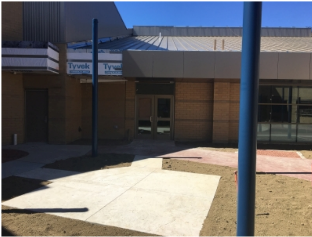
2019.04.09 - Courtyard