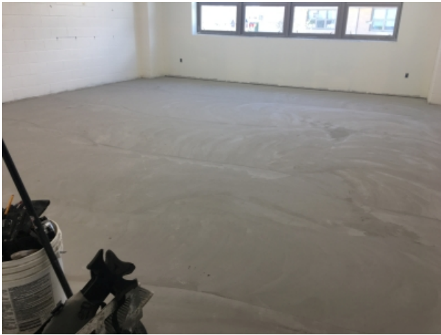
2019.04.09 – Floor prep in 2254