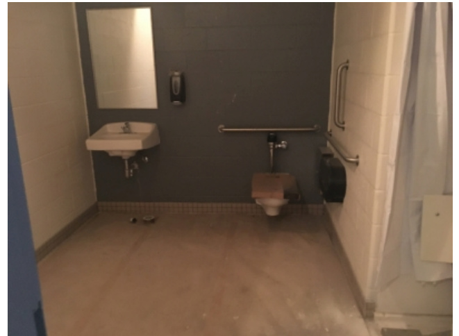
2019.04.09 – Restroom 1271