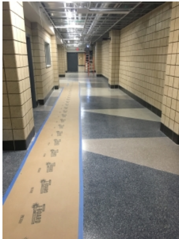
2019.04.23 – Corridor 1100A