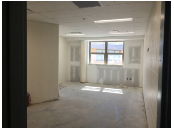
2019.04.09 – Assistant Principal 2265