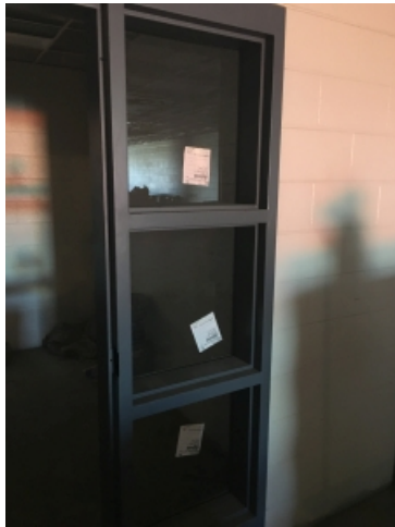
2019.04.09 – Practice room sidelight