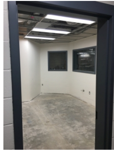
2019.04.23 – Assistant Principal 1281