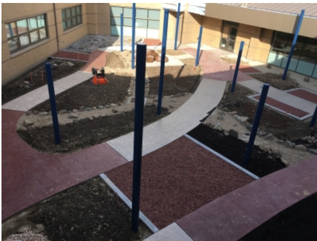
2019.04.23 - Courtyard