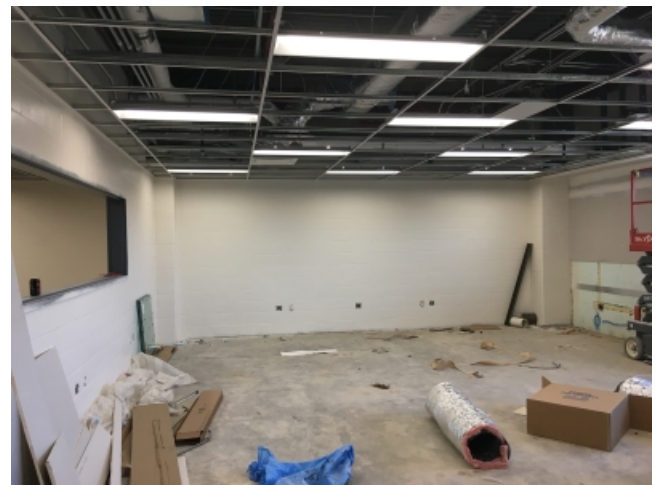
2019.03.26 – Classroom 2230B