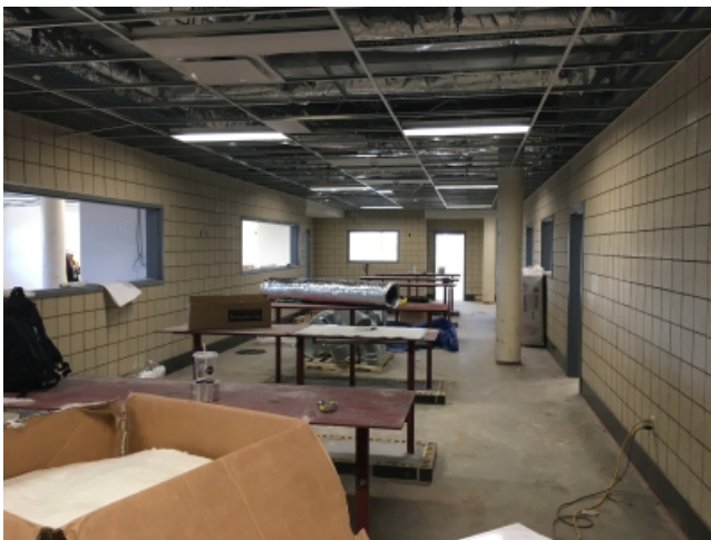
2019.03.26 – Corridor 2200B