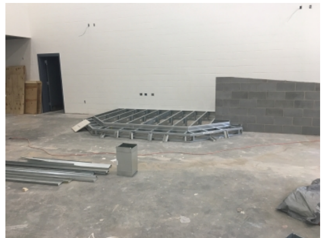
2019.04.09 – Multi-Purpose room