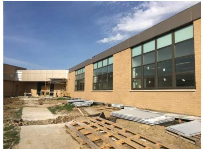
2019.04.23 – South wall