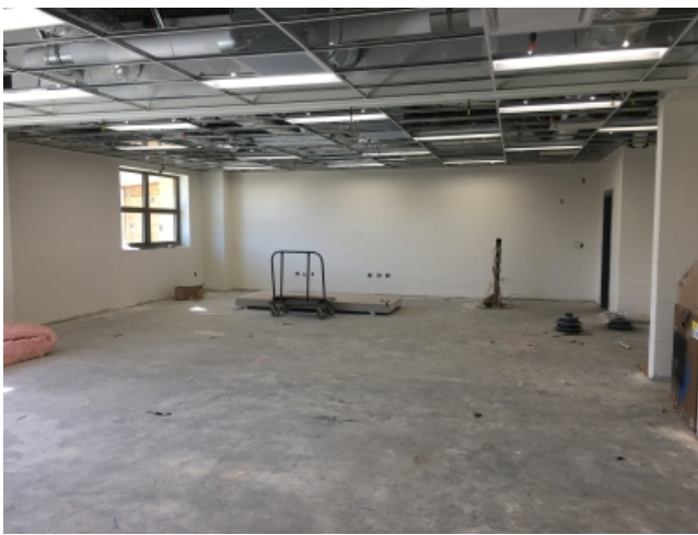
2019.03.26 – Classrooms 2256A/B