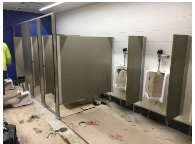
2019.03.26 – Restroom 2201