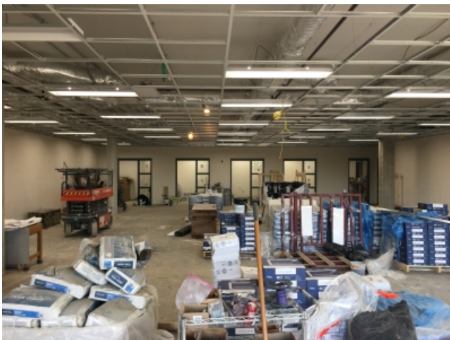
2019.04.23 – Band 1233