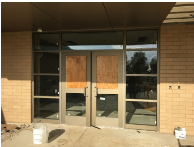
2019.04.23 – Former entrance