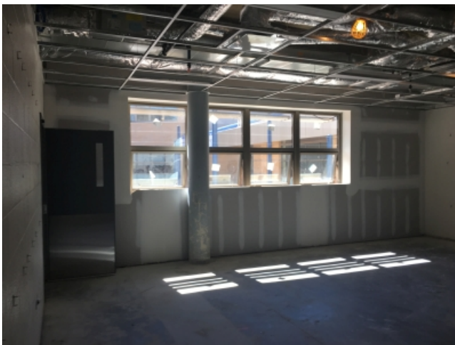
2019.04.09 – Special Needs 1250