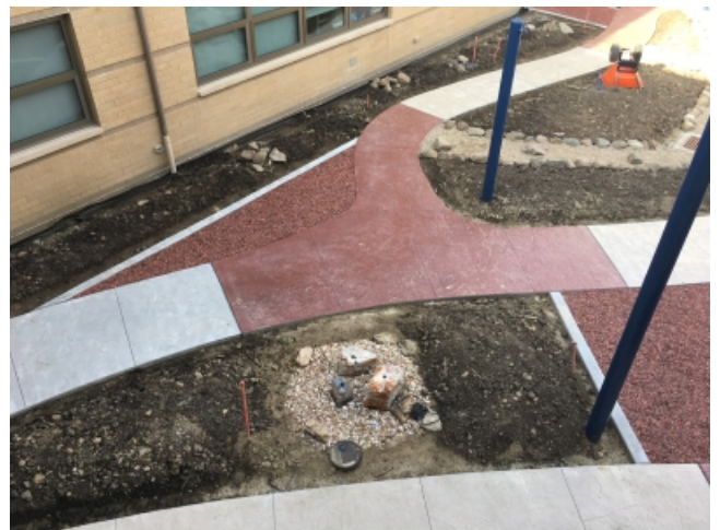
2019.04.23 - Courtyard