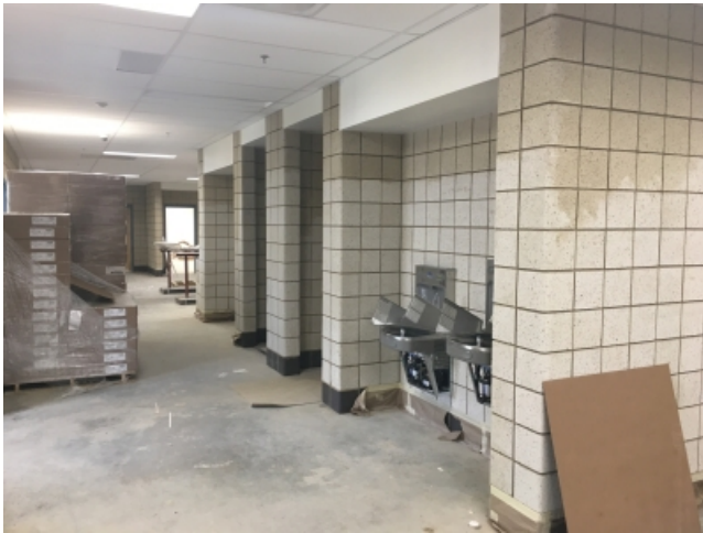
2019.04.09 – Corridor 2200