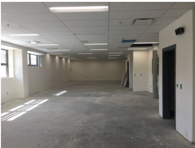
2019.04.09 – Classrooms 2260A/B/C