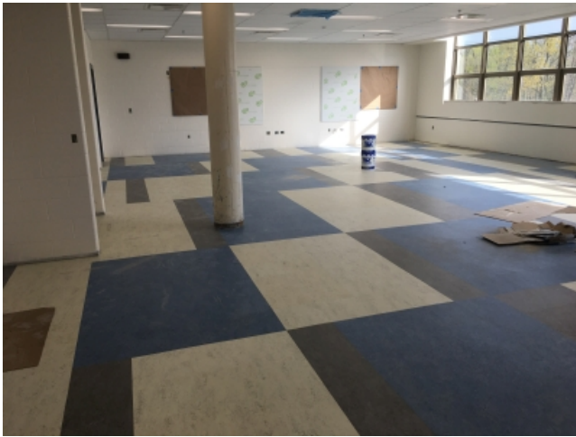
2019.04.23 – Classrooms 2240A/B