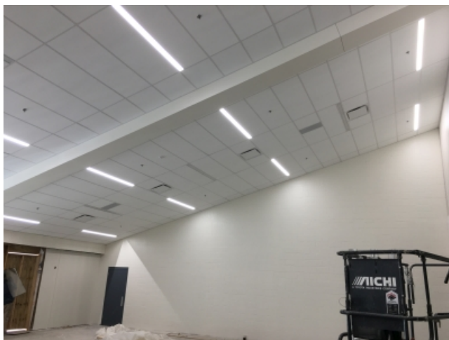
2019.03.26 – Multi-Purpose room

31.02: 2019.04.23 – Additional hardscaping had been installed in the courtyard.