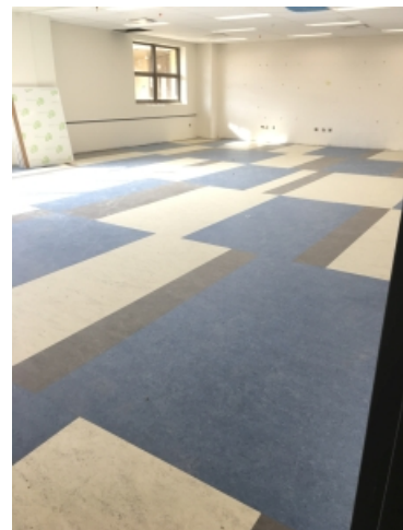
2019.04.23 – Classrooms 2256A/B