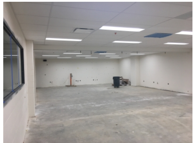
2019.04.09 – Classrooms 2210A/B