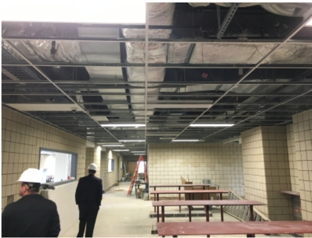
2019.03.26 – Corridor 2200