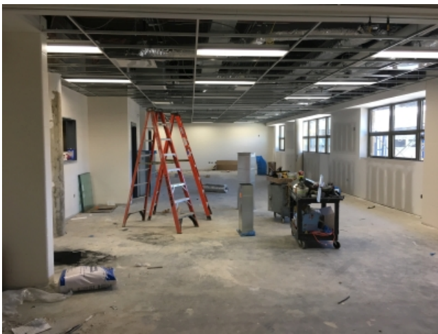
2019.03.26 – Classrooms 2260A/B/C