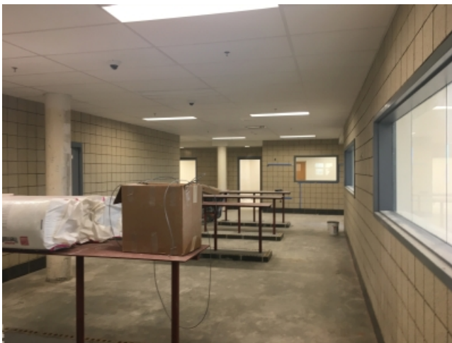
2019.04.09 – Corridor 2200B