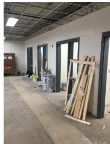
2019.04.23 – Band 1233