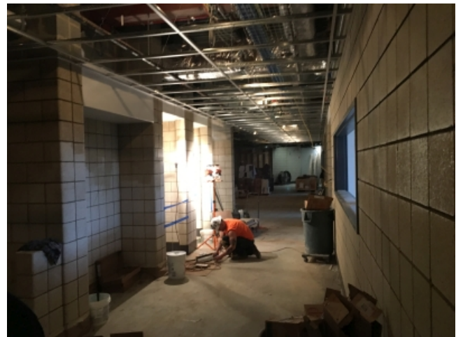
2019.02.12 – Upper level north/south corridor.