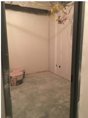
2019.02.12 – Career Center