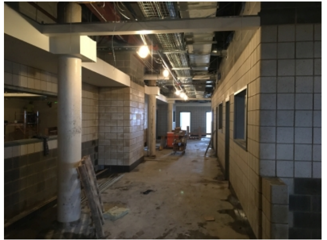
2019.01.29 – Upper level north east/west corridor.