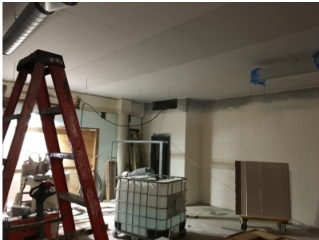
2019.01.29 – Band room.