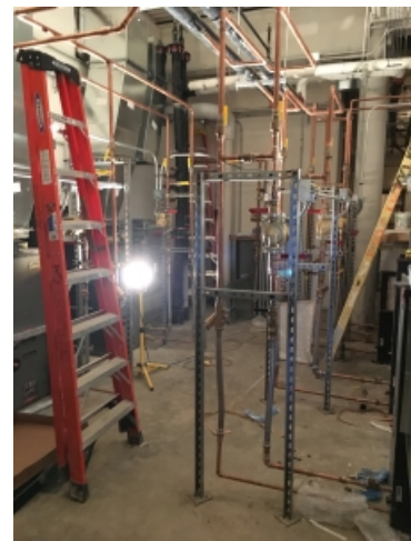
2019.02.12 – Mechanical 2225.