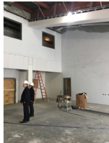
2019.01.29 – Multi-purpose room.