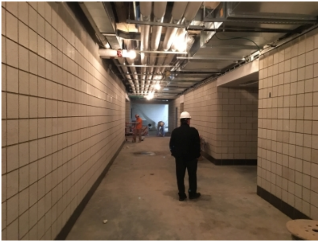
2019.01.29 – Lower level north/south corridor.