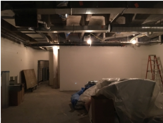
2019.01.29 – Choral room.