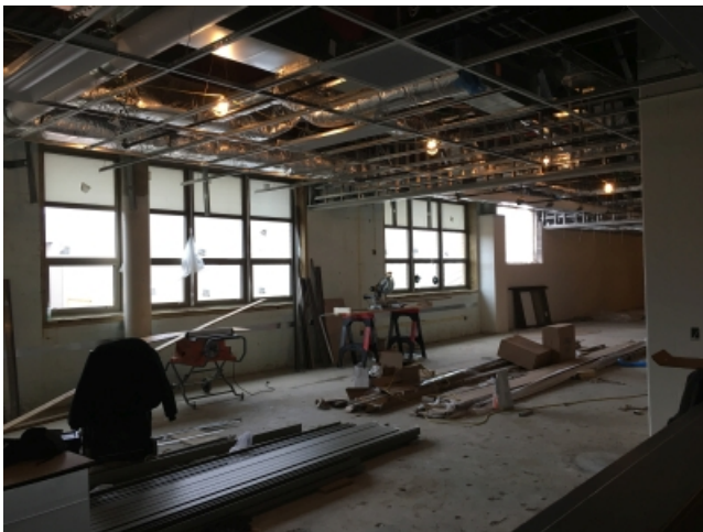
2019.02.12 – Installed windows.