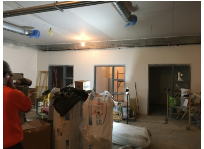
2019.01.29 – Band room.