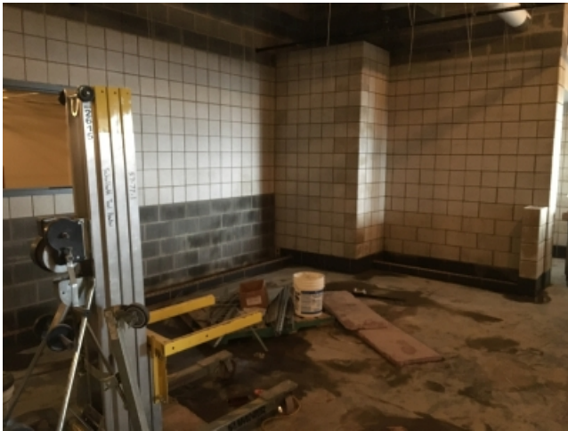
2019.01.29 – Upper level.