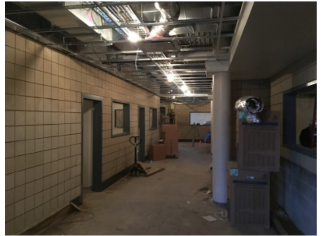
2019.02.12 – Corridor 2200A.