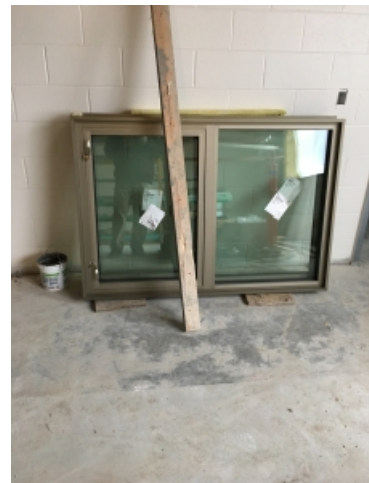
2019.02.12 – Windows staged for installation.