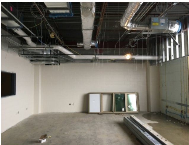
2019.02.12 – Classroom 2230B.