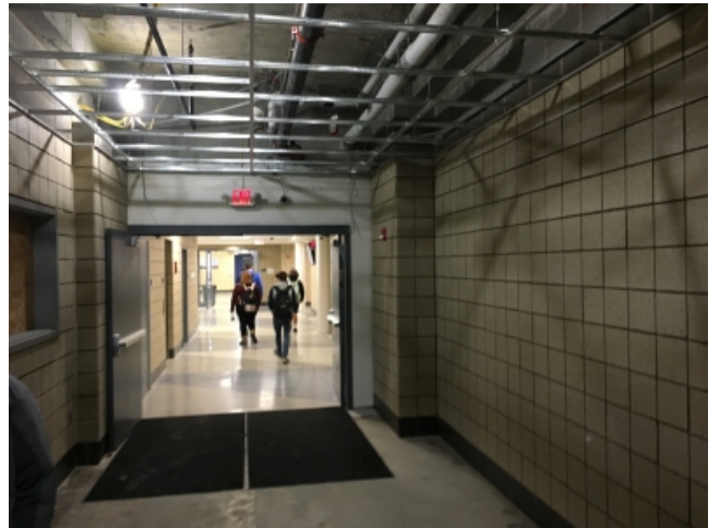
2019.02.12 – Lower level temporary corridor