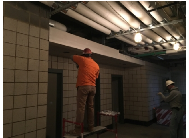
2019.01.29 – Applying mud outside choral room.