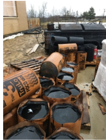
2019.02.12 – Roofing billets.