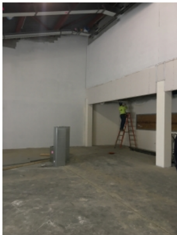
2019.01.29 – Multi-purpose room.