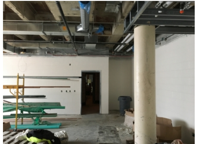
2019.01.29 – MSD Classroom.