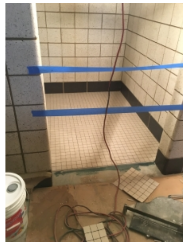
2019.02.12 – Installed floor tile.