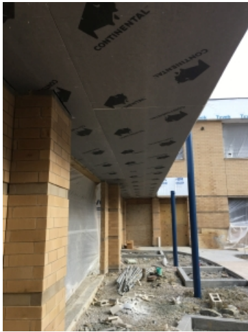
2019.01.29 – Courtyard soffit.