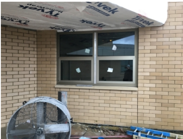
2019.02.12 – Installed window.