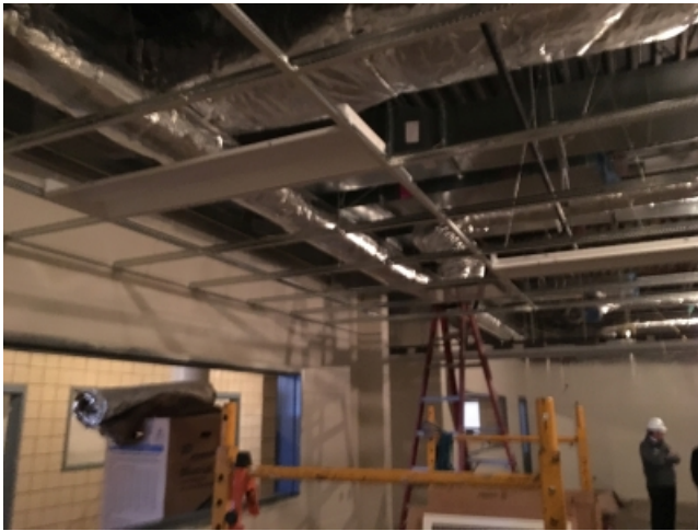
2019.02.12 – Light fixture in grid at upper level.