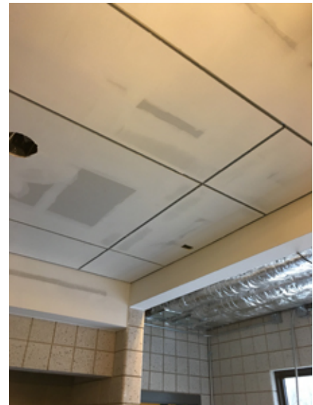
2018.11.26 – The reveals in the ceiling near the display case have been completed.