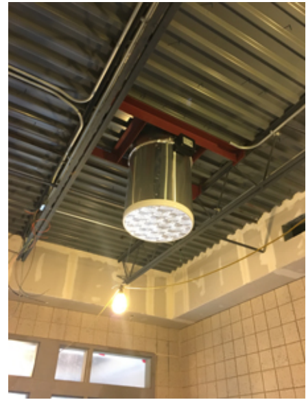
2018.11.19 – Work continues on the bulkhead in the Lobby.