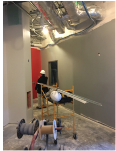
2018.11.19 – Final painting has started.