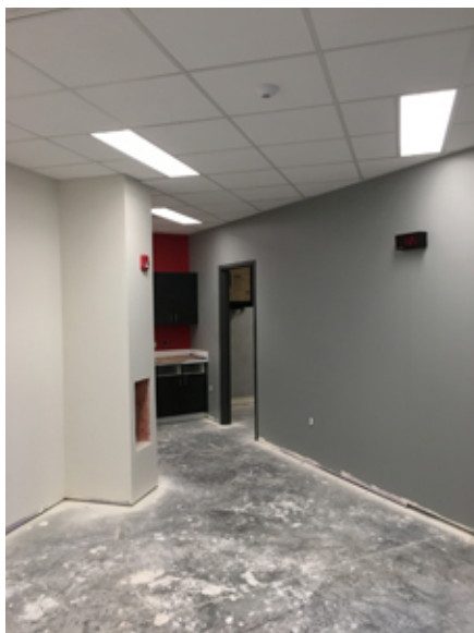
2018.12.03 – View in the office area.