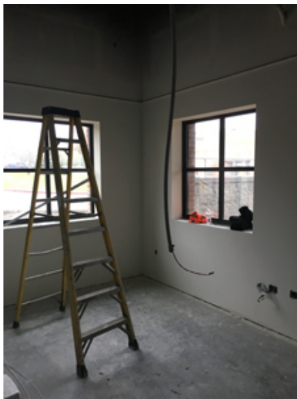
2018.11.19 – Final painting has started.