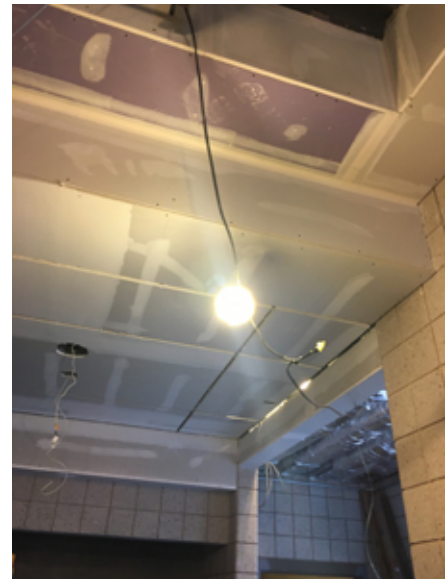
2018.11.19 – Installation of the reveals is in progress at the area of the display case.