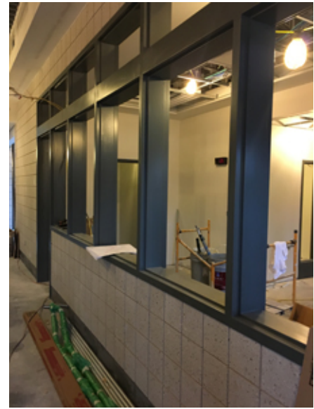
2018.11.26 – Final painting has started on the door and window frames.