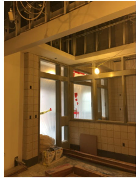
2018.11.19 – The bulkhead in the Office area has been constructed.