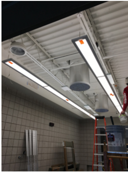
2018.12.03 – The Lobby ceiling has been painted. Light fixtures have been suspended.