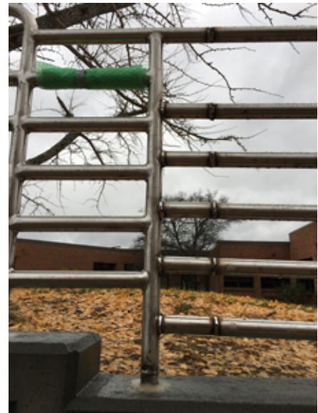
2018.11.26 – Finishing work on the stainless steel handrails is ongoing.