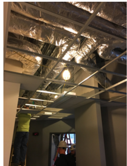
2018.11.26 – Installation of the ceiling grid is in progress in the office area.