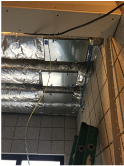
2018.11.19 – Access panels have been installed in the ductwork.