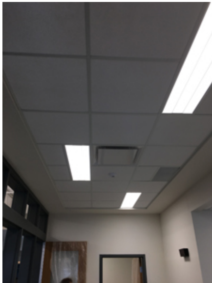
2018.12.03 – The ceiling has been installed in the office area.