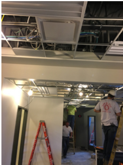
2018.11.26 – Installation of the ceiling grid, light fixtures, hvac grilles and diffusers has started.