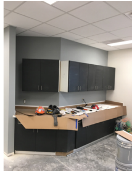
2018.12.03 – Installation of the casework in the office area is in progress.