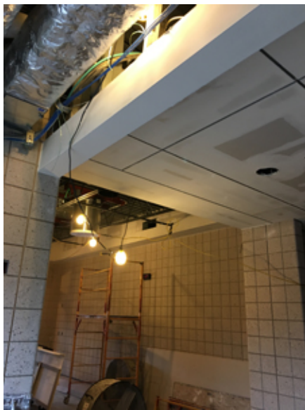
2018.11.26 – View of the lobby area.