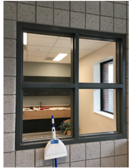
2018.12.03 – View from Vestibule area into the Office area.