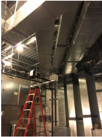
2018.11.26 – View in the mechanical room.