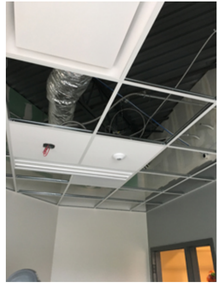
2018.11.26 – Installation of the ceiling pads has started.