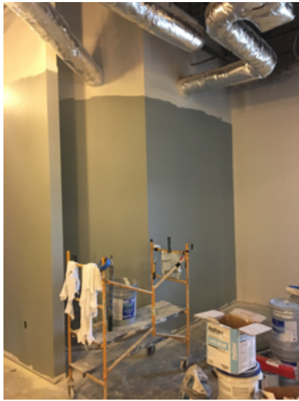
2018.11.19 – Final painting has started.