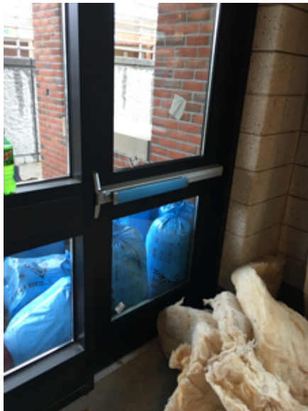
2018.11.26 – The doors have been hung on the main entry storefront system.