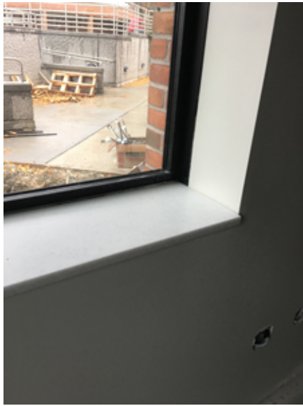
2018.11.26 – The solid surface window stools have been installed.