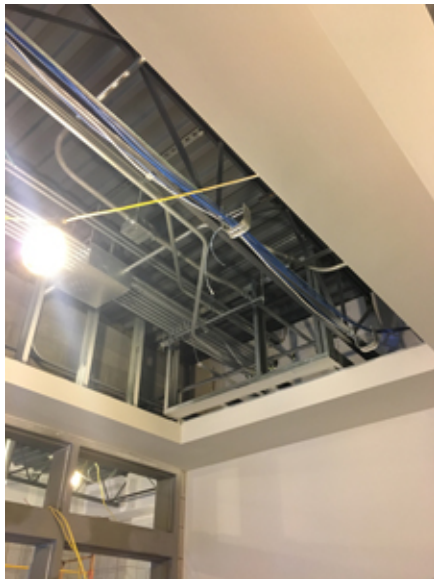
2018.11.19 – The bulkhead in the Office area has been constructed.