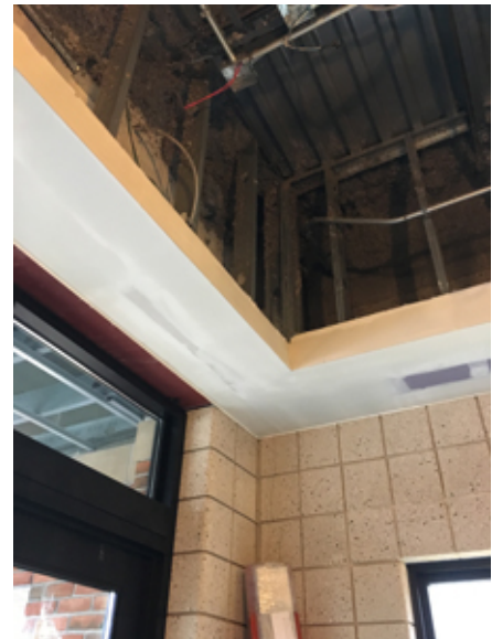
2018.11.26 – Finishing of the bulkhead in the Vestibule is in progress.