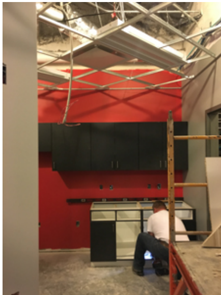
2018.11.26 – Installation of the casework is in progress.