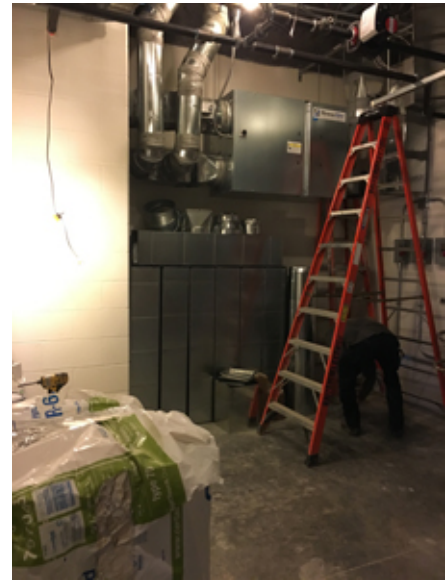
2018.11.26 – View in the mechanical room.