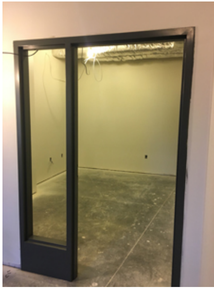
2018.11.19 – Painting of the door frames is in progress.