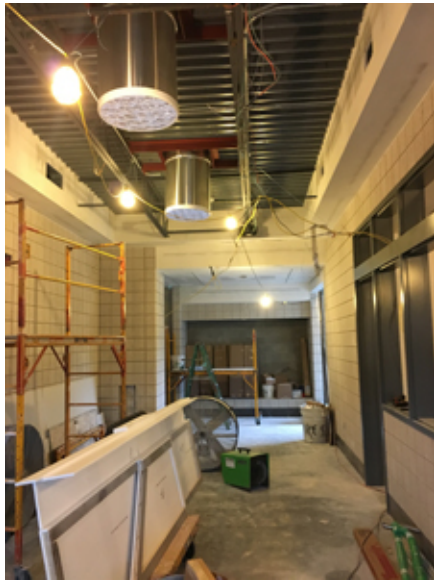
2018.11.26 – View of the Lobby area