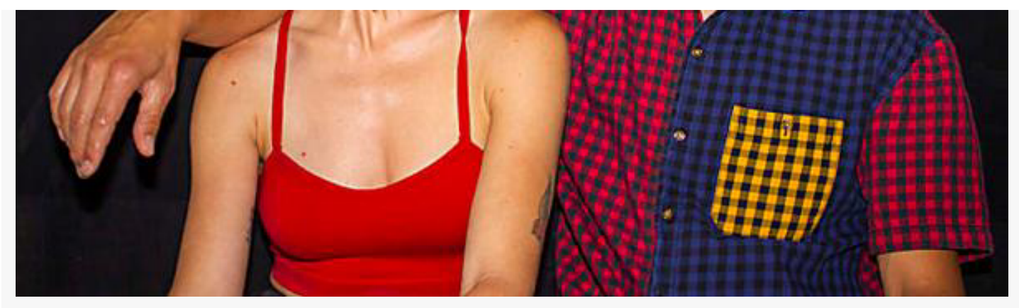
One Thing All Cheaters Have In Common, Brace Yourself Peoplewhiz