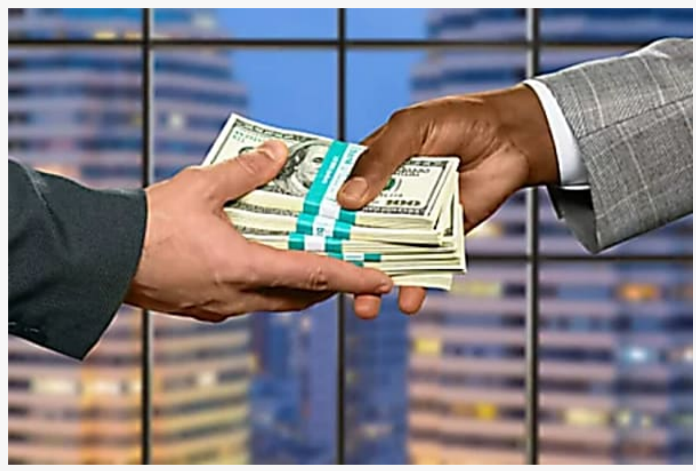
Money Grants From The Government That You Don't Have to Pay Back Top Government Grants | Search Ads

We're sending free samples to Lexington. Sign up now to get yours.