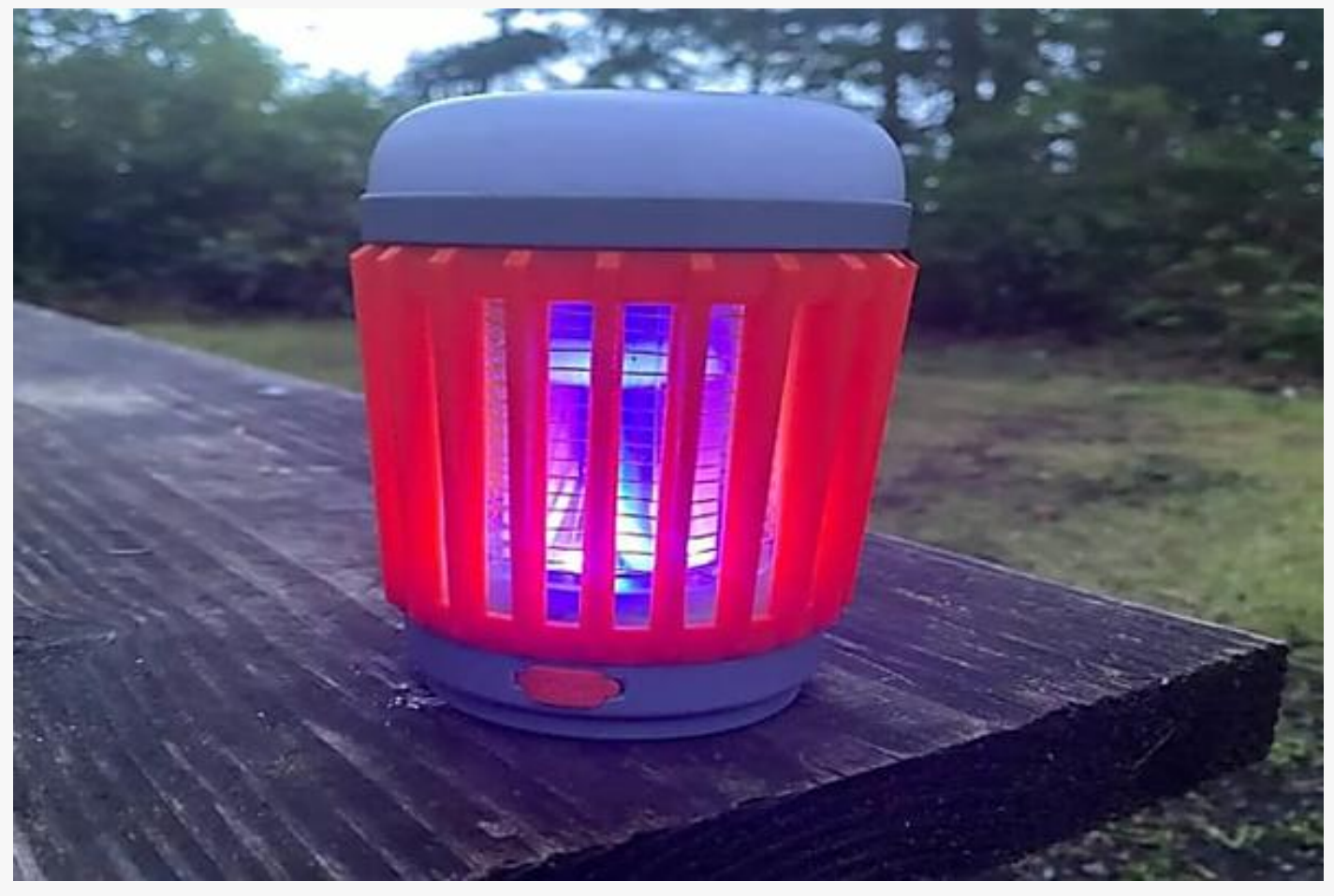
New Anti-Mosquito Device Is Changing Outdoor Life In Kentucky Best Future Gadgets