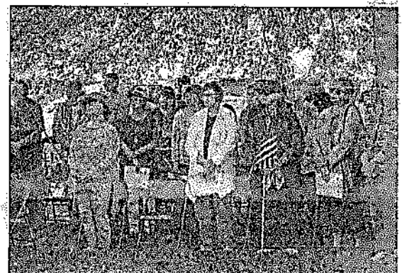
Pictured are some of those in attendance Monday at the Memorial Day Service at Harmon Park.