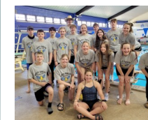
Scott HS Swim Team KHSAA Sports- manship Award