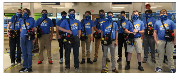
12 Scholars in the Building Maintenance Program at Gateway Community and Technical College earned their OSHA Certification.

71 cadets were in Kenton County's JROTC program this year, learning the values of citizenship, service to the community and to the United States, personal responsibility, and a sense of accomplishment.