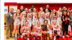
Dixie Heights girls basketball 9th Region champions