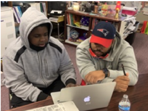
Student Support Program in partnership with UpSpring

MV Sponsored programs: Wildcat Hustlers Running Club (NIS/NHS)- over 20 participants Student Support Program (NHS)- 2 participants Diversity Wildcats (NIS)- 8 participants Parent Support Group- 7 participants