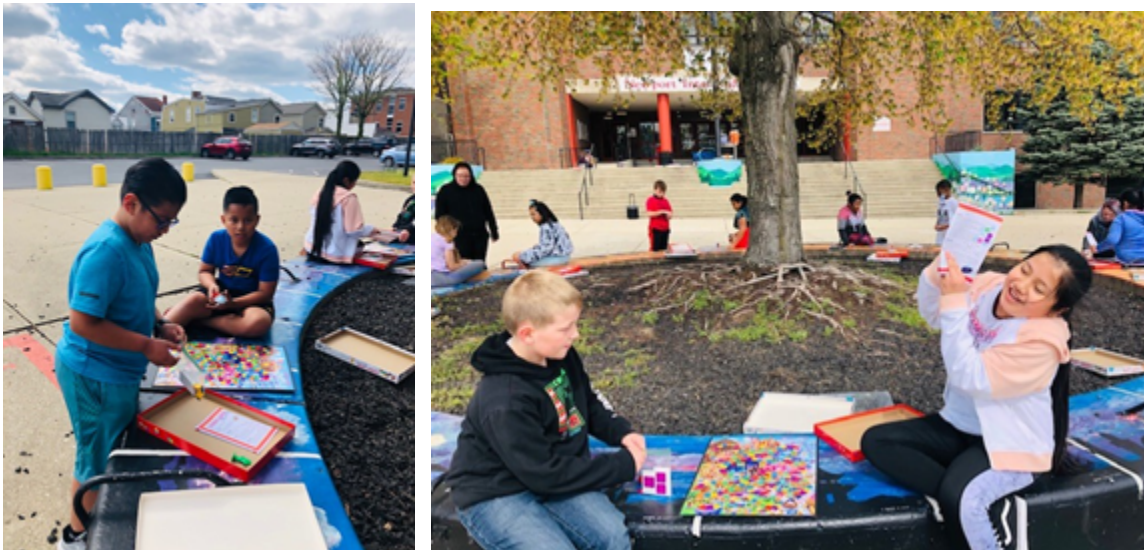
Candy Land Board Game Competition

21 st Century staff continues to meet with community partners and school staff to place the finishing touches on the upcoming Camp Wildcat programs at NPS/NIS.