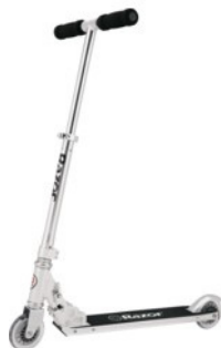
Razor Folding Scooter