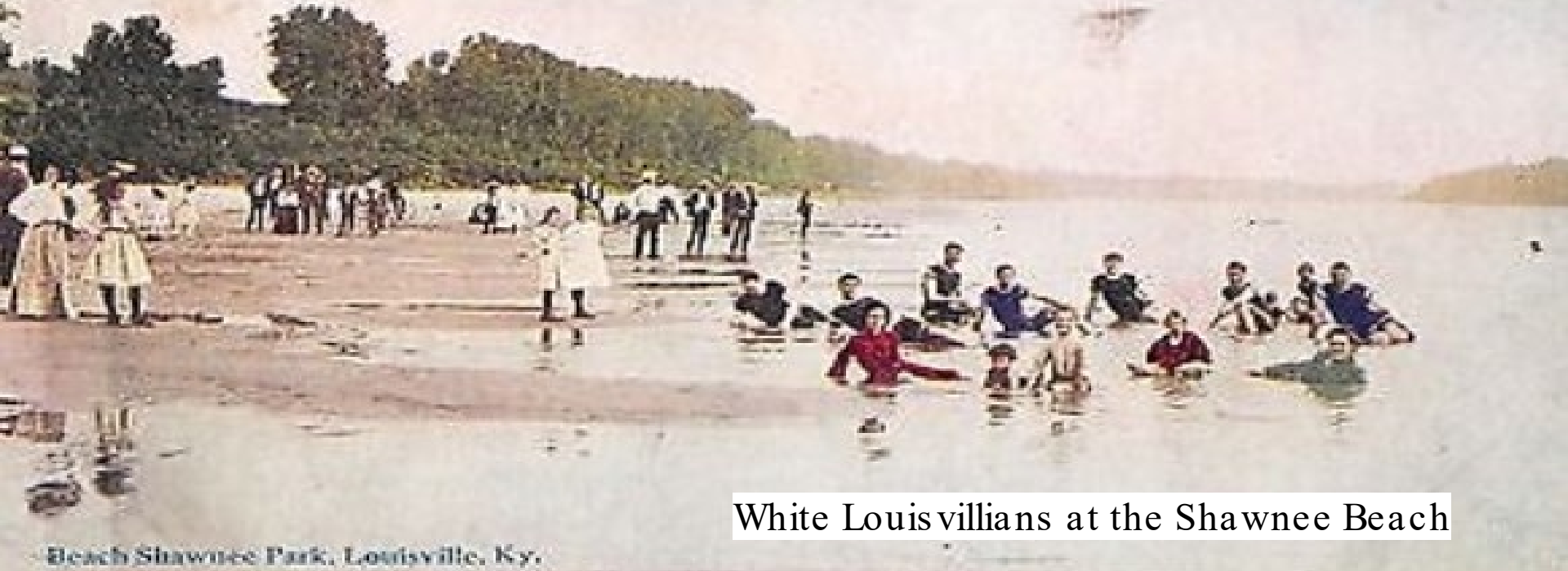
White Louisvillians at the Shawnee Beach

Innovative Centers Inside the Urban Core for the LOUISVILLE WE KNOW draft