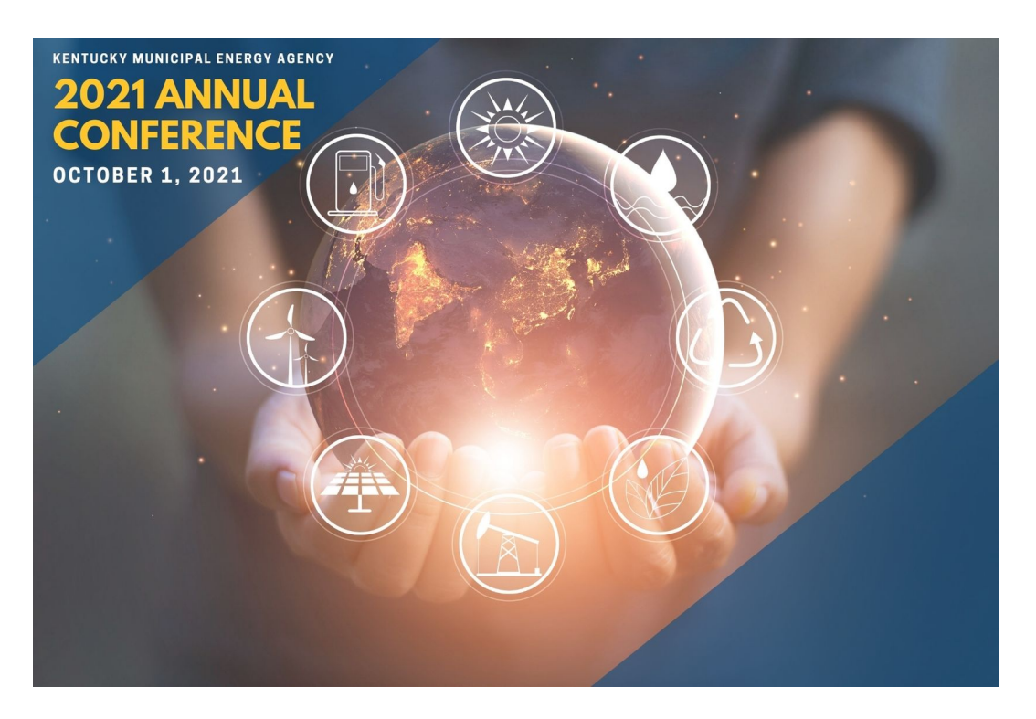
Hear from public power professionals on key topics that affect your community.