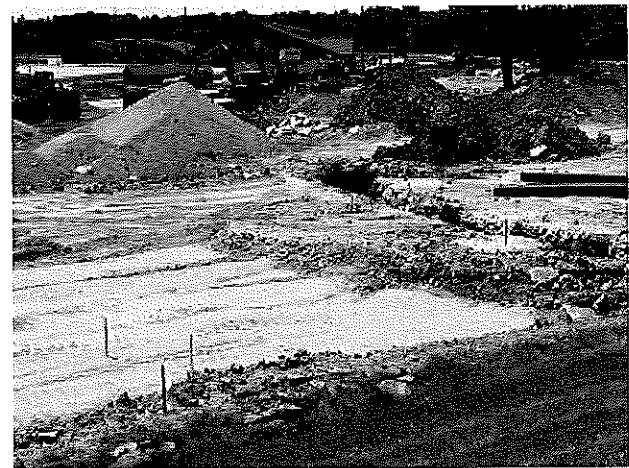
2018.07.18 – Storm trench and piping.