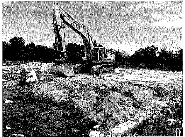
2018.07.03 – Down to slab at North end