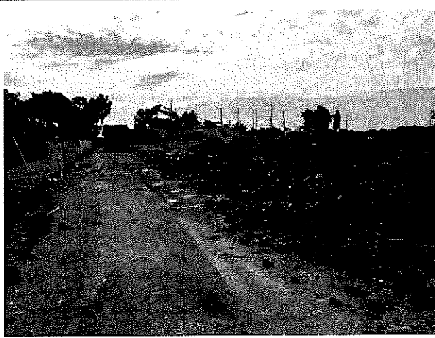
2018.07.03 – Active foundation removal.