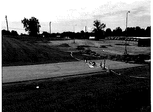
2018.07.03 – Looking towards Alternate lot.