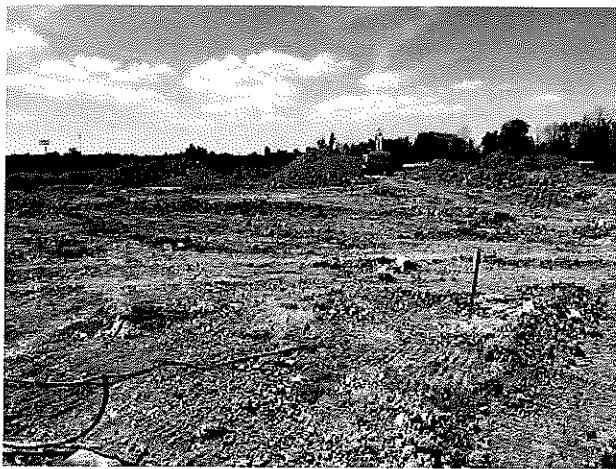
2018.07.18 – Former middle of building