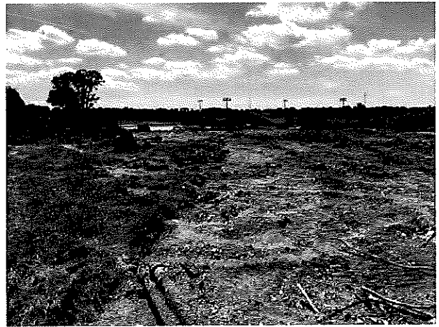
2018.07.18 – Looking towards new Twenhofel.