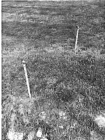
2018.07.03 – Light pole staking