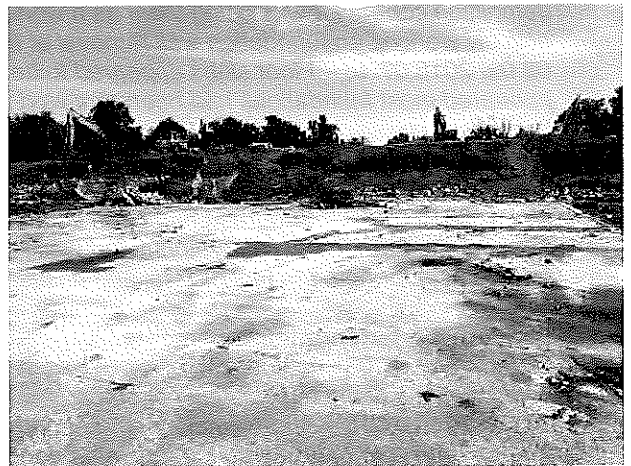
2018.07.03 – Looking North from South end.