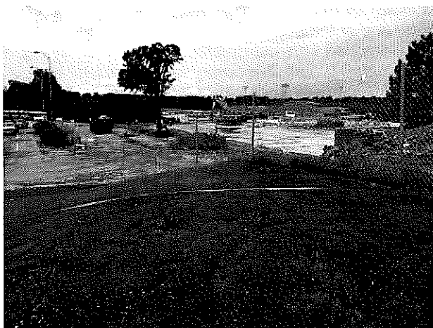
2018.07.03 – Looking towards new Twenhofel.