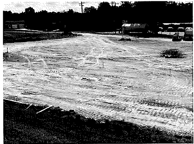
2018.07.18 – Looking towards transportation fuel tank.