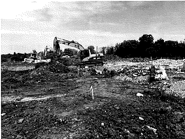
2018.07.03 – Foundation removal.