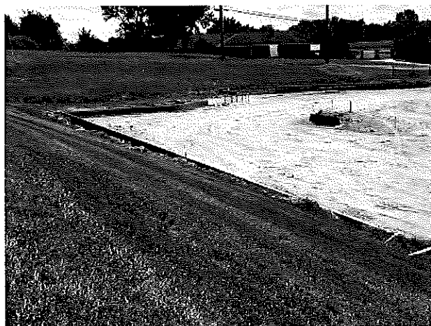
2018.07.18 – Looking at Alternate lot.