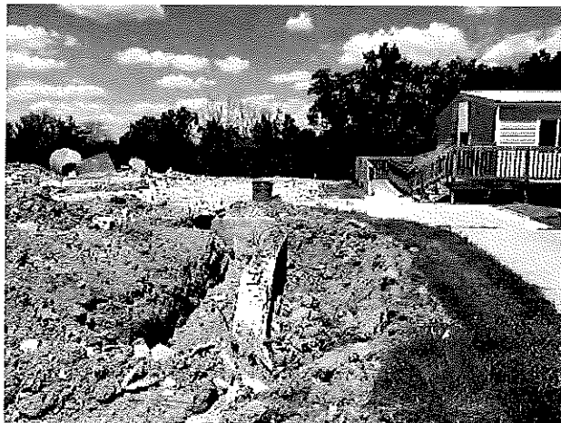
2018.07.18 – Looking north towards transportation mobiles.