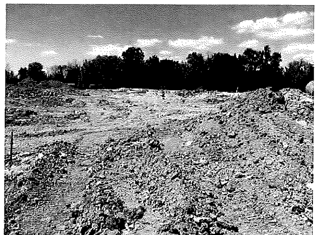
2018.07.18 – Former north end of building