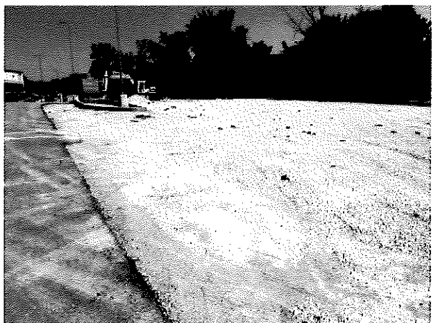
2018.07.13 – East lot, looking north.