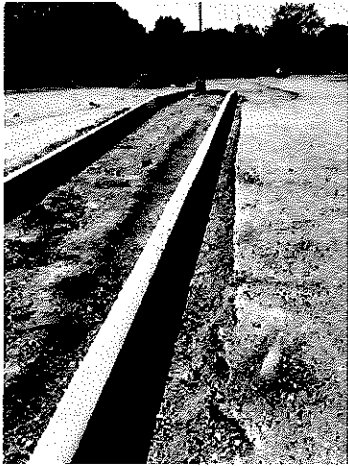
2018.07.13 – Island awaiting topsoil.