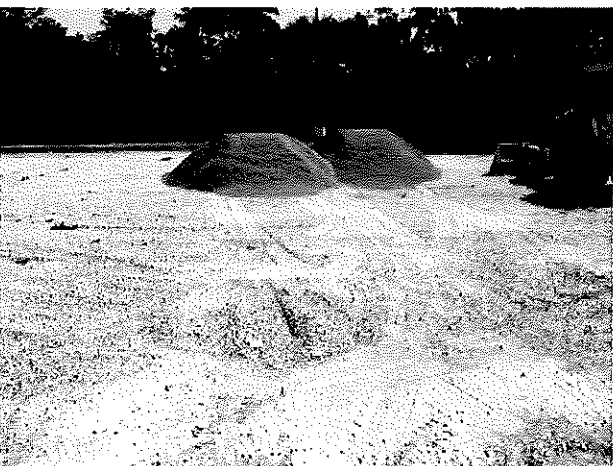
2018.07.13 – Gravel base awaiting installation.