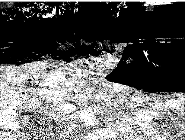
2018.07.13 – Temporary footings awaiting haul-off.