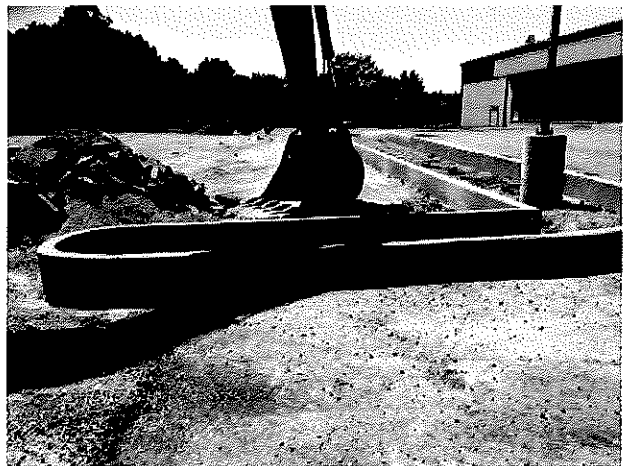
2018.07.13 – East lot, looking south.