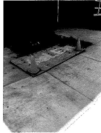
2018.07.13 – Awaiting flagpole installation.