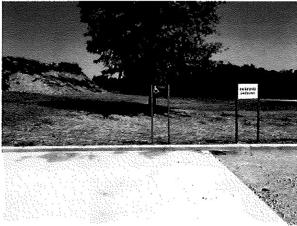
2018.07.13 – St. Charles' parcel to the north.