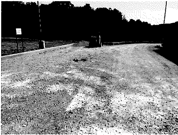
2018.07.13 – Gravel at drive along north edge of building.