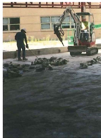
2018.06.19 – Removing flooring in former commons