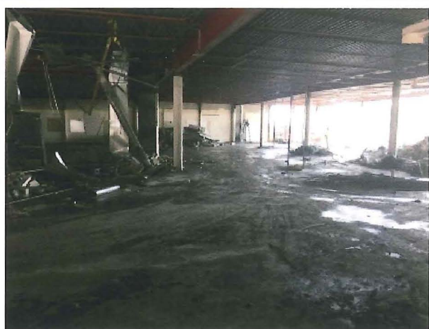
2018.06.19 – Upper level demolition