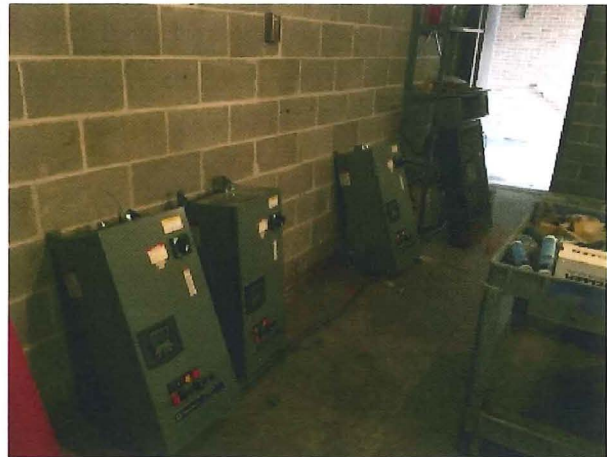
2018.06.12 – Electrical demolition in existing fire pump room