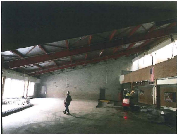
2018.06.12 – Former commons space.

20-28.03: 2018.06.19 – Assorted trapeze hangers had been installed at the underside of the upper level slab.