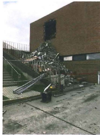
2018.06.12 – Dumping debris out a wall opening at the upper level