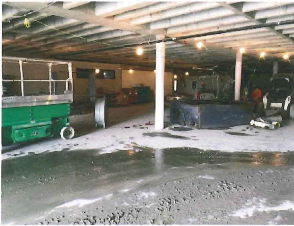
2018.06.12 – Lower level demolition