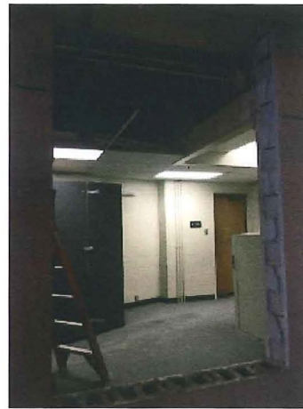
2018.06.19 – Opening for doors at future scene shop