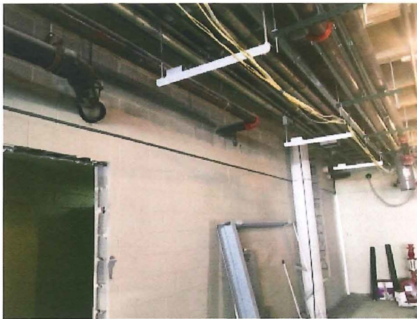
2018.06.19 – New hangers along east end of firewall