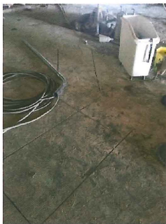
2018.06.19 – Saw cut for plumbing trench