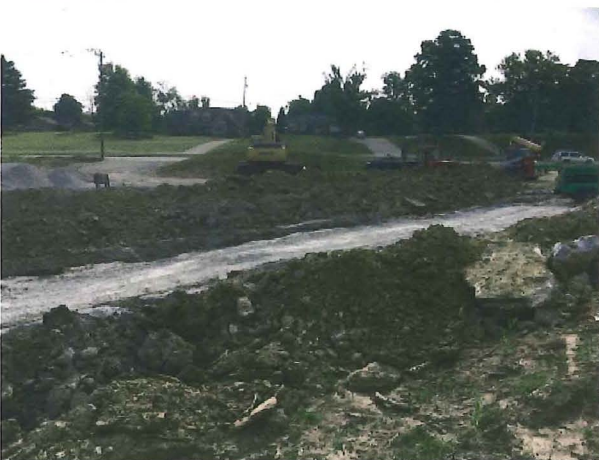
2018.06.19 – Circuit piping installation at well field