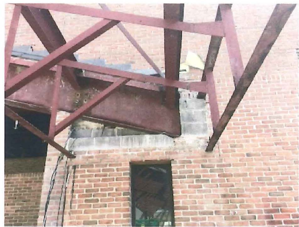
2018.06.19 – Exposed structure at courtyard