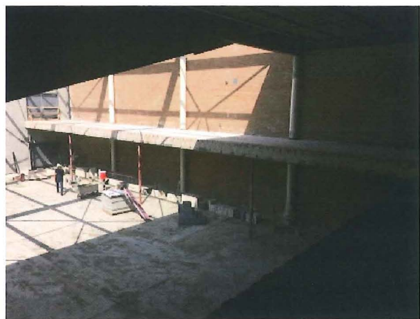
2018.06.19 – Looking down at former commons