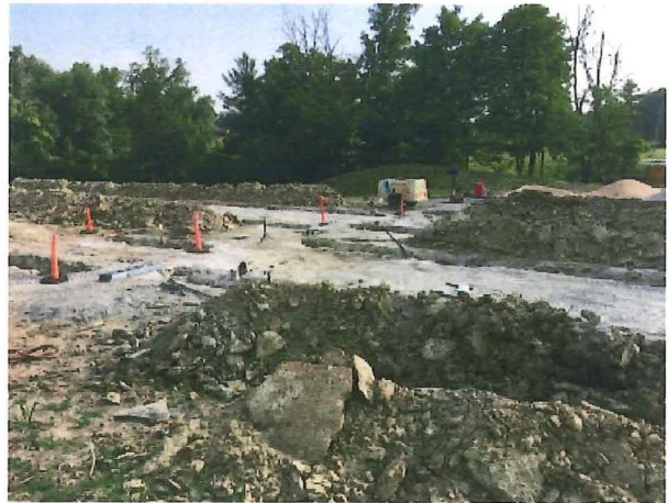
2018.06.19 – Circuit piping installation at well field