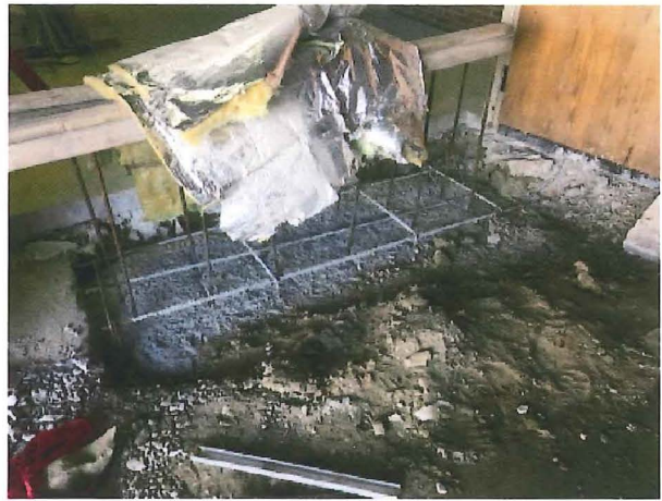
2018.06.19 – Footing at firewall portal frame