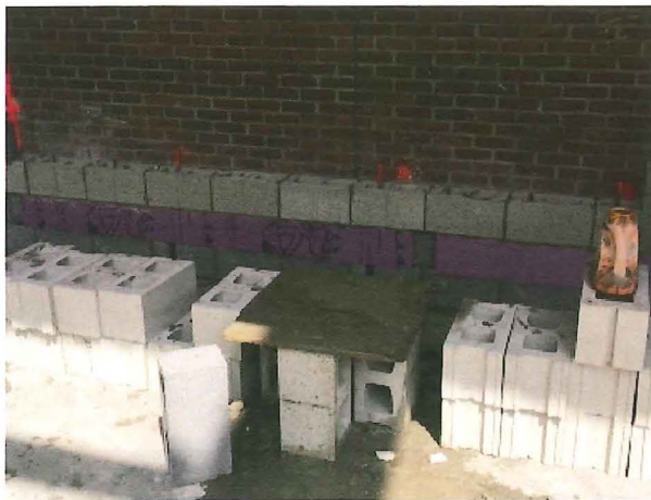
2018.06.19 – Masonry firewall started