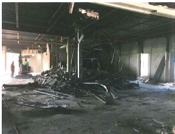
2018.06.19 – Upper level demolition