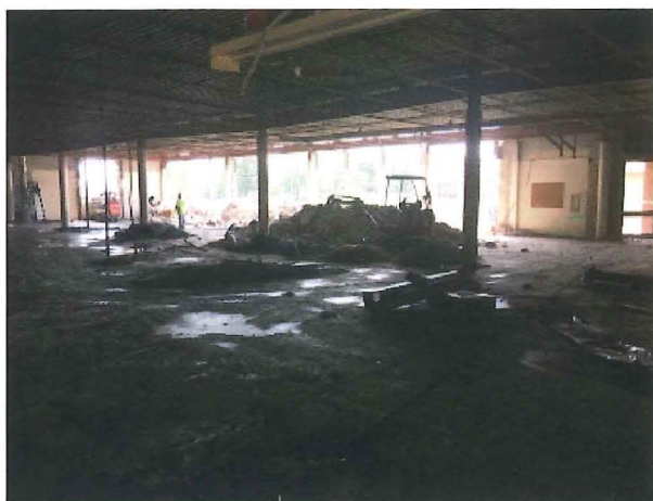
2018.06.19 – Upper level demolition