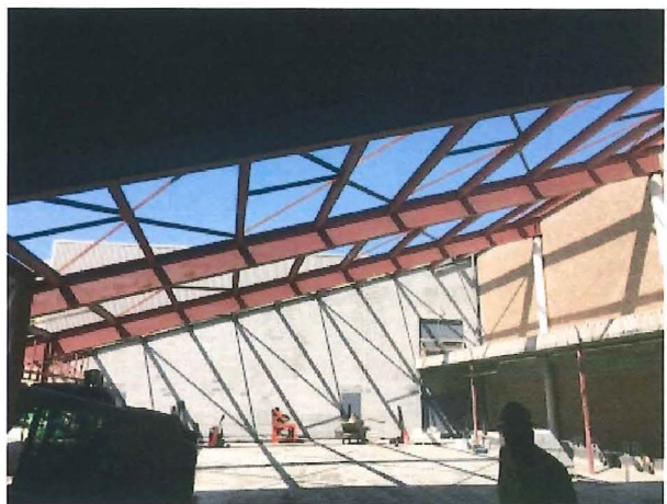
2018.06.19 – Former commons