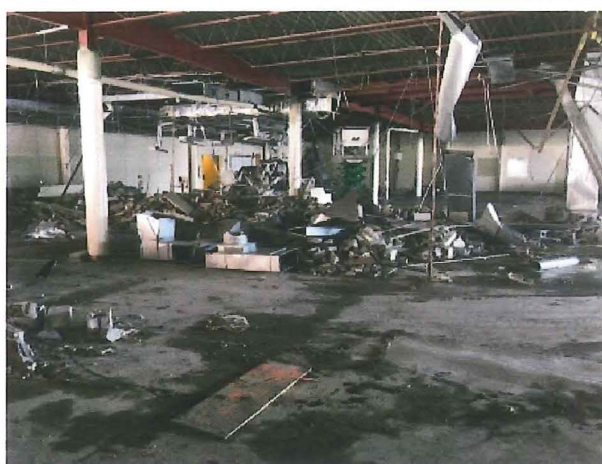
2018.06.19 – Upper level demolition