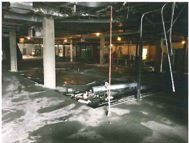
2018.06.12 – Lower level demolition