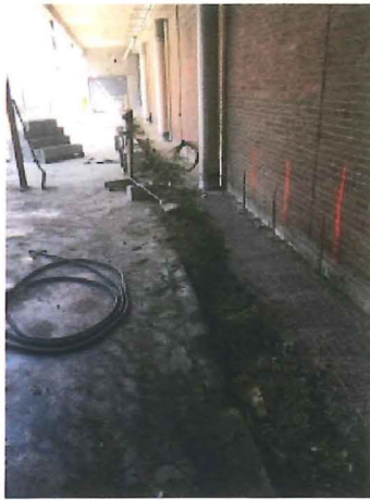
2018.06.19 – New footing at firewall