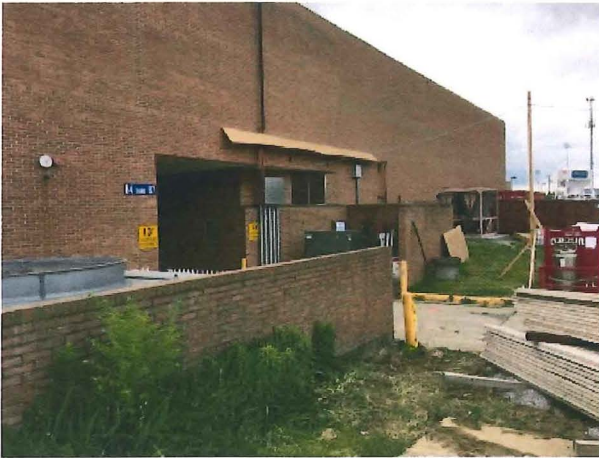
2018.06.12 – Protection at utilities to remain