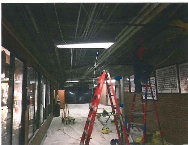
2018.06.19 – work in gym corridor