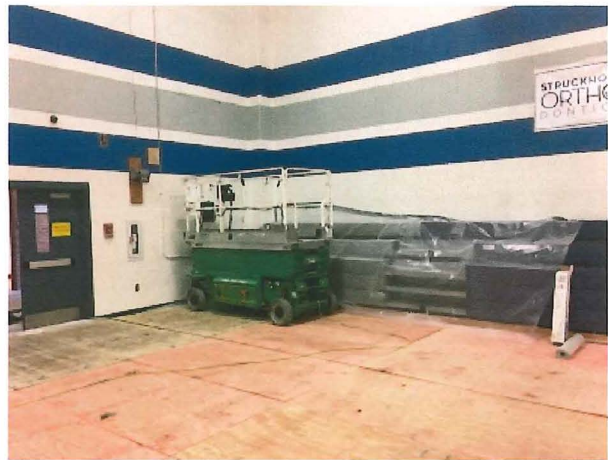
2018.06.19 – Floor protection in the gym