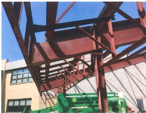
2018.06.19 – Exposed existing structure at courtyard