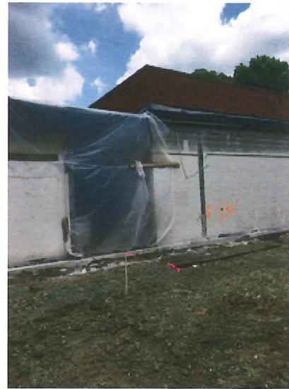
2018.06.18 – Demolition of the existing building has been completed.