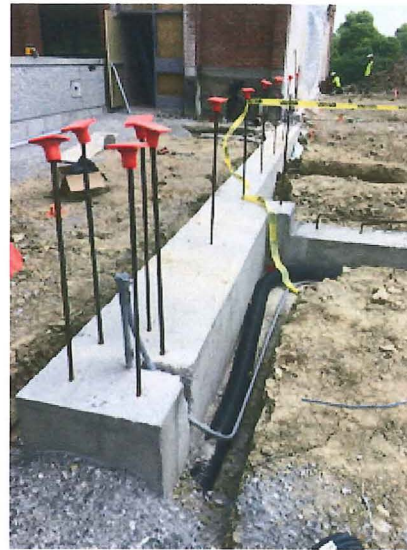
2018.06.18 – Installation of the building footings and stem walls for the new addition has started.