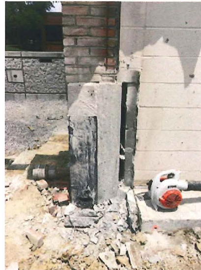
2018.06.18 – Demolition of the existing building has been completed.