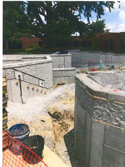
2018.06.18 – Installation of the exterior site and ramp walls continues.