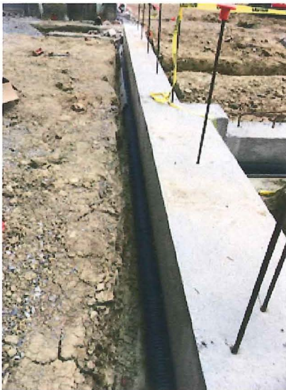
2018.06.18 – Installation of the building footings and stem walls for the new addition has started.