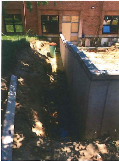
2018.06.04 – Installation of the exterior site and ramp walls continues.