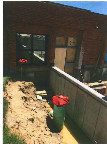
2018.06.04 – Installation of the exterior site and ramp walls continues.