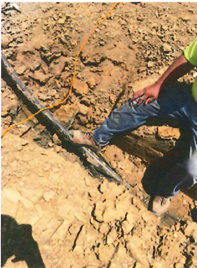
2018.06.18 – An abandoned underground electrical cable was discovered.