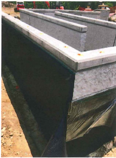
2018.06.18 – Waterproofing and protection board has been installed on the exterior site and ramp walls. Where the material is too high it will be cleaned off.