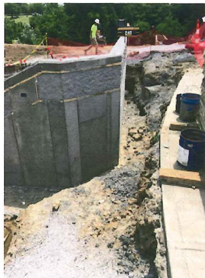
2018.06.18 – Installation of the exterior site and stair walls continues.