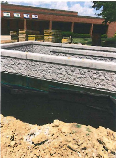
2018.06.18 – Waterproofing and protection board has been installed on the exterior site and ramp walls. Where the material is too high it will be cleaned off.