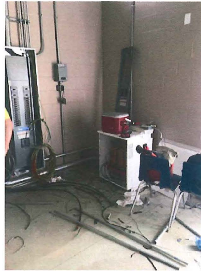
2018.06.18 – The transformer is being installed in Room No. 113.