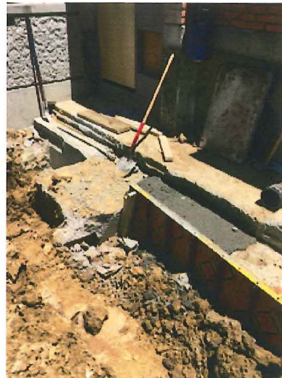
2018.06.04 – Underpinning outside Room No. 113 and 114 is in progress.