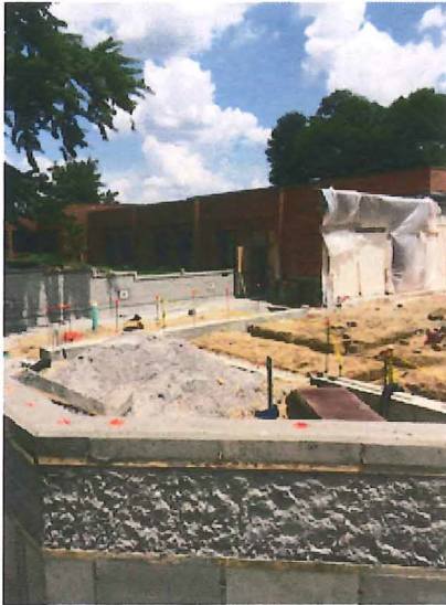
2018.06.18 – Installation of the exterior site and ramp walls continues.