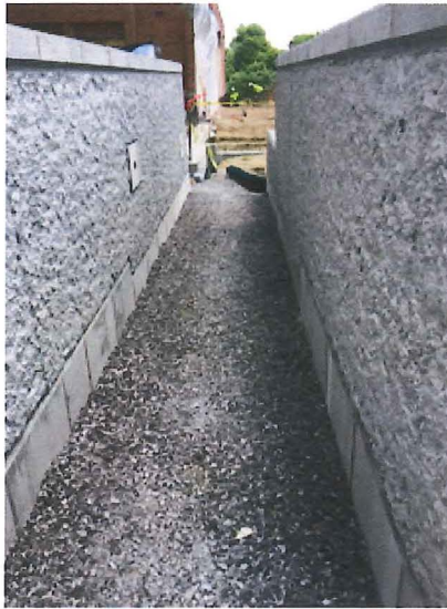
2018.06.18 – Installation of the exterior site and ramp walls continues.