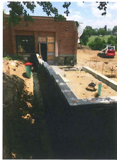
2018.06.18 – Waterproofing and protection board has been installed on the exterior site and ramp walls. Where the material is too high it will be cleaned off.