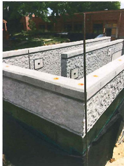
2018.06.18 – Waterproofing and protection board has been installed on the exterior site and ramp walls. Where the material is too high it will be cleaned off..