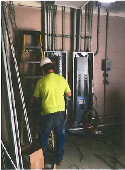
2018.06.18 – The electrical panels are being installed in Room No. 113.