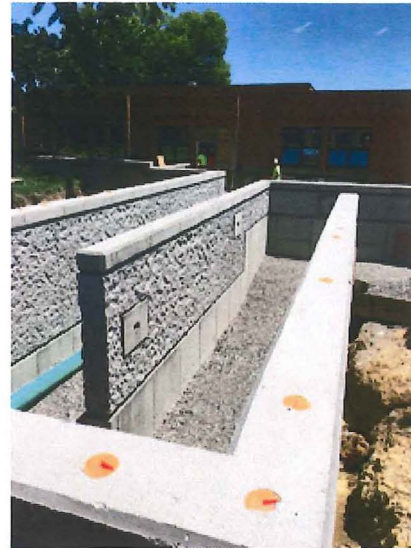
2018.06.04 – Installation of the exterior site and ramp walls continues.