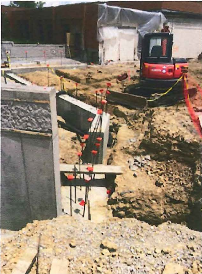
2018.06.18 – Installation of the building footings and stem walls for the new addition has started.