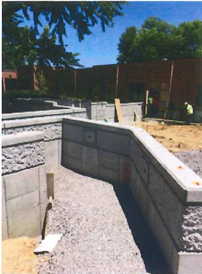
2018.06.04 – Installation of the exterior site and ramp walls continues.