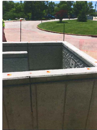
2018.06.04 – Installation of the exterior site and ramp walls continues.