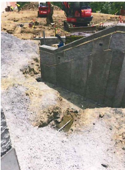
2018.06.18 – Installation of the exterior site and stair walls continues.