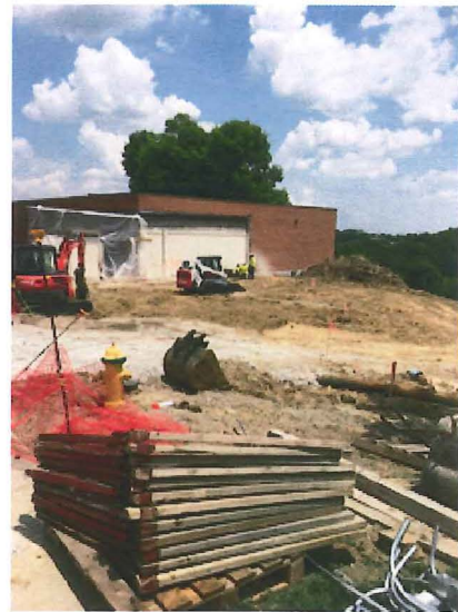
2018.06.18 – Demolition of the existing building has been completed.