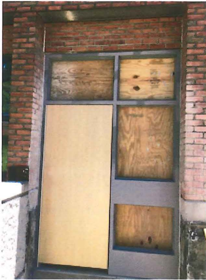
2018.06.04 – The door frame for the temporary exit from Room No. 114 has been installed.