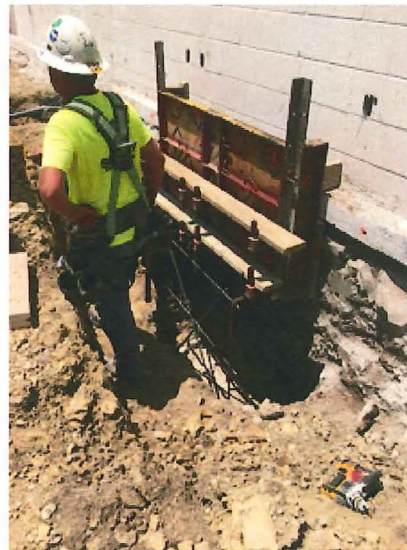
2018.06.18 – Underpinning of the existing building wall is in progress.