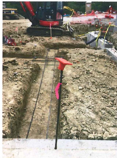
2018.06.18 – Installation of the building footings and stem walls for the new addition has started.