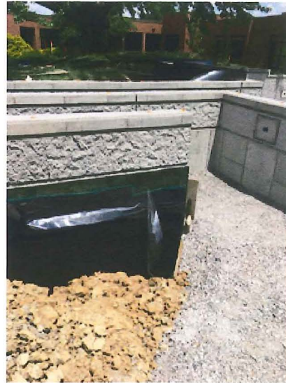
2018.06.18 – Waterproofing and protection board has been installed on the exterior site and ramp walls. Where the material is too high it will be cleaned off.