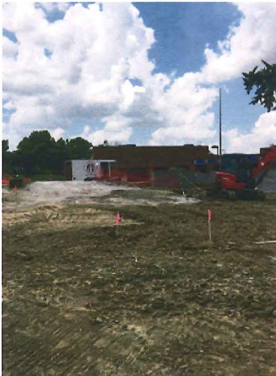
2018.06.18 – Demolition of the existing building has been completed.