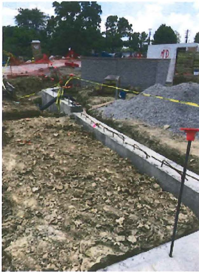
2018.06.18 – Installation of the building footings and stem walls for the new addition has started.