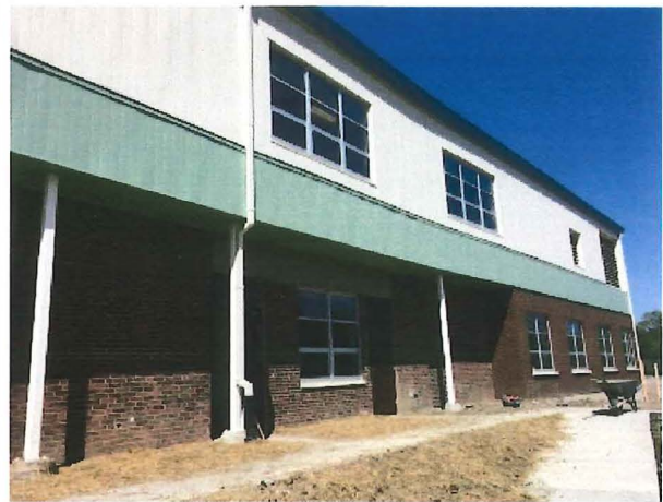
2018.05.10 – East elevation