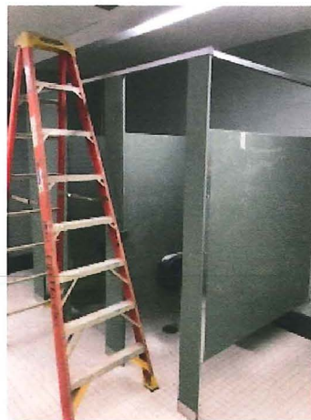
2018.05.10 – second floor restroom