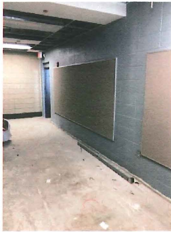
2018.05.10 – Corridor outside Art classroom