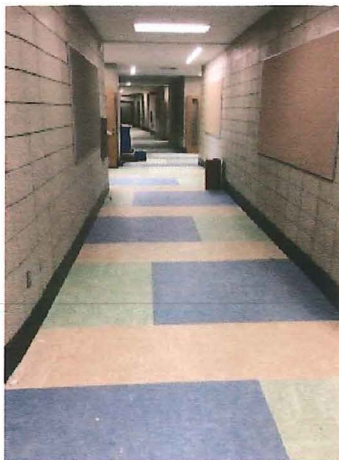
2018.05.10 – second floor corridor