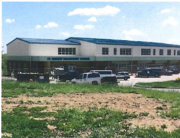
2018.05.10 – View from St. Charles