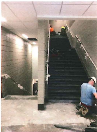
2018.05.10 – Flooring installation @ south stair