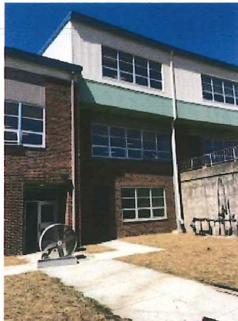
2018.05.10 – Approach to family resource entrance