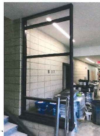
2018.05.10 – guard awaiting infill panels