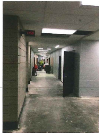
2018.05.10 – First floor corridor looking north