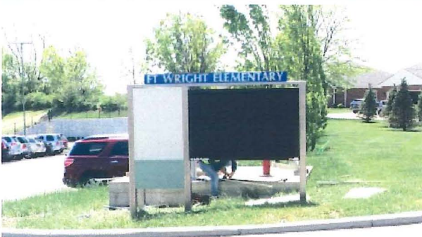
2018.05.10 – monument sign