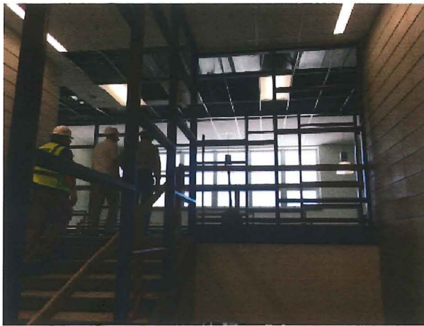
2018.05.10 – monumental stair