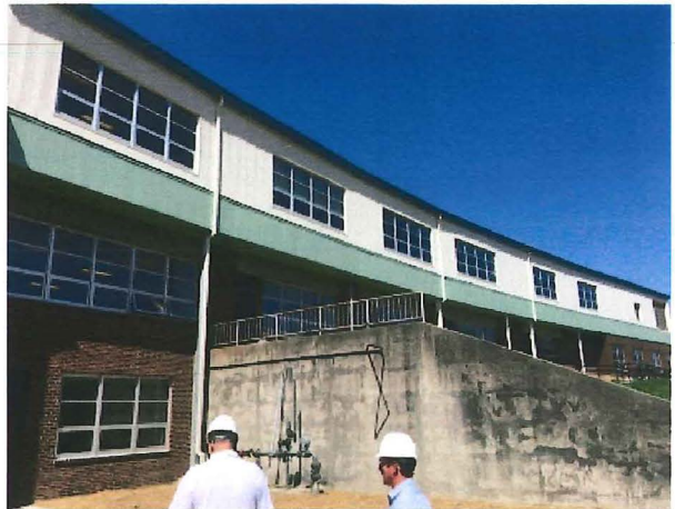
2018.05.10 – East elevation