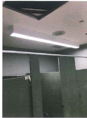
2018.05.10 – Basement restroom