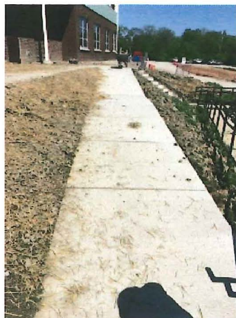
2018.05.10 – east exterior ramp