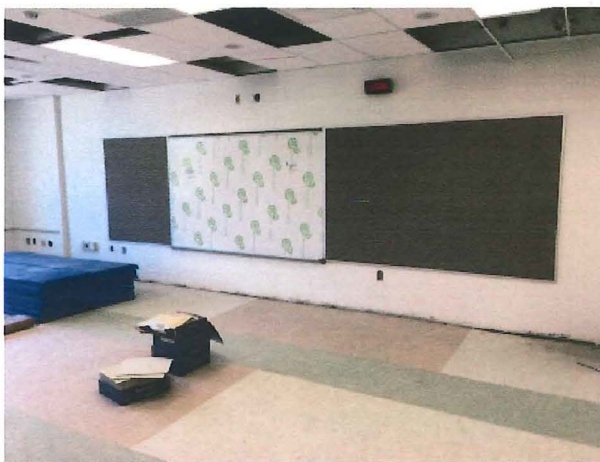
2018.05.10 – special needs classroom