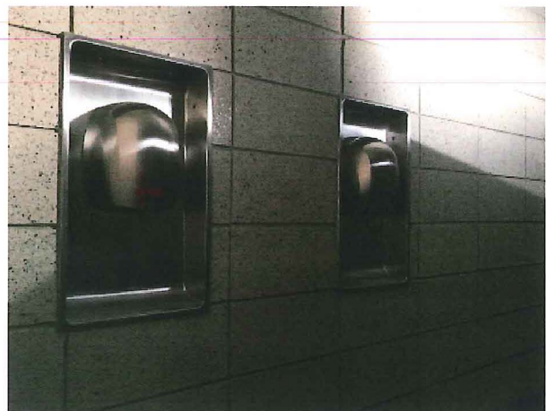
2018.04.12 – Hand dryers installed.