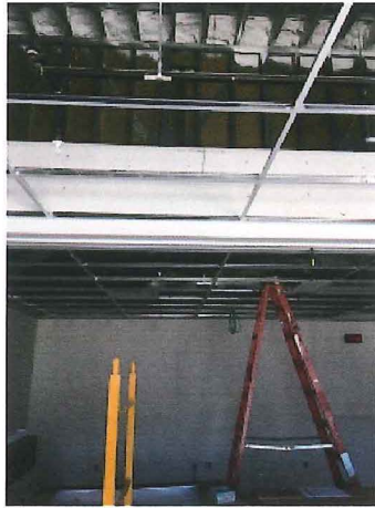
2018.04.12 – Resource room ceiling grid.