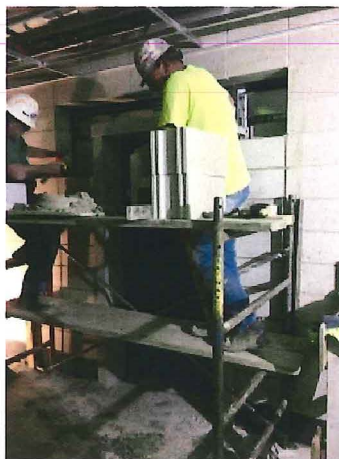
2018.04.12 – Masons infilling around elevator door.