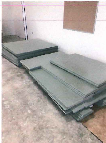
2018.03.29 – Toilet partitions staged for installation.