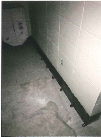
2018.03.29 – Base in restroom.