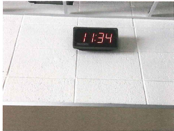
2018.04.12 – Basement clock working.