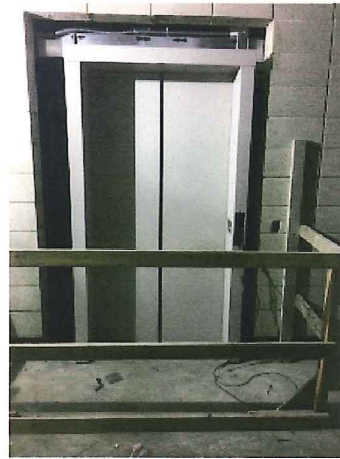
2018.03.29 – Elevator door installed.