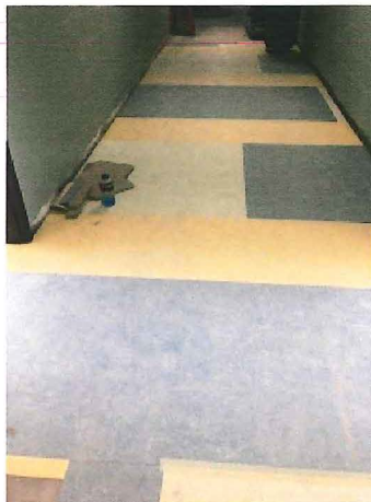
2018.04.06 – Flooring installed (corridor).