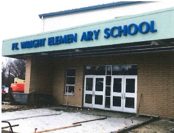
2018.03.29 – Entrance lettering with a missing "T."

20-28.05: 2018.04.12 – Electric hand dryers were installed and operational.