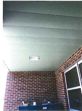
2018.04.12 – Soffit at former entrance.