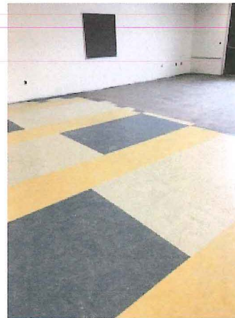
2018.04.06 – Flooring installed (classroom)