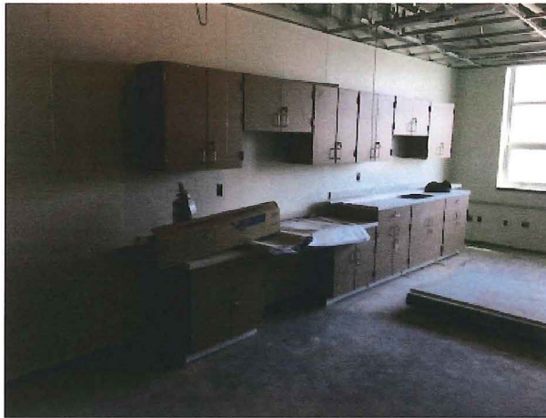
2018.04.12 – Art classroom casework.