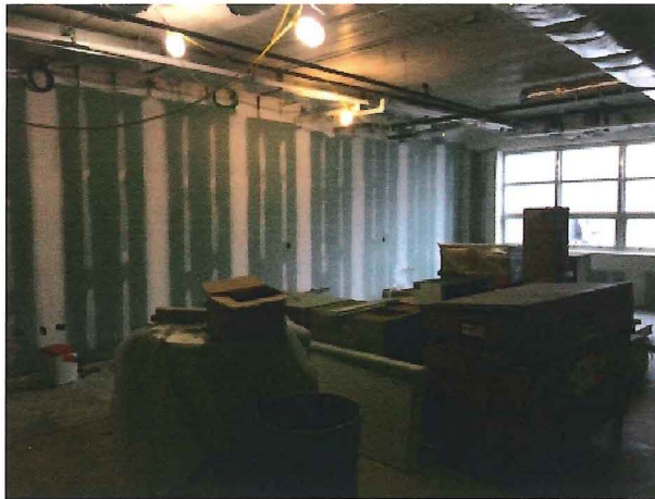
2018.03.29 – Basement art classroom.