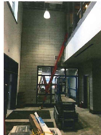
2018.03.29 – Lighting in entrance lobby.