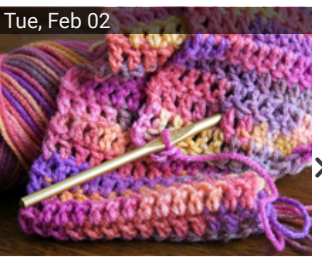
Crochet Club - South Point Library Briggs Library

FRI SAT SUN MON TUE WED THU 5 8 9 6 7 10 11