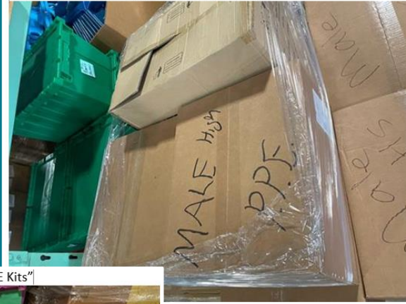
Male High School "Back-to-School PPE Kit"