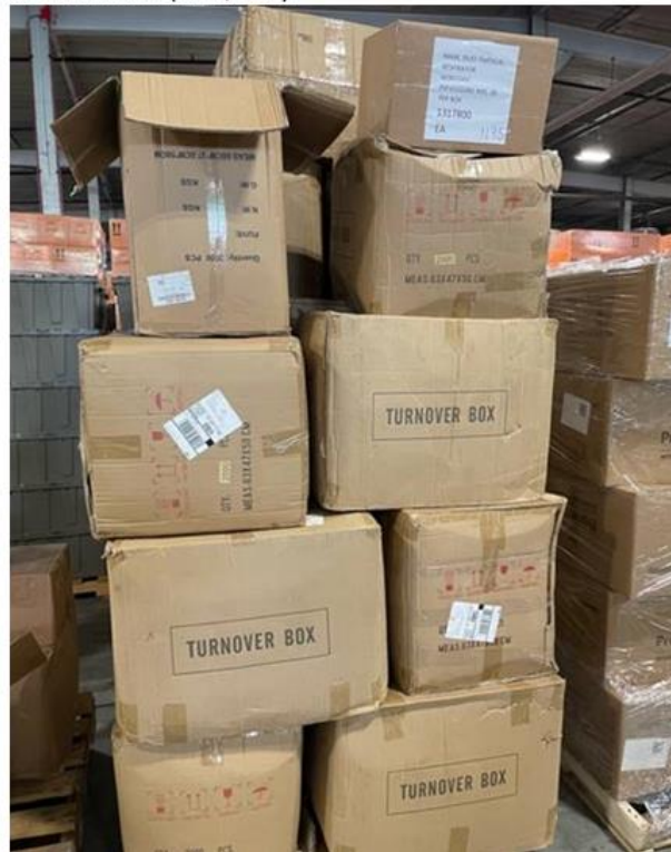
N-95 Masks (175,000)