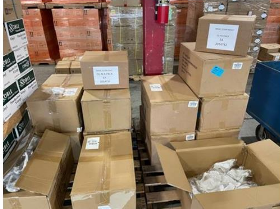
Masks with Clear Panel (2,200 Adult; 9,500 Child)