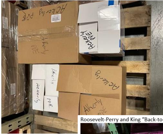
Ackerly "Back-to-School PPE Kit"