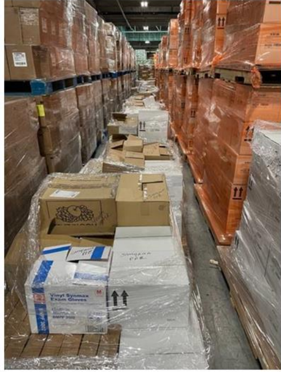
Multiple Schools' "Back-to-School PPE Kits"