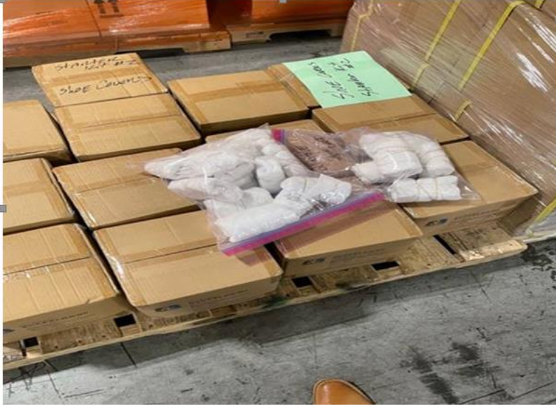
Shoe Covers (3,500)