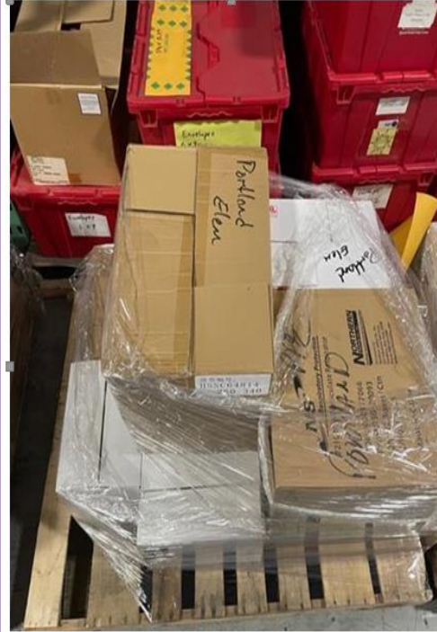
Portland Elementary "Back-to-School PPE Kit"