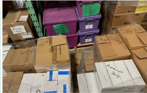
Roosevelt-Perry and King "Back-to-School PPE Kits"