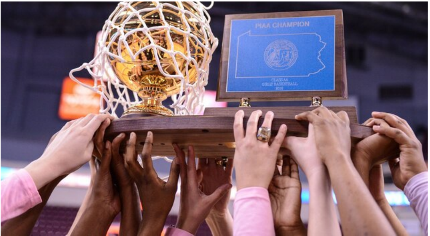
A close-up of the PIAA Class 2A girls' championship trophy from a 2016 file photo.