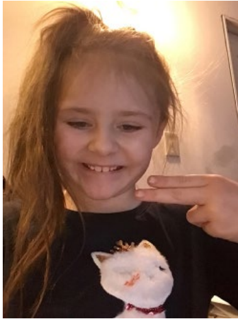
21CCLC Sign Language