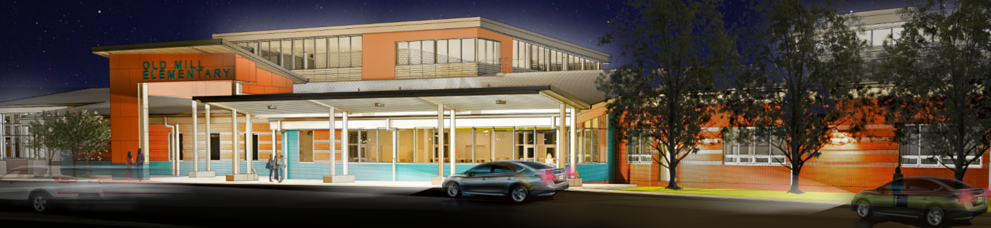
New Elementary School in Mt Washington - Post-Bid Update November 9, 2020 - BCPS Board Work Session