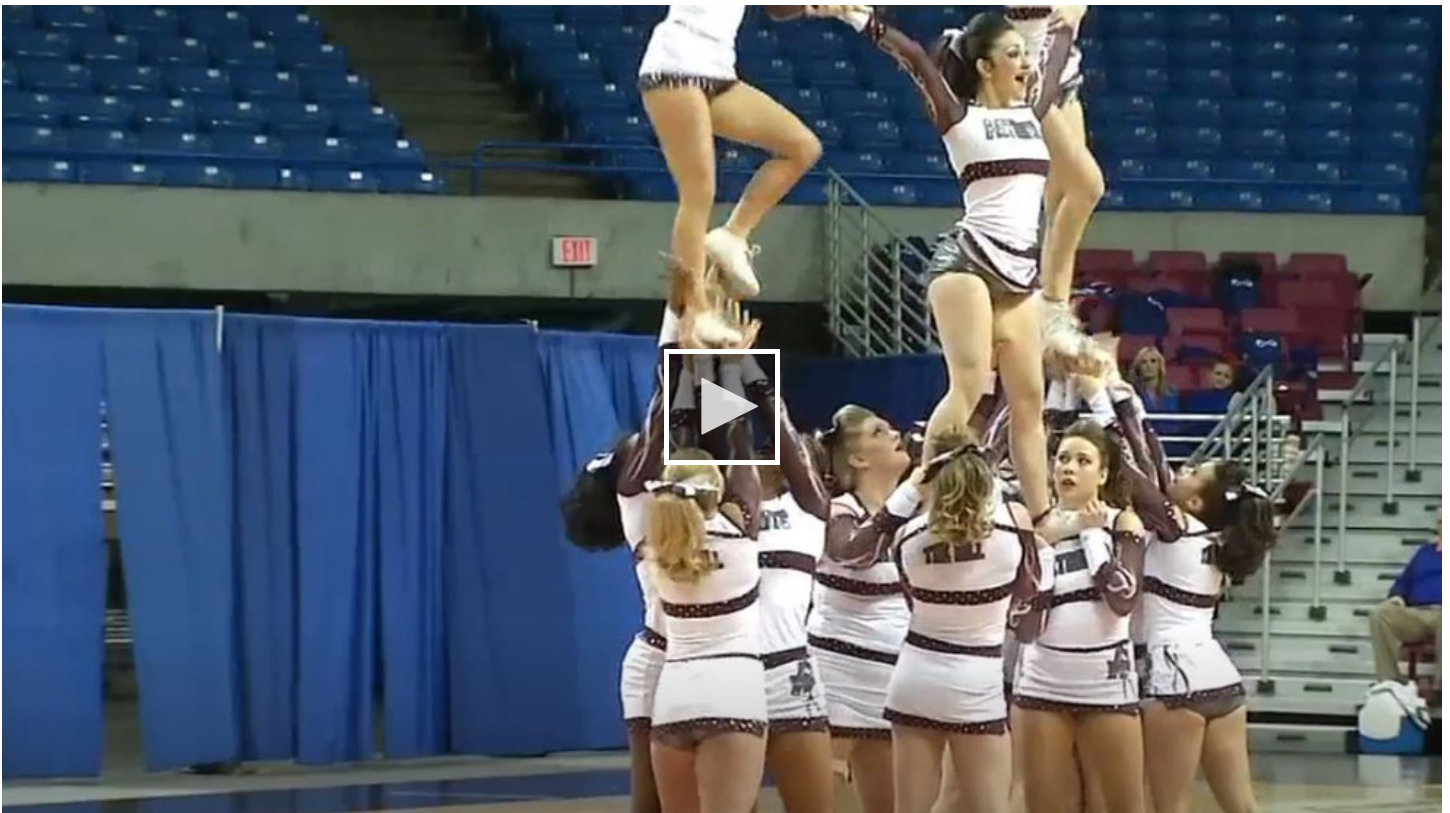
The WVSSAC released new guidelines for fall cheerleading including no stunts, mandatory masks and social distancing.