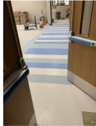
2020.08.04 – Flooring install at RC Hinsdale