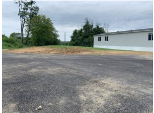
2020.08.18 – Area to be cut down at White's Tower