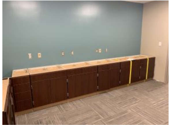
2020.08.04 – Casework install at River Ridge