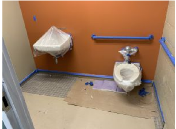
2020.08.04 – Nurse restroom at Ryland Heights