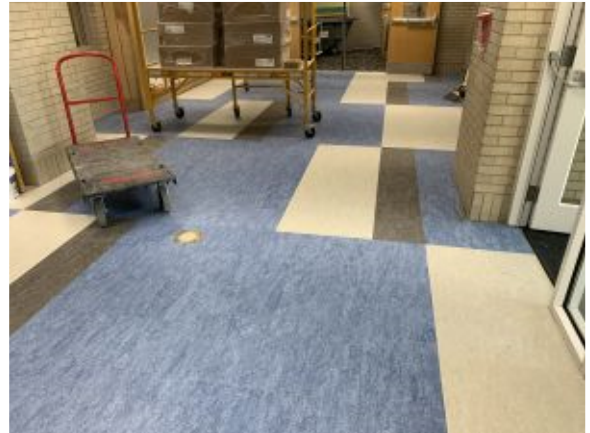
2020.08.04 – Flooring install at River Ridge