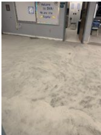
2020.08.04 – Floor prep at Summit View