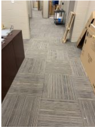
2020.08.04 – Flooring at River Ridge