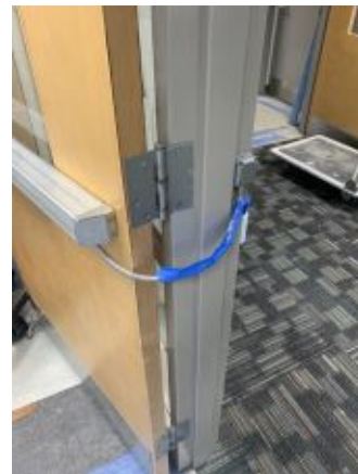
2020.08.04 – Access control wiring at River Ridge