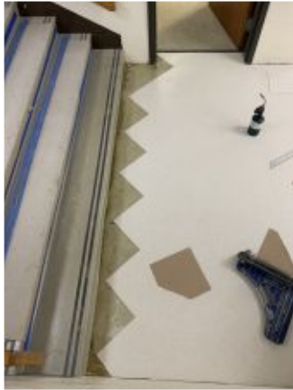
2020.08.04 – Flooring install at RC Hinsdale