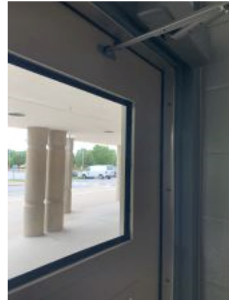
2020.08.04 – Perimeter film seal at Summit View