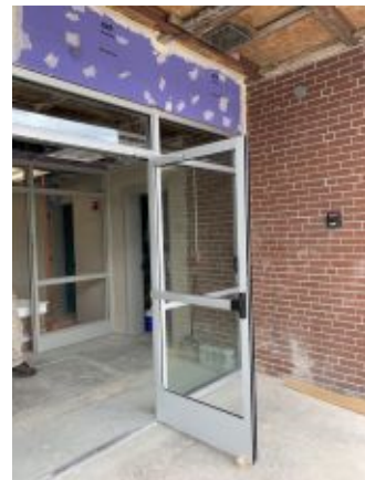
2020.08.04 – Temporary storefront at Ryland Heights