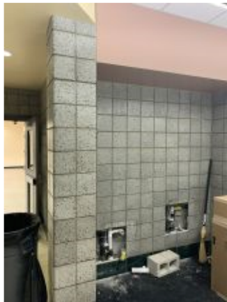
2020.08.04 – Pending drinking fountain install at Caywood

31.01: 2020.08.18 – The sitework contractor had yet to perform cutting in the new swale at the new parking lot near the mobiles. The contractor was advised of the deficiency.