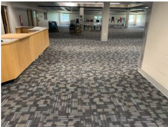
2020.08.04 – Flooring install at River Ridge