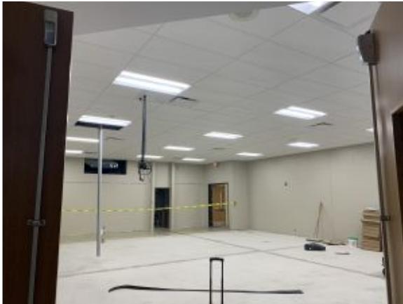
2020.08.04 – Ceiling install at RC Hinsdale