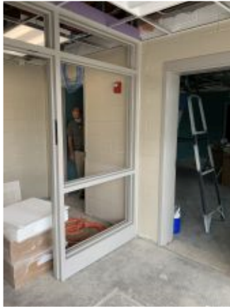
2020.08.04 – Painted door frames at Ryland Heights