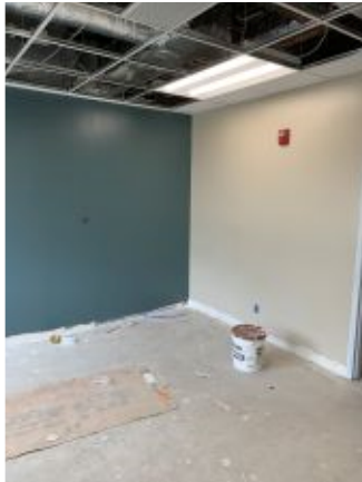
2020.08.04 – Ceiling install at Ryland Heights