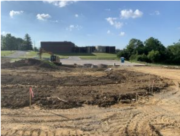
2020.07.14 – White's Tower topsoil distribution