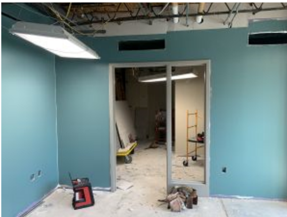
2020.07.14 – Ryland General Office