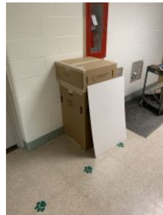
2020.07.14 – Drinking fountain awaiting installation at Ryland