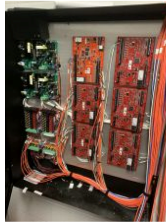
2020.07.14 – River Ridge access control panel