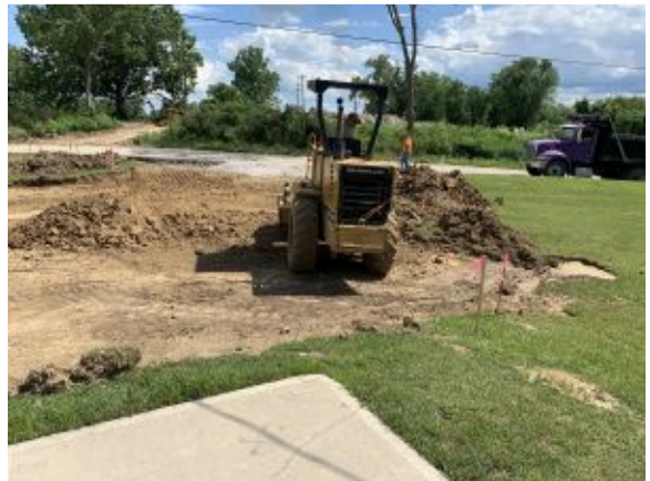
2020.06.25 – White's Tower parking lot