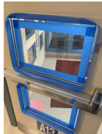
2020.07.14 – Summit View masking for perimeter seal installation at safety film