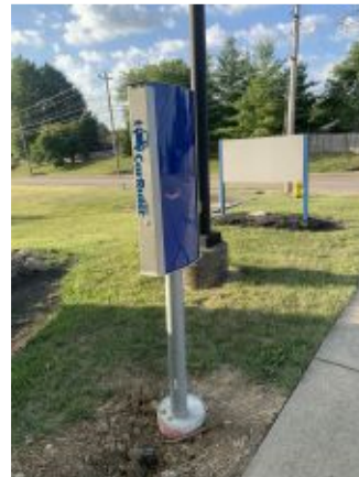
2020.07.14 – River Ridge Car Rider Pro sensor