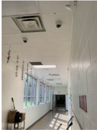
2020.07.14 – Ryland interior cameras