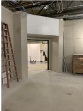
2020.07.07 – Hinsdale Media Center