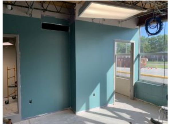
2020.07.14 – Ryland General Office