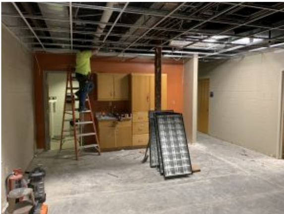
2020.07.14 – River Ridge staff lounge