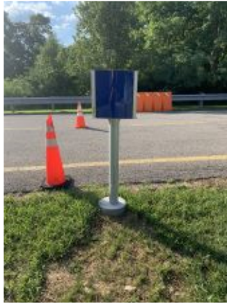
2020.07.14 – Summit View Car Rider Pro unit