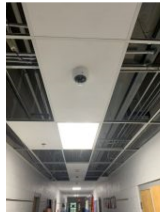
2020.07.14 – River Ridge corridor camera