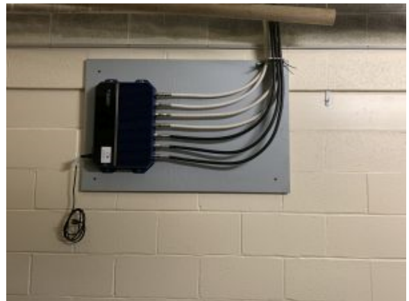
2020.07.14 – Hinsdale DAS control unit