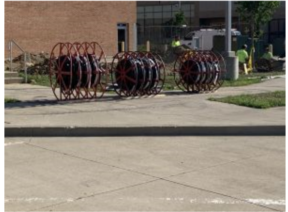
2020.07.14 – Woodland service conductors