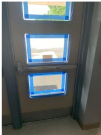
2020.07.14 – Summit View masking for perimeter seal installation at safety film