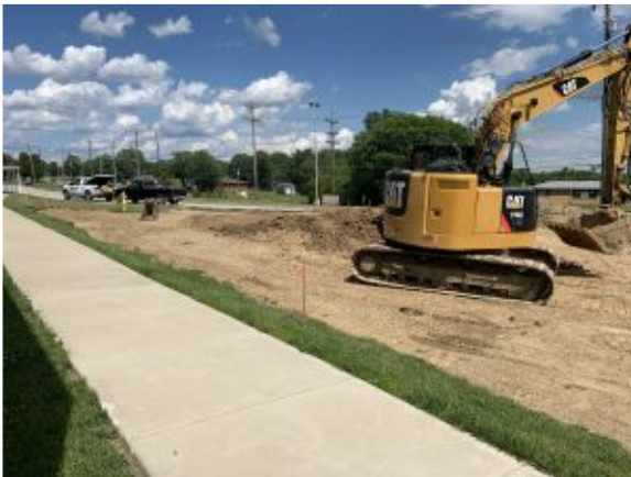
2020.06.25 – White's Tower parking lot

32.01: 2020.07.08 – Fencing punch list for the project was issued, along with a Request for Proposal to enlarge an opening at Piner for vehicle access and add a gate at Kenton Elementary for student management.