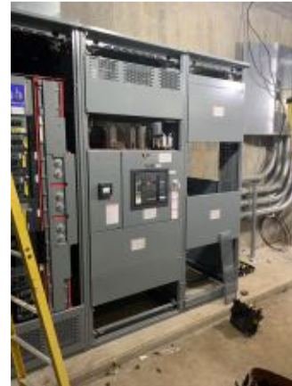
2020.07.14 – Woodland electric service gear