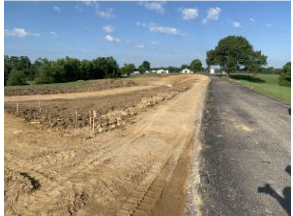
2020.07.14 – White's Tower drive widening area