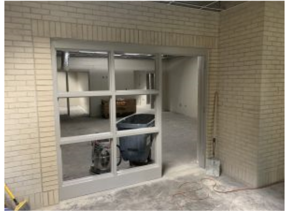
2020.07.14 – River Ridge looking into admin.