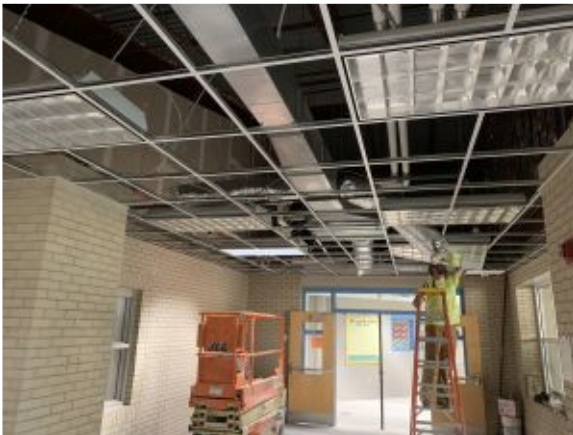
2020.07.14 – River Ridge lobby