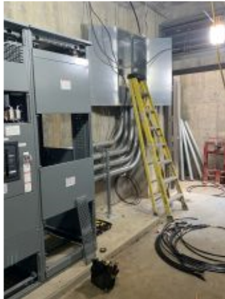
2020.07.14 – Woodland electric service gear