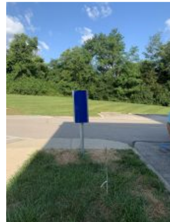
2020.07.14 – Hinsdale Car Rider Pro unit