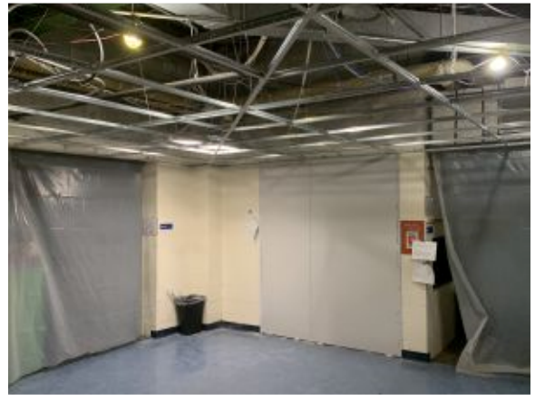
2020.07.14 – Hinsdale Willow Pod alcove