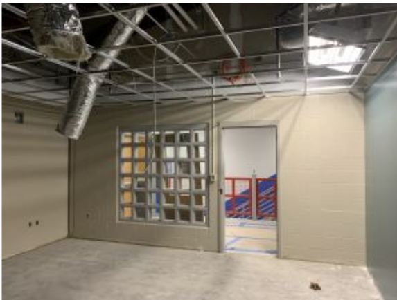
2020.07.14 – River Ridge Principal's Office