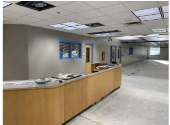
2020.07.14 – River Ridge Media Center