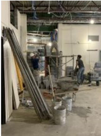
2020.06.09 – Masonry work at Hinsdale