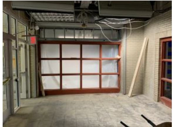
2020.06.09 – Window at River Ridge