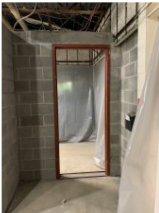
2020.06.09 – Door frame installed at Hinsdale