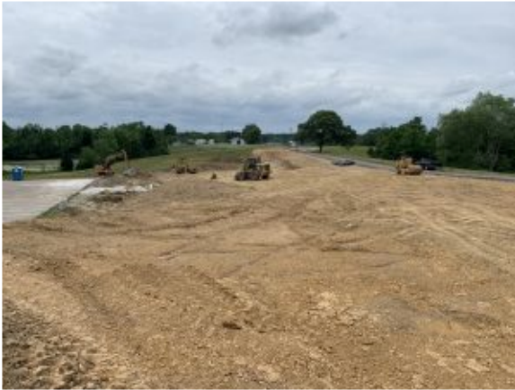
2020.06.09 – Earthwork at White's Tower