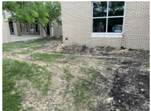
2020.06.09 – Push pier backfill at River Ridge