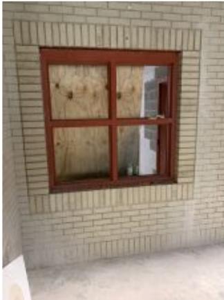
2020.06.09 – Window at River Ridge