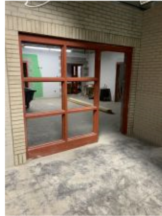
2020.06.09 – Door frame at River Ridge