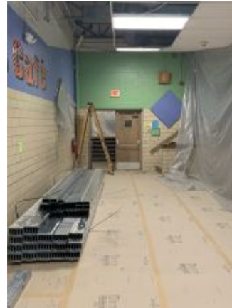
2020.06.09 – Cafeteria demo at Ryland