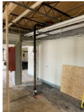
2020.05.21 – Roof drain leader previously concealed in wall at Ryland