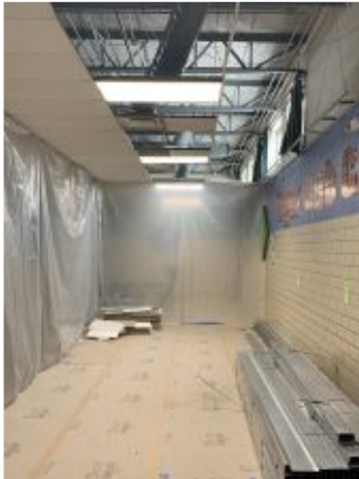
2020.06.09 – Cafeteria demo at Ryland