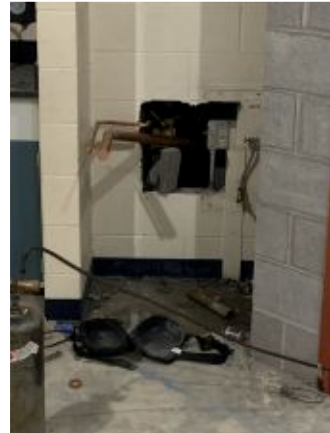
2020.06.09 – Plumbing rough-in at Hinsdale