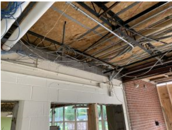
2020.05.21 – Fire barrier at Ryland stops short of deck