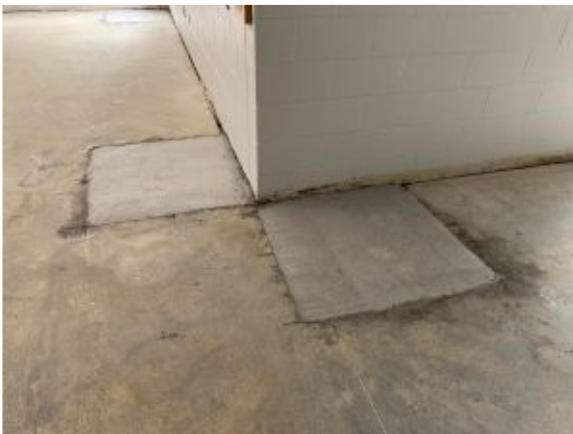
2020.06.09 – Patched slab at interior push pier at River Ridge