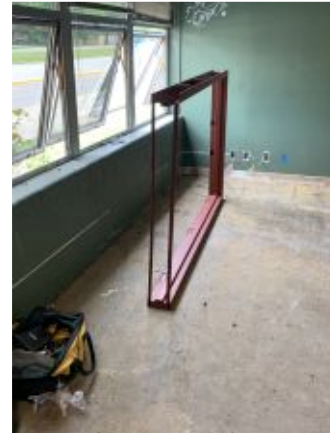
2020.06.09 – Frame waiting to be set at Ryland