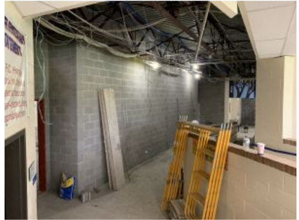
2020.06.09 – New media center wall at Hinsdale