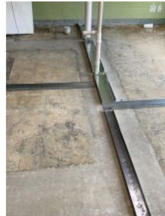
2020.06.09 – Plumbing rough-in through floor track at Ryland