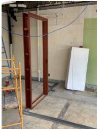
2020.06.09 – Frame set at Ryland