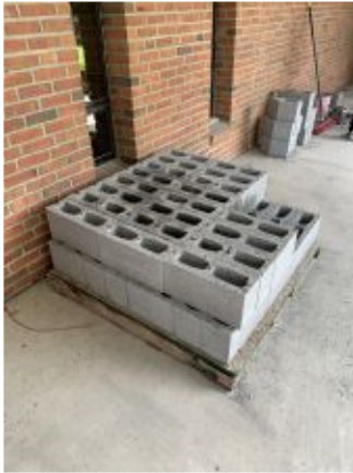
2020.06.09 - Masonry staged at Hinsdale