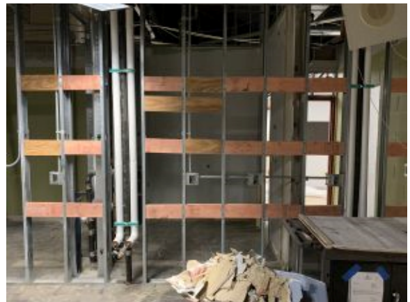
2020.06.09 – Blocking at River Ridge