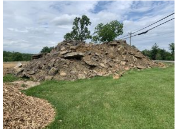
2020.06.09 – Undercut at White's Tower