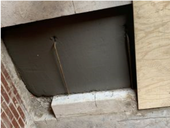
2020.06.09 – New footing at Ryland