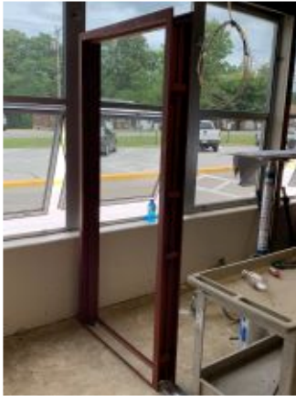
2020.06.09 – Door frame set at Ryland